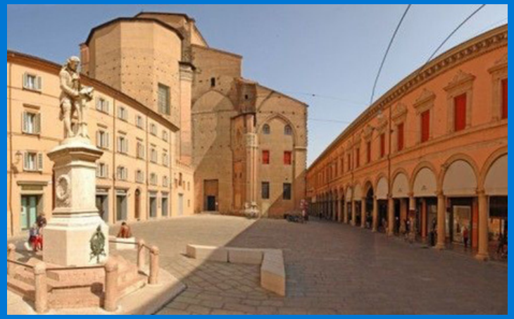
The Porticoes of Bologna (Italy). Silvia Summa © LINKS Foundation