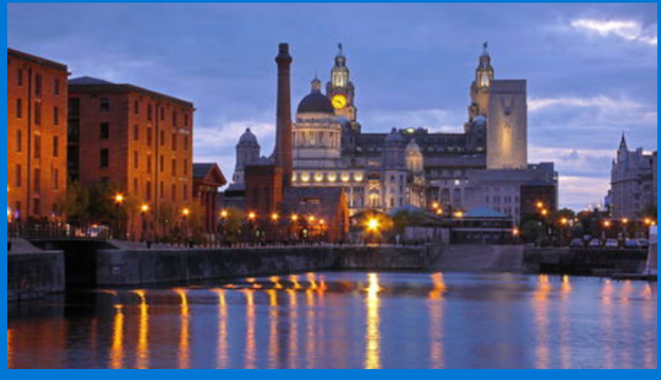
"Liverpool – Maritime Mercantile City

After reviewing the reports, the Committee recognised three properties – the Great Wall of China, Tai National Park and Comoe National Park (both of the latter located in Cote d'Ivoire) – as good cases of conservation and management.