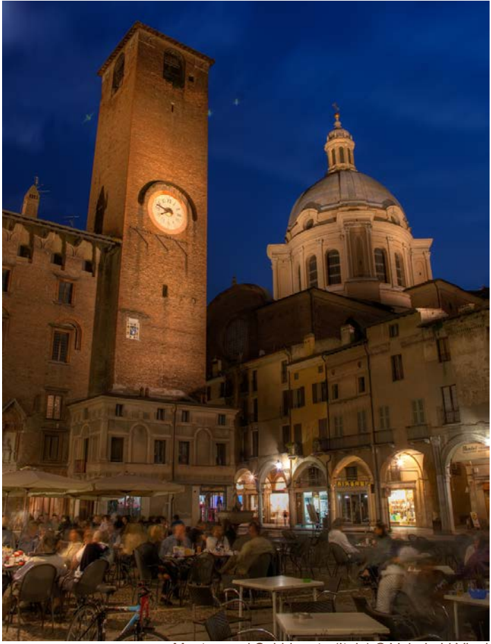
Mantua and Sabbioneta (Italy) © Valerio Li Vigni