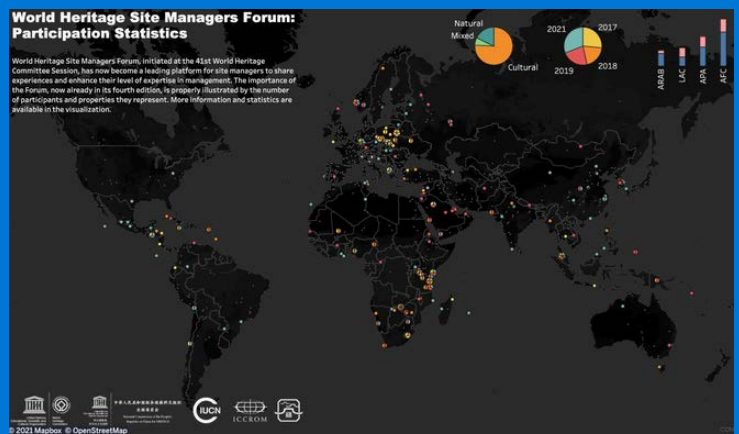
Screenshot of participation statistics.