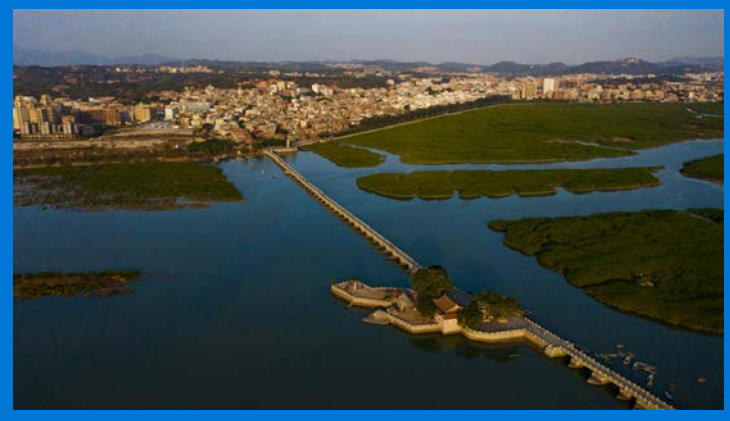
Panorama of Luoyang Bridge.

The Committee examined 45 new proposals, including nominations submitted in 2020 and 2021, before ultimately inscribing a total of 34 properties on UNESCO's World Heritage List.