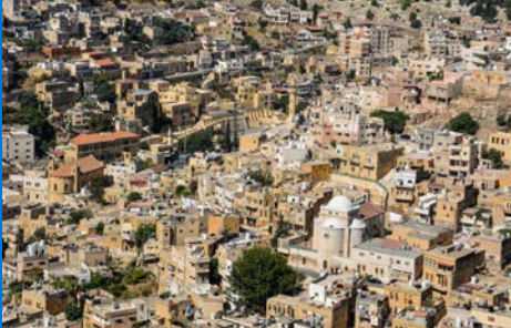
"As-Salt - The Place of Tolerance and Urban Hospitality" As-Salt (Jordan). © TURATH: Architecture and Urban Design Consultants