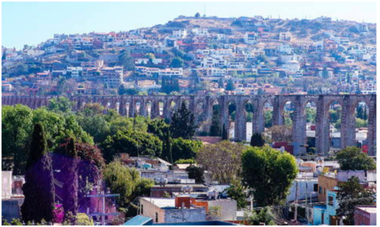
Historic Monuments Zone of Querétaro

Additional case studies will be released on World Heritage Canopy over the coming months in order to promote the experiences of World Heritage cities that have successfully implemented principles from the Historic Urban Landscape Recommendation. These and the many other case studies on heritage conservation are meant to serve as a platform for sharing experiences.