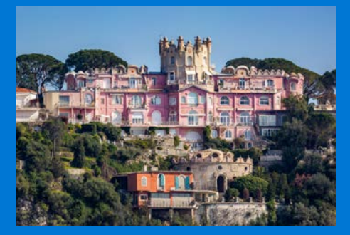
Nice, a Winter Resort Town of the Riviera (France)