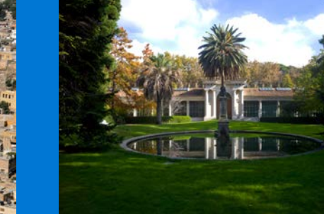
Royal Botanical Gardens, part of the "Paseo del Prado and Buen Retiro, a landscape of Arts and Sciences", Madrid (Spain) © MonumentaMadrid.