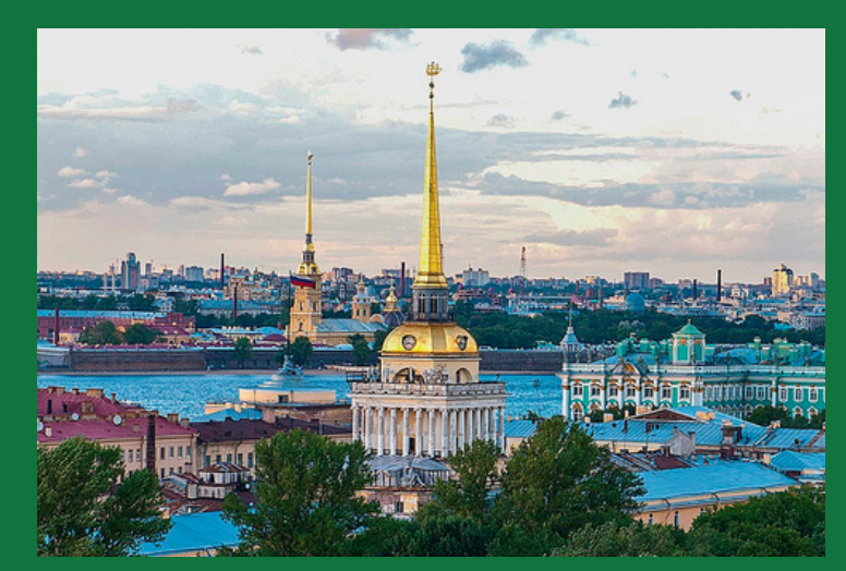
Historic Centre of Saint Petersburg and Related Groups of Monuments (Russian Federation)

Learn more about ongoing celebrations of the 10th Anniversary of the 2011 UNESCO Recommendation on the Historic Urban Landscape.