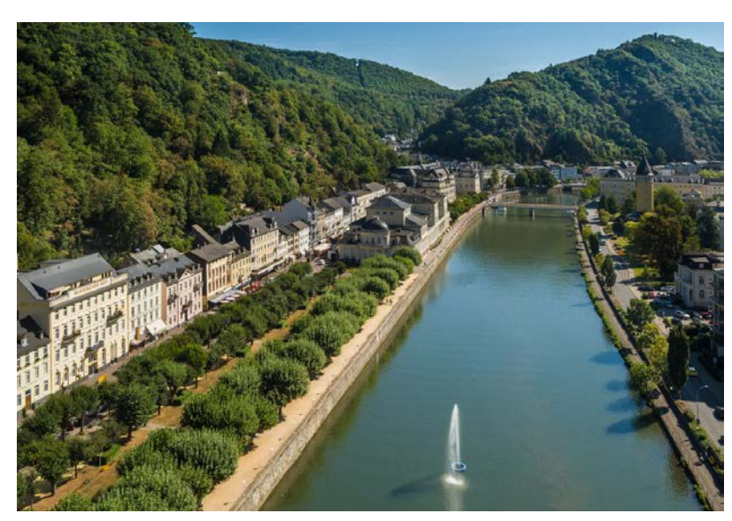
Kurpark, Römerstraße, Spa quarter and Bäderlei - Bad Ems, in the newly inscribed World Heritage site The Great Spa Towns of Europe