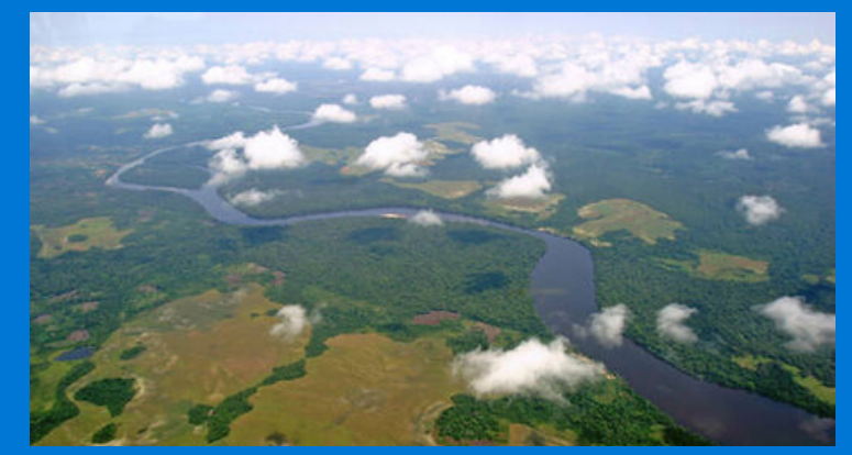
Salonga National Park (Democratic Republic of the Congo)

The Secretariat also fully recognized the achievements and progress made by "Salonga National Park" in the Democratic Republic of the Congo in eliminating threats of war and illegal poaching, and unanimously agreed to remove it from the List of World Heritage in Danger. <u>Read more</u>