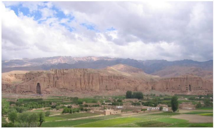
Bamiyan Valley, Afghanistan