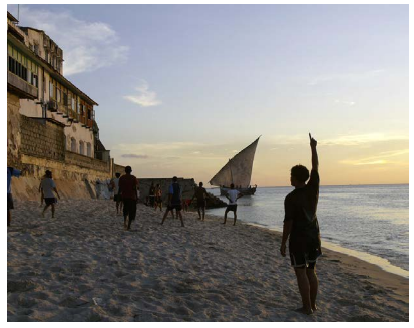
Stone Town of Zanzibar (United Republic of Tanzania). Author: Geoff Mason © OUR PLACE The World Heritage