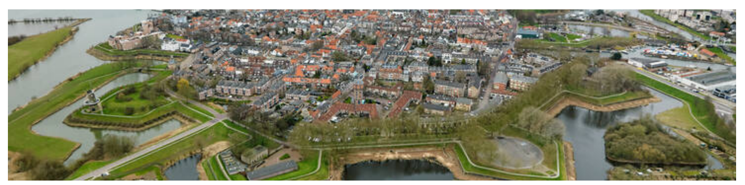
Dutch Water Defence Lines (extension of the Defence Line of Amsterdam). Fortified town of Gorinchem

For this set of dialogues, a special focus will be put on "Adapting Cities for Climate Resilience", the theme of the World Cities Day for 2021 (31 October), aiming to provide a space for site managers and focal points to present and elaborate ideas and strategies for Climate Action and implementing the HUL approach when facing these issues. We also want to hear about the impacts of climate change and extreme-weather events on World Heritage cities and discuss the challenges and possibilities of using the HUL Approach as a tool for sustainable development. Discussions will put a specific focus on urban processes and tools, and how the HUL Recommendation can be used in each region.