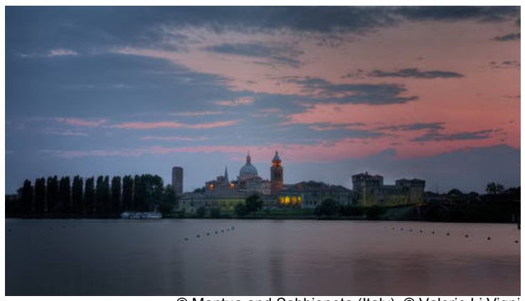
© Mantua and Sabbioneta (Italy). © Valerio Li Vigni