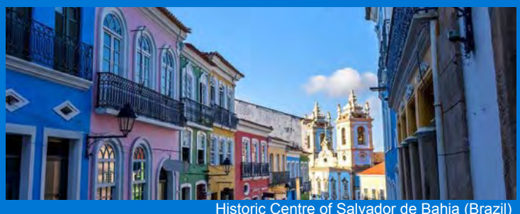
toric Centre of Salvador de Bahia (Brazil)