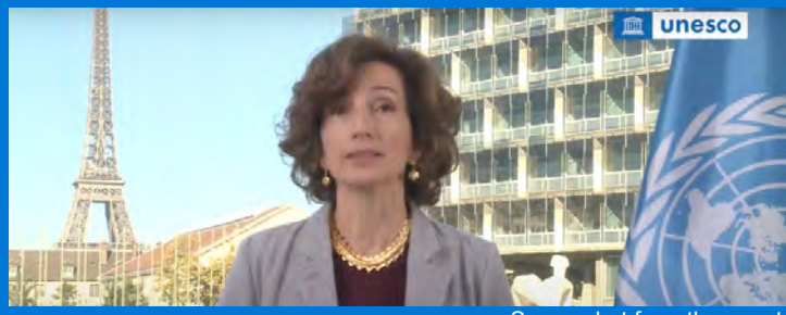
creenshot from the event