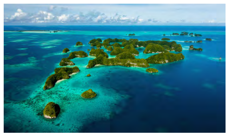
Rock Islands Southern Lagoon, Palau