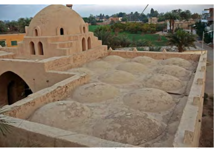
New Gourna, designed by Hassan Fathy

Through the Urban Transitions Alliance, industrial legacy cities across the globe have been collaborating to address their transition challenges and find new solutions. Cities in the Alliance are striving to mainstream equity-based approaches in their transition projects. Developed from the forward-looking efforts of member cities to address local inequalities, the Urban Transitions Alliance equity framework aims at enabling cities to prioritise opportunities for local residents when designing their climate and environmental interventions, with special consideration of vulnerable and disadvantaged groups. Re-watch the sessions and learn more.