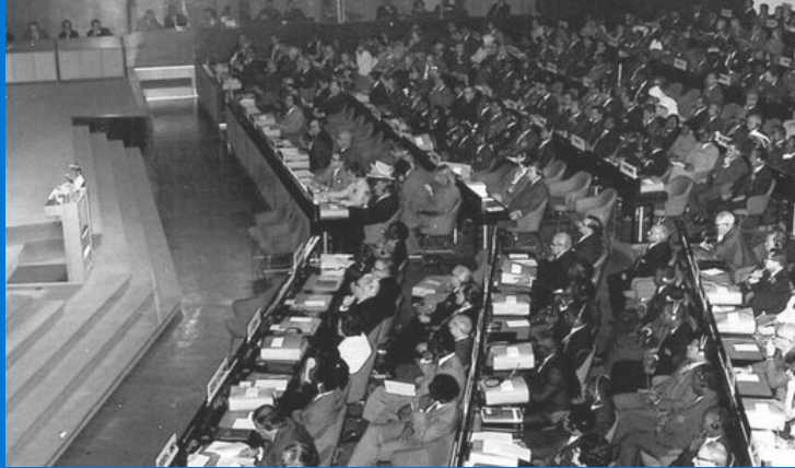
Adoption of the 1972 World Heritage Convention in Room 1, UNESCO, Paris France