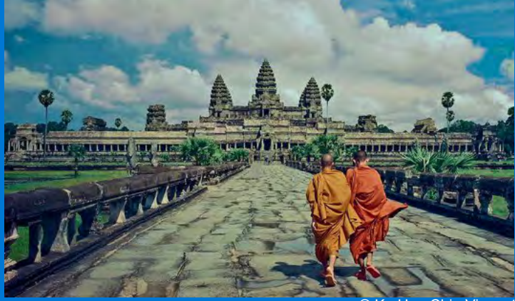
Ko Hon Chiu Vincent

In the wake of the COVID-19 pandemic, many governments have taken measures to restrict movements of people and access to certain areas. This includes the closure of natural and cultural World Heritage sites in some of the 167 countries they are located in.