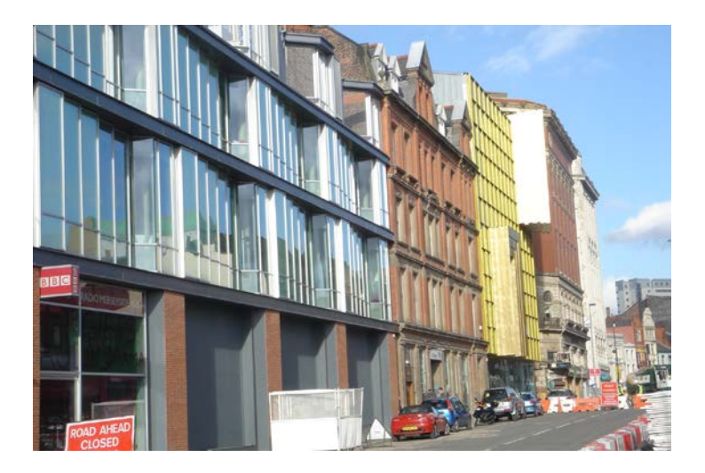
Illustration 4: Contemporary architectural interventions, as part of the Paradise Project in Liverpool's centre, that follow the traditional urban pattern, building height and, to a lesser extent, rhythm of the historic facades.