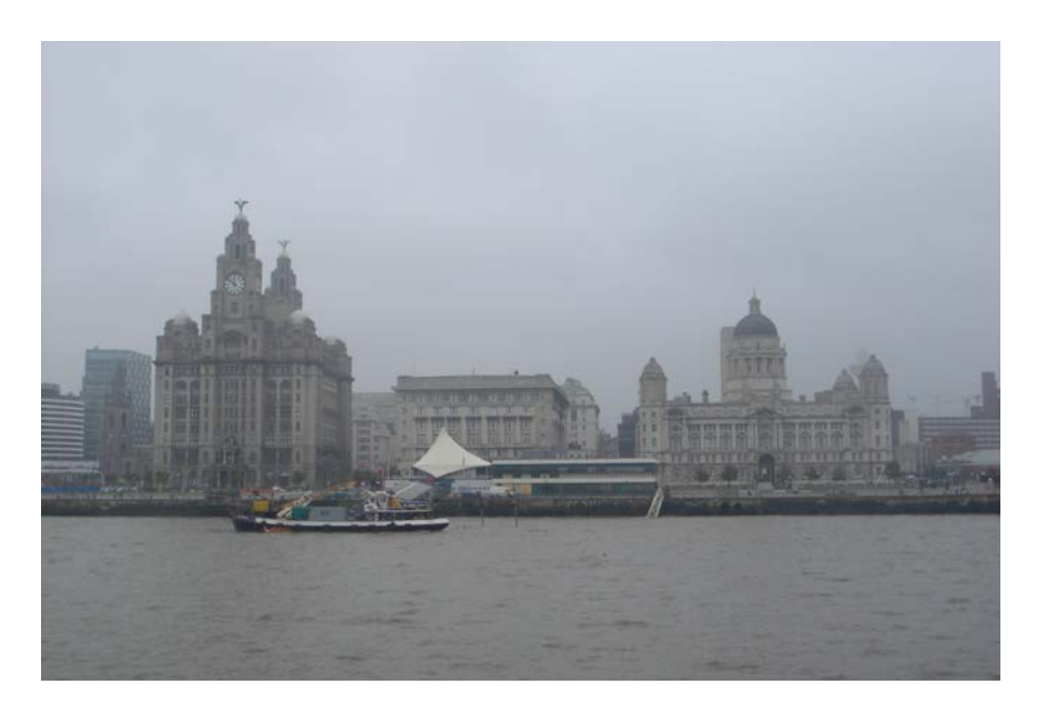
Illustration 3: The urban landscape of the Pier Head, still free of high-rise constructions in its direct backdrop, could benefit from an introduction of a stricter regime of planning control. In the foreground the white 'tent' construction, which is the present inadequate ferry terminal that will soon be replaced by a contemporary 3-story building of modest architectural appearance.