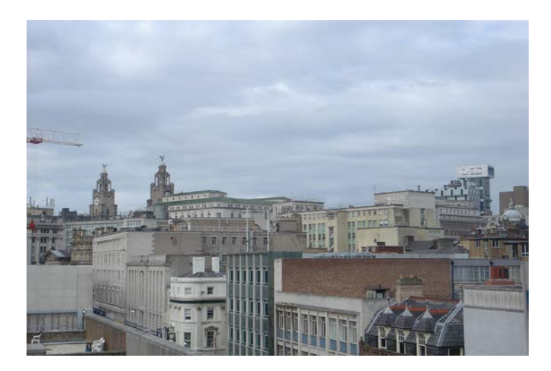
Illustration 5: View of the townscape of the historic centre of Liverpool, with the towers of the Royal Liver Building (one of the Three Graces) in the back, which is not a homogeneous urban ensemble containing a high degree of architectural coherence – quite the contrary.

Illustration 4: Contemporary architectural interventions, as part of the Paradise Project in Liverpool's centre, that follow the traditional urban pattern, building height and, to a lesser extent, rhythm of the historic facades.