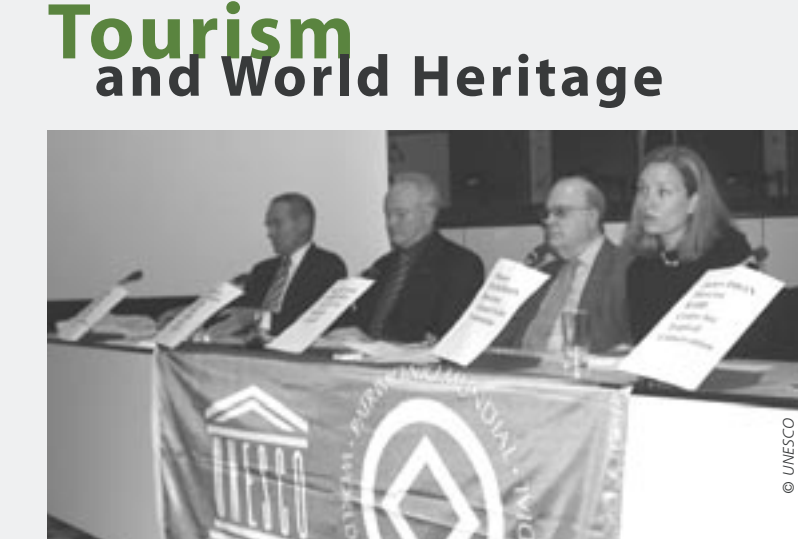
Participants in the special session on World Heritage at the ITB in Berlin

The Decisions adopted by the World Heritage Committee