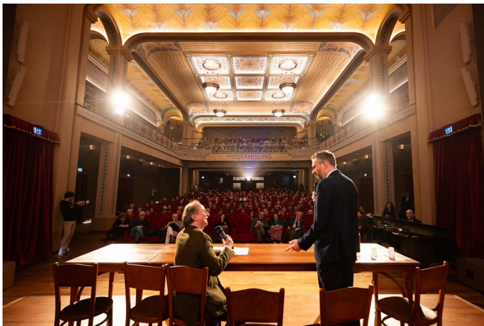
Cinema Modernissimo, opening night

• Teatro Comunale: As envisaged by the overall project already illustrated in the previous SOC report, the project for the renewal of Teatro Comunale, owned by the Municipality of Bologna, is the result of an international competition of ideas launched by the Municipality itself, which is also the implementing authority. Therefore the preparation of the HIA is the responsibility of the Municipality itself.