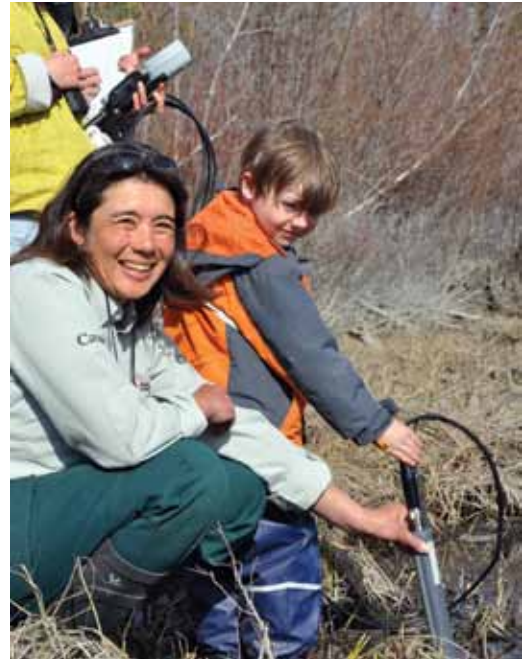
Measuring the water temperature during frog surveys of the Dezadeash wetlands. C. Cowie

The wilderness character of KNP&R remains an integral part of the full range of visitor experiences in the park. From the visitor's perspective, wilderness character is the sense of being immersed in the natural environment in a way that allows for an authentic personal experience. It includes the opportunity to enjoy peaceful campsites with little sign of other recreational use, opportunities for solitude and natural quiet, and quality experiences on the land. As visitors explore new opportunities and activities in the park, impacts of increasing use will be monitored through recreational