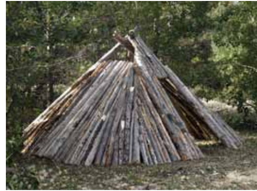
Njal. D. van Lieshout

important progress in this area, but there is still work to be done to advance cultural reintegration in the park.