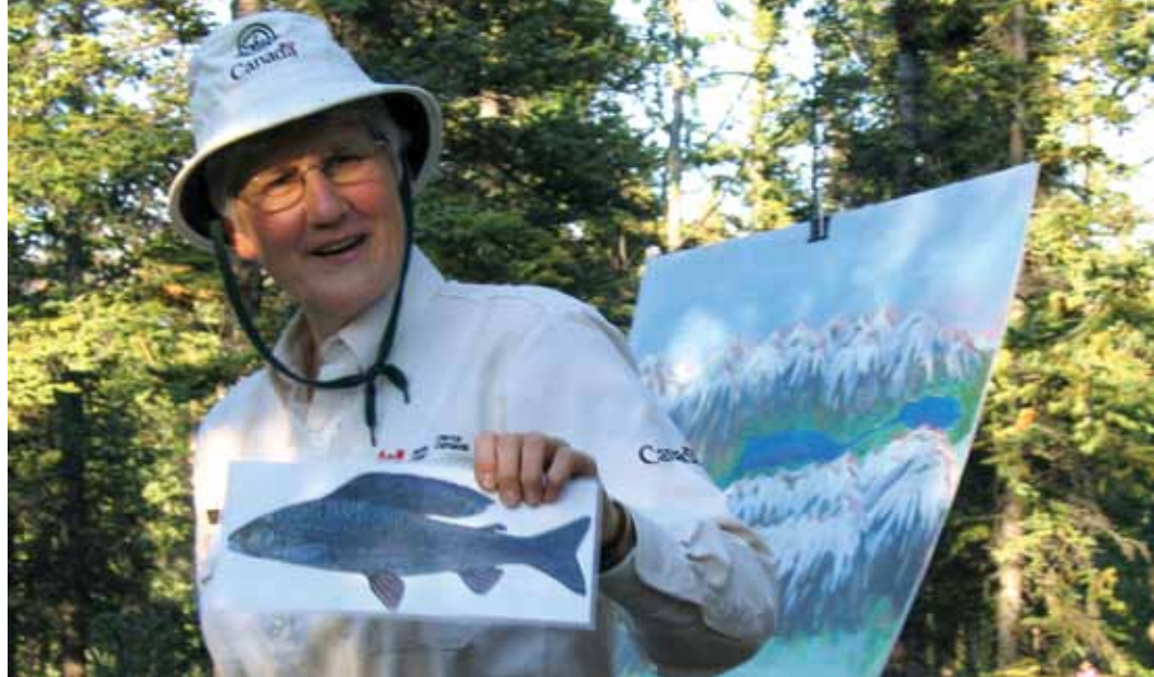
Campfire talk.