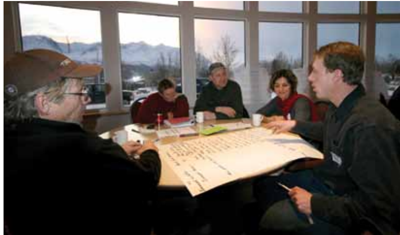
Visitor experience opportunities workshop.

The KFN, CAFN, and Kluane National Park Management Board are partners in the cooperative management of KNP&R. The central importance of Parks Canada's relationships with these partners is described in key strategy four, Building and Walking the Trail Together. Work will also continue to engage the White River First Nation.