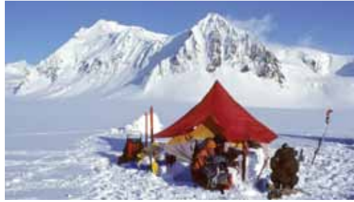
Mountaineering in the Icefields.

2002 Kluane Wilderness Study found that almost 30% of the mountaineering respondents had considered climbing Denali in Alaska but had ultimately chosen KNP&R because Denali was too crowded.