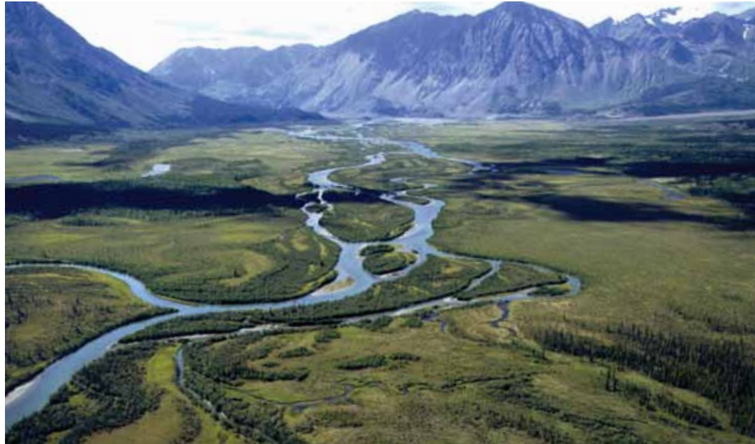
Dezadeash River and Alsek Pass. Parks Canada