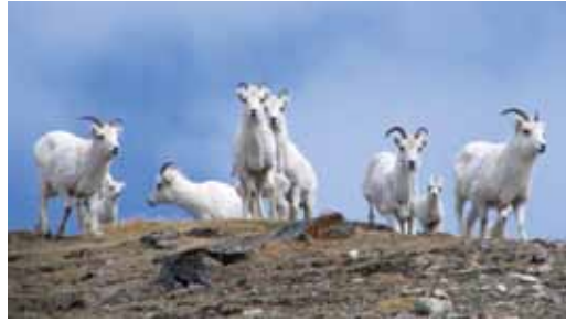
Dall's sheep.