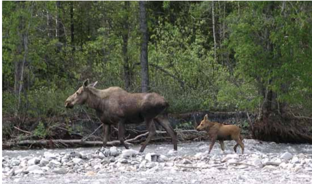
Moose and calf.

While key strategies focus on management approaches that affect the park as a whole, area management approaches focus on approaches for specific geographic areas of the park (Map 3). The seven geographic areas described in the 1990 and 2004 park management plans will continue to be used to define the recreational experiences provided in each area of the park and provide visitor experience and ecological objectives for each area. Some areas are managed for higher levels of multiple-use activities e.g., Kathleen Lake, while others are managed for high-end wilderness experiences e.g., the Alsêxh/Alsek River corridor, and others offer something in-between, e.g., the front country highway corridor and the Ä'äy Chû Valley.