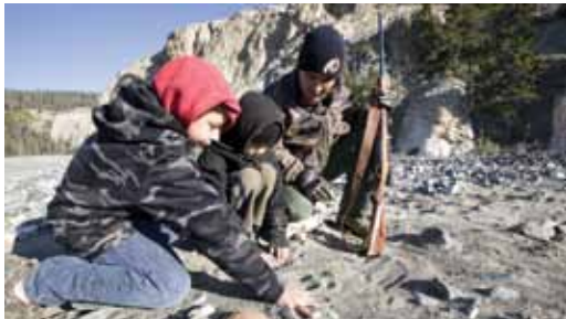
Kluane First Nation member showing youth how to identify animal tracks.

Major transportation, resource extraction and energy corridor developments in the Shakwak Valley and the subsequent implications for the ecological integrity of KNP&R highlight the need to consider the impacts of regional land use decisions on park values.