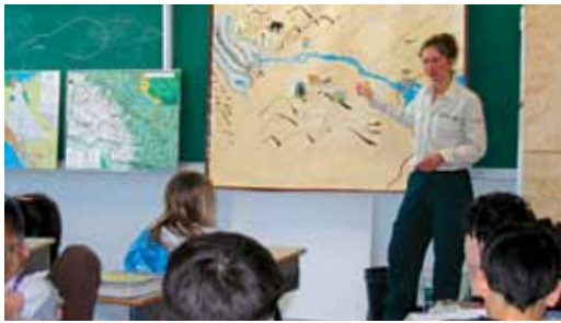
Outreach school program.

in order to build a sense of personal connection to KNP&R and for Parks Canada to reach and be relevant to Canadians whether or not they have an opportunity to visit the park. Through public outreach education, Parks Canada can build a greater understanding and appreciation of KNP&R and also encourage individuals and communities to support and become engaged in its protection and presentation.