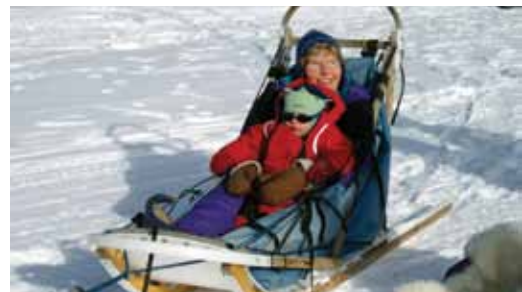
Kathleen Lake Family Fest Day.

remaining underground petroleum tank will be dealt with during the life of this plan.