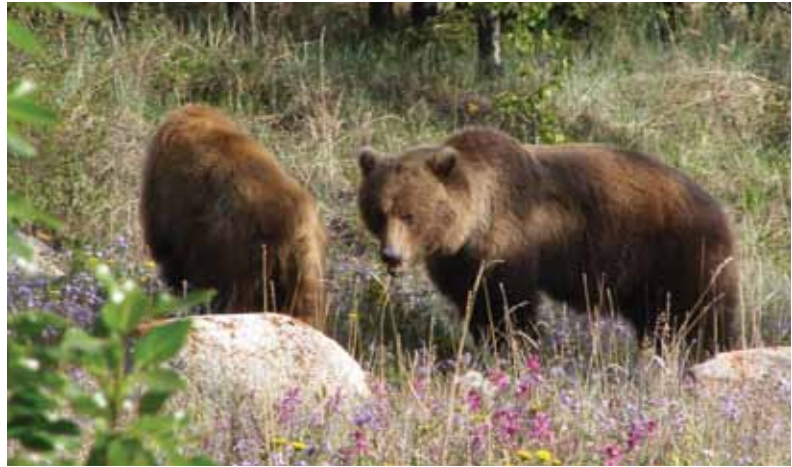
Grizzly bears. H. Fitzgerald

A park vision is meant to convey the special character of KNP&R and paint an inspiring picture of the future desired state of the park over the next 15 to 20 years.