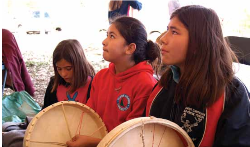
Southern Tutchone youth drumming as part of Hand Games at Healing Broken Connections Ka'Kon Camp, August 2007. D. van Lieshout

Key strategies describe an integrated, focused approach of how the park will be managed in the mid- to long-term. The strategies set the path to achieve the park vision in an integrated fashion, while addressing park challenges. Within a key strategy, objectives are a more specific description of outcomes (short- to long-term). Key actions state what will be done within the five year term of the management plan's implementation.