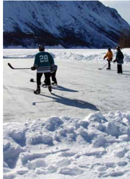
Pond Hockey on Kathleen Lake.

A right-of-way for a natural gas pipeline runs parallel to the Alaska Highway adjacent to KNP&R and crosses park lands for approximately three kilometres in the Congdon Creek area. In anticipation of development