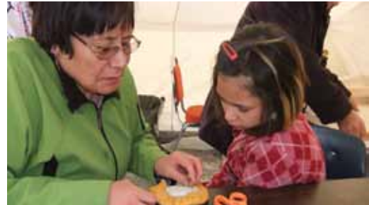
Sewing canvas and hide moccasins at the Healing Broken Connections Winter Camp 2010 at Tach̓àl Dh̓àl.

Since the last management plan, three underground petroleum tanks at the Farm have been removed and replaced by above-ground double-walled storage tanks in 2006. The one