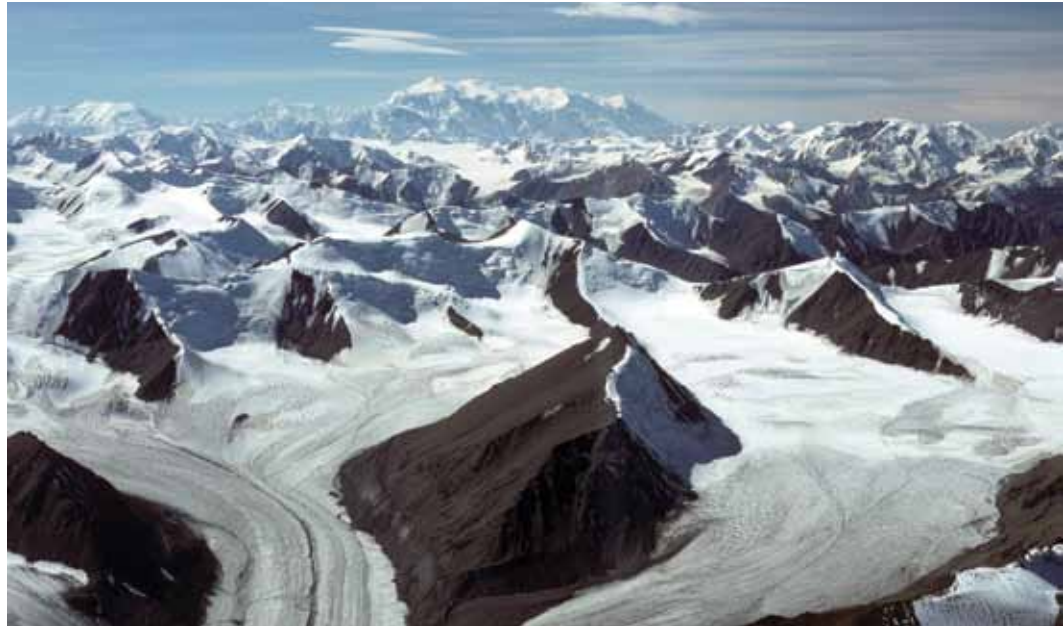
Mount Logan.

Kluane National Park & Reserve lies in the southwest corner of Yukon Territory, a vast mountain area (21,980 km 2 ) within the traditional territory of the Champagne and Aishihik First Nations, the Kluane First Nation and the White River First Nation. First set aside as the Kluane Game Sanctuary in the early 1940s, it was declared a national park reserve in 1976. The 1993 Champagne and Aishihik First Nations Final Agreement established the southeastern portion of the park reserve as Kluane National Park. The Kluane First Nation Final Agreement was signed in 2003; the Tachãl Region (northern portion of the park reserve) will retain park reserve status until the White River First Nation concludes a final agreement.