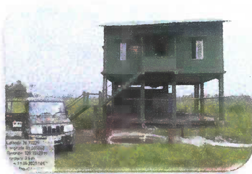
Maguribeel APC, Bhuyanpara Range

Anti-Poaching Camps: Towards efforts to strengthen protection, several new anti-poaching camps have been constructed in Manas National Park.