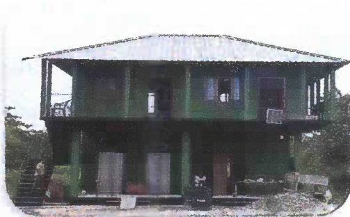
Mwisopathar APC, Panbari Range