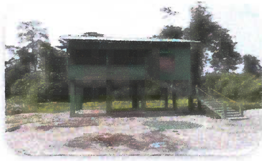
SriLanka APC, 1 st Addition to Manas NP

PARA-4: Commends the ongoing efforts to mobilize additional funding for the conservation of the property, including through REDD+ carbon financing, and encourages the State Party to report on how the carbon finance initiative benefits the property, so that lessons learnt could be shared widely, and also welcomes activities undertaken by the State Party aiming to benefit local communities, notably through the revitalization of Eco-Development Committees and eco-tourism initiatives;