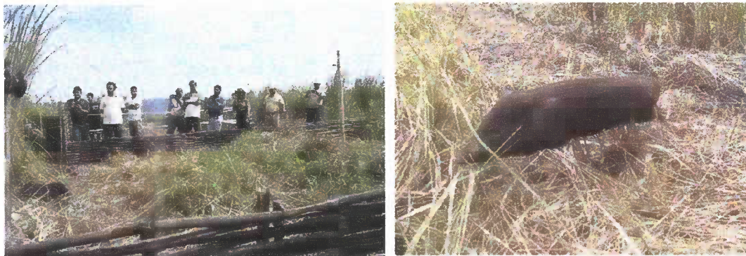
Pygmy Hog reintroduction site in Manas National Park

Pygmy Hog Reintroduction: 18 captive-bred pygmy hogs have been released in the sprawling Manas National Park of Assam, India, by the Pygmy Hog Conservation Programme (PHCP) in September 2023. This is for the fourth time pygmy hogs have been reintroduced to Manas Park by the PHCP after successful releases in 2022, 2021 and 2020. This has now taken the total number of this Critically Endangered species released at this site up to 54, meaning the PHCP is well on its way to meet its target of 60 hogs released in Manas Park by 2025. The programme, which is made up of founding partner Durrell Wildlife Conservation Trust, along with the IUCN/SSC Wild Pig Specialist Group, Assam Forest Department, Ministry of Environment and Forests, Government of India, and Ecosystems-India, with Aaranyak as delivery partner, has been working to bring this precious species back from the brink after it was previously thought to be extinct in the 1970s.