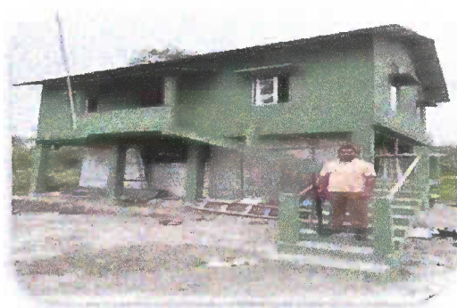
Jangia APC, Kahitema Beat, Panbari Range