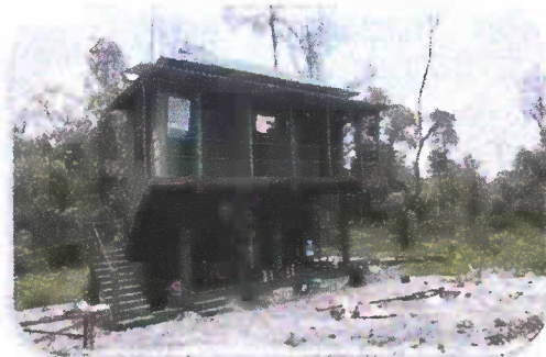
Raigajali APC, 1 st Addition to Manas NP