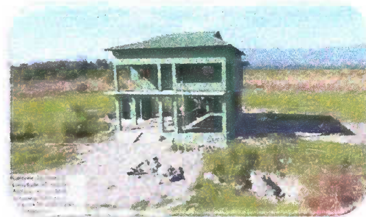
Phalangshi APC, Panbari Range