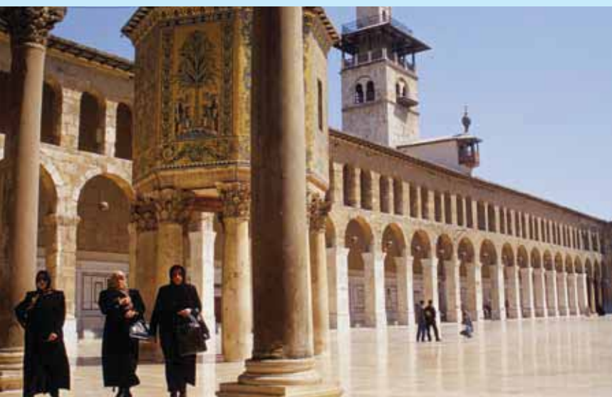
FIG. 10 The great mosque of Damascus (Syria) hosts religious functions and provides a safe place for social interactions ▼

The Jordan Cultural Heritage Tourism and Urban Development Project provides resources for (i) supporting local economic development by preserving cultural heritage; (ii) consolidating the sustainable tourism industry; (iii) rehabilitating the housing stock in medinas and improving urban infrastructure; (iv) ensuring financial and technical supports to the local entrepreneurs and community groups; (v) encouraging small and medium enterprises in the medinas; and (vi) providing assistance for capacity building of local institutions. The project focuses on Jerash, Karak, Madaba, Salt, Ajloun, and Petra, where the construction of a new visitor center is being financed.