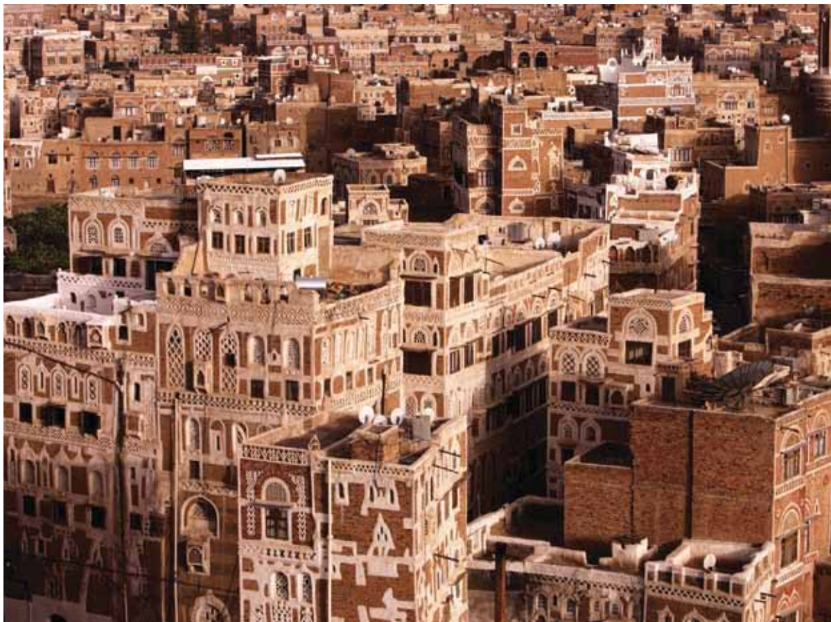
FIG. 9 Traditional multi-story earthen buildings create the unique architecture of Sana'a (Yemen)

In the experience of the World Bank, such objectives should be pursued in parallel, and the policies and approaches applied to medina rehabilitation should be equally sensitive to each one of them. Failure in the achievement any of these three objectives can result in an unsustainable process of urban transformation and will ultimately undermine the process of medina rehabilitation as a whole.