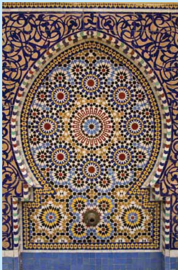
< FIG. 21 Fountain in the medina of Rabat (Morocco), displaying the intricate technique of zellij, or cut-out ceramic tiles

In addition, renovation of the facades of buildings and of the store fronts are carried out in the main commercial areas, and public squares are redesigned and provided with paving, lighting, urban furniture, and landscaping. Electric and telephone lines are reorganized to minimize their physical and visual impact in the streets and squares of the city centers. Semi-public spaces are upgraded with necessary basic repairs as a first step towards the rehabilitation of the housing clusters. Many of these activities are carried out after the improvements to the storm drainage, wa-