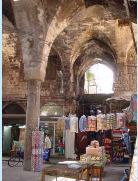
▲ FIG. 26 A covered souk, or traditional commercial district, occupies ancient buildings in Tripoli (Lebanon)

The private sector also boosted its involvement beyond the project completion and undertook the construction of eight hotels and major historic building (US$29.7 million). National foundations and international donors engaged themselves in further rehabilitation of historic buildings and sites (US$3.3 million). During the years of project implementation, parallel investments in the rehabilitation of the medina