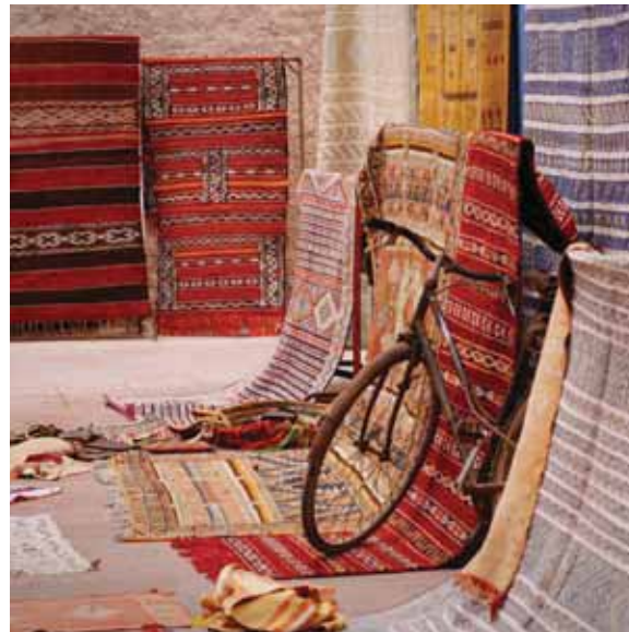
FIG. 6 Heritage-related products displayed in the medina of Essaouira (Morocco)

population, although sought after by the younger generation. At the other extreme, international tourists seek different services and goods. Their interests include museums, art galleries, and cultural centers, especially at the time of cultural events or festivals. They seek the opportunity to stay overnight in the medinas, if boutique hotels are available, to lunch and dine at local upscale cafés and restaurants, and shop for local handicrafts, souvenirs, local fashion items, and specialized products that can only be found locally, produced in traditional workshops.