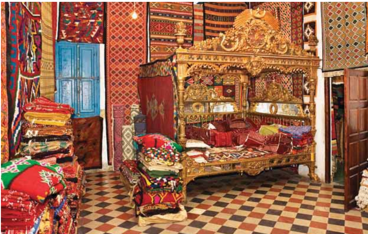
FIG. 13 Income-generating activities associated with heritage: a rug store in the medina of Tunis (Tunisia)

The private sector's role is to respond to the opportunities and to the incentives created by supportive public policies by investing again in the medina's real estate market and economic activities. Private actors will include the residents themselves and local firms, as well as external economic actors that will seek gains from opening businesses, investing in the hospitality business, handicrafts, and commerce. Often forgotten, but equally important, is the role of the non-profit sector in contributing to medina rehabilitation. Community associations, created around cultural or social interests, often provide the social capital and the political pressure leading to public initiatives in favor of medina rehabilitation and of its residents. They are also at the origin of festivals, cultural events, and public entertainment opportunities which increase the attractiveness of medinas to residents and visitors alike.