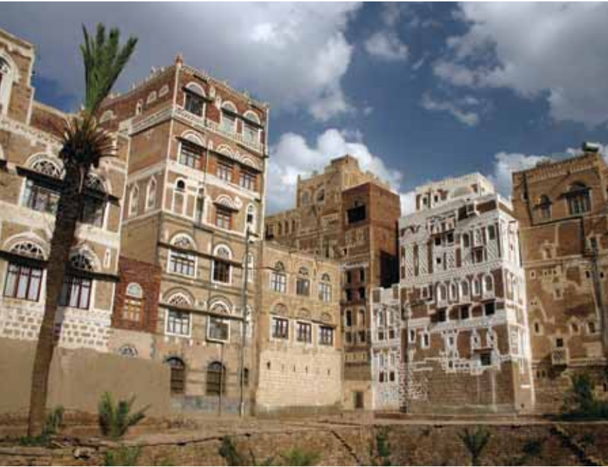
▲ FIG. 4 Medinas are endowed with a rich and diverse cultural heritage; however, in the last fifty years they have suffered a steady decay across the Middle East and North Africa. Traditional neighborhoods in Sana'a (Yemen), showing very compact and ornate residential buildings

Many cities in North Africa and the Middle East feature historic cores that are at the heart of Arab civilization and generally date their origin back to medieval times. These historic settlements are the repository of formidable cultural assets, remarkable religious and secular buildings, harmonious urban patterns, attractive streets and public spaces, traditional productive and commercial activities, and social interactions that characterize them as unique urban locations. Yet, for the past fifty years, they have been experiencing rapid physical and social decay due to a combination of abandonment by part of their original population and rapid urban growth of modern neighborhoods. Contemporary economic, cultural, and social activities have found their urban location elsewhere, turning their back on the medinas.