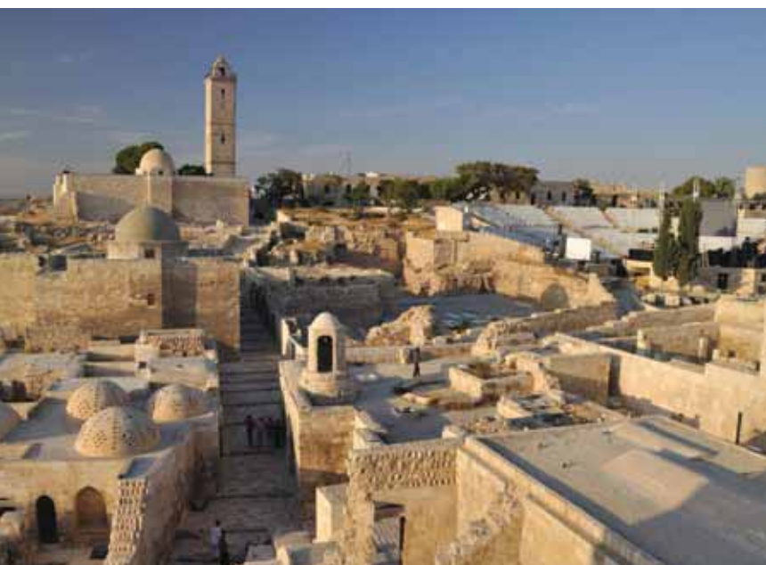
▲ FIG. 8 The citadel is one of Aleppo's (Syria) most ancient monumental areas

The World Bank has given active support to governments in medina rehabilitation, as part of its world-wide support to cultural heritage and sustainable tourism development.