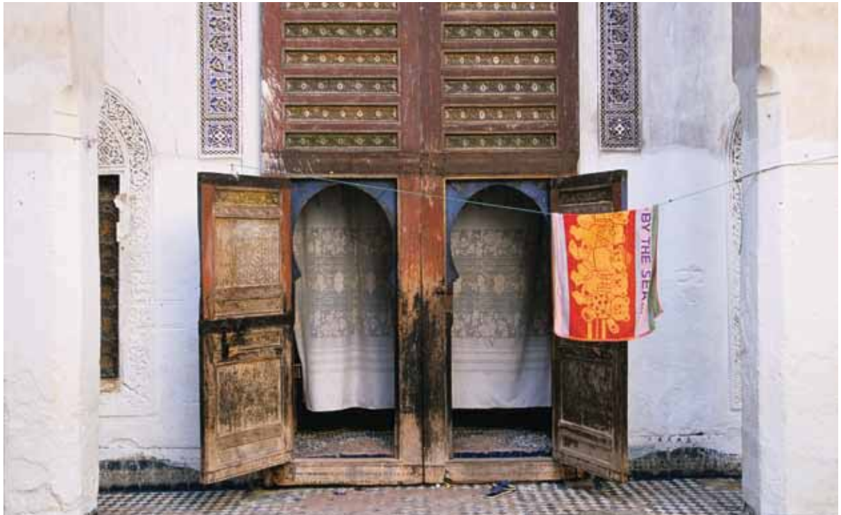
FIG. 22 > Bedroom access from the domestic patio is typical in the medina of Fez (Morocco)

Another possible approach consists in implementing programs for the rehabilitation of the common parts of the buildings (e.g., roof, stairs, lobbies, water piping, drainage, and sewerage) which are occupied by tenants and squatters. To facilitate the rehabilitation, technical specifications can be developed, and