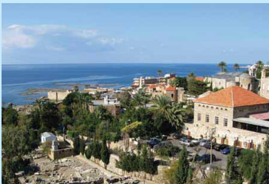
FIG. 25 Vibrant urban landscape of the historic city of Byblos (Lebanon), seen from the Crusader's Castle ▼