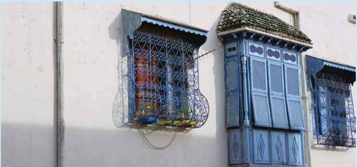
FIG. 20 > Mushrabiyyas, or traditional wooden screens, protecting the privacy of homes in the medina of Tunis (Tunisia)

The Tunisia Cultural Heritage Project aims at preserving key sites and buildings, rehabilitating the housing stock, improving access, enhancing tourist facilities, and increasing security in six selected heritage sites.