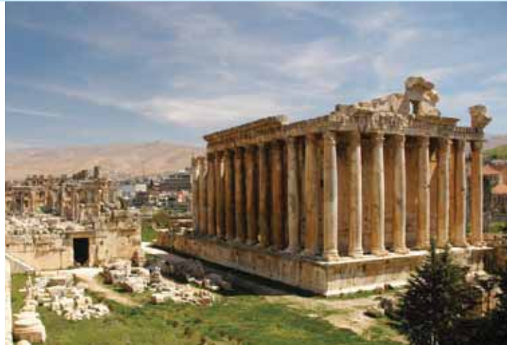
▲ FIG. 28 The temple of Jupiter is one of the main cultural heritage attractions present in Baalbeck (Lebanon)

The MTPI might be of primary use to governments not only in reviewing the individual medinas on the