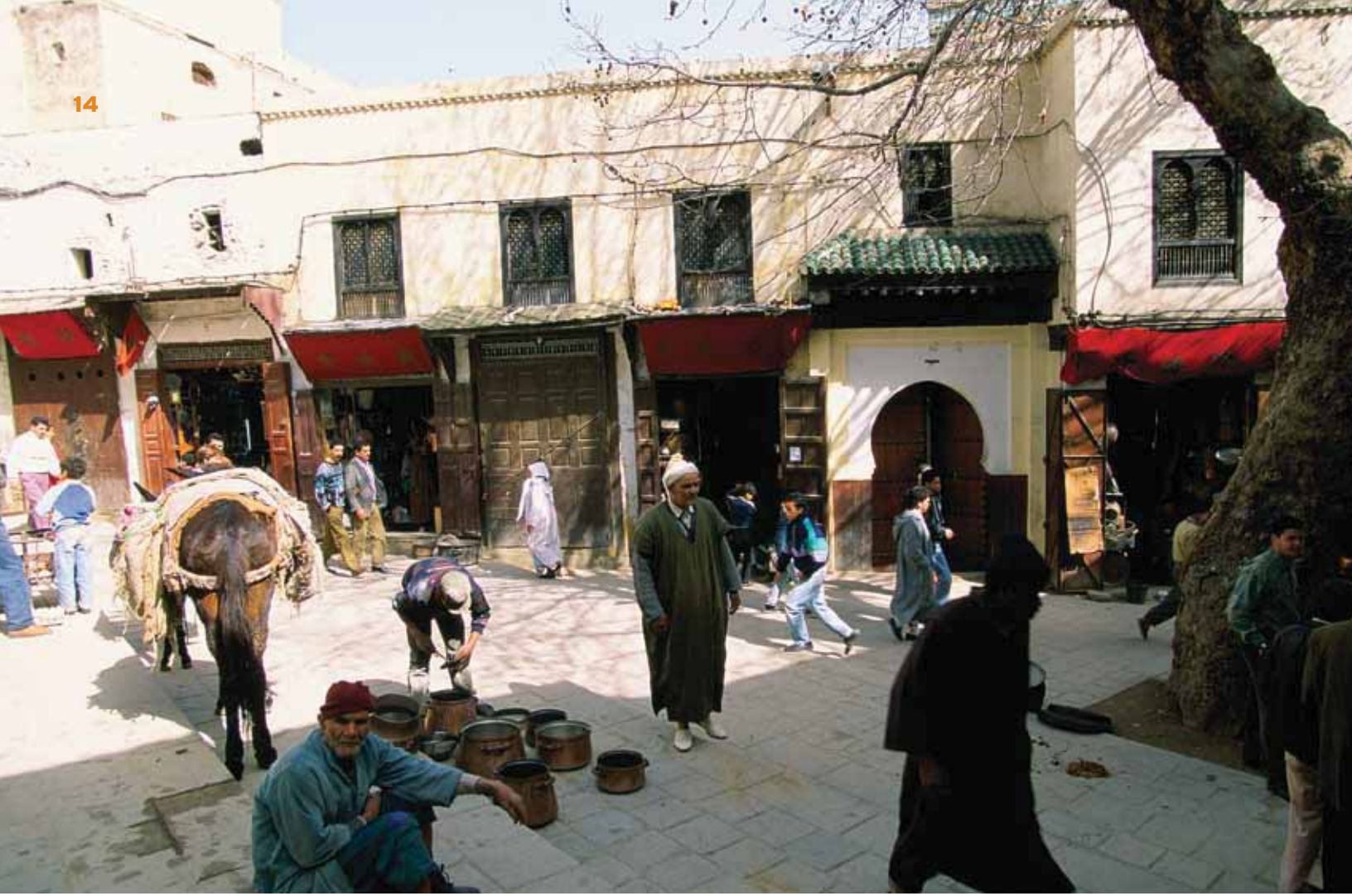
▲ FIG. 16 The coppersmiths' square in the central part of the medina of Fez (Morocco)

Another important task of the public sector is the involvement of local communities in the rehabilitation process, which should be accompanied by building up the capacity to maintain key buildings, housing, public space, and infrastructure. Regular maintenance was a traditional practice in the medinas, but it ended when social changes disrupted the long-standing links between families and dwellings. The governments and the local authorities should therefore promote educational programs to build up a culture of permanent maintenance of buildings and infrastructure among the residents of the medinas, and involve proactively the local communities in the rehabilitation process, including inhabitants, entrepreneurs, and any other stakeholders living or doing business in the medinas.