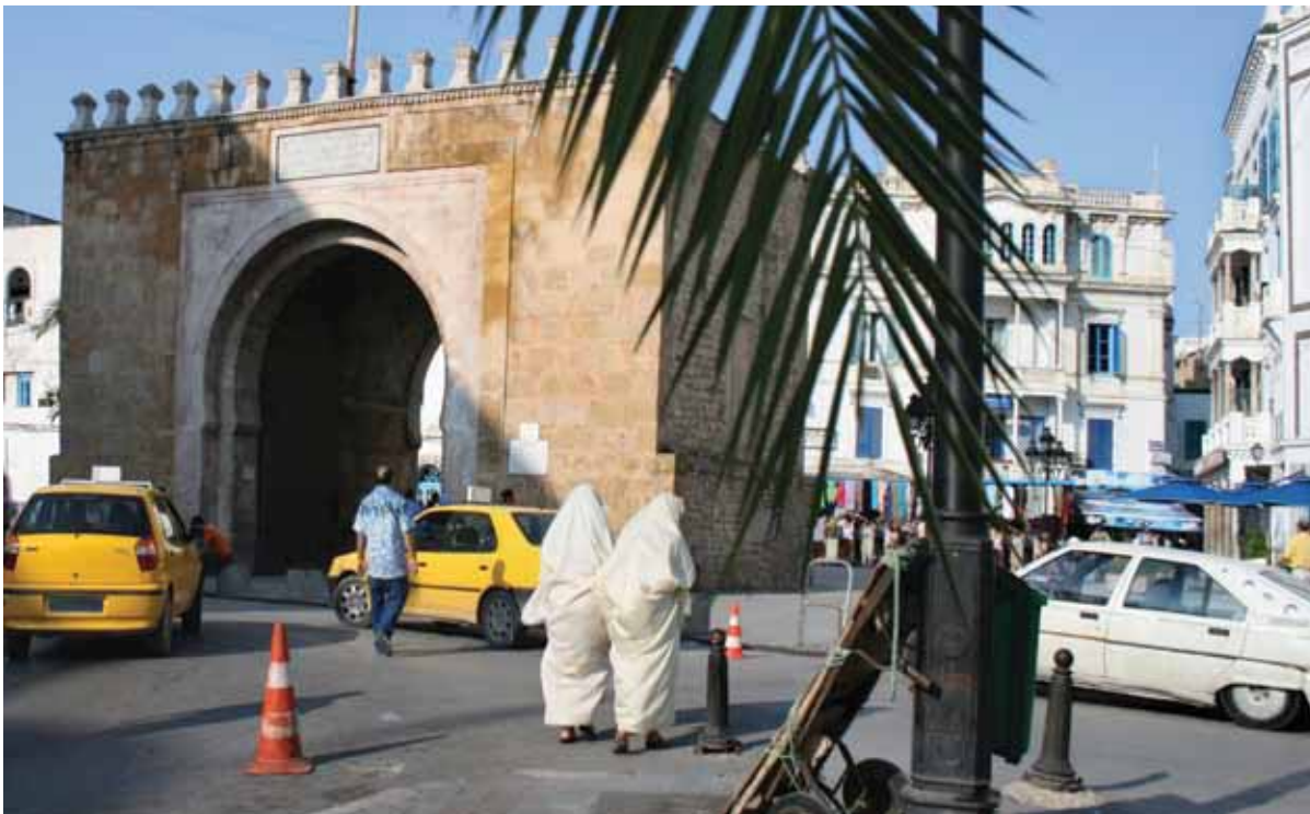
< FIG. 19 The old city gate, part of the medina's walls, is a key urban landmark in Tunis (Tunisia)

Public spaces are the key locations for social interaction and for cultural and entertainment activities that medinas can offer to residents and visitors alike. Across the region a flourishing of cultural events and festivals is making the most of rehabilitated public spaces, some resulting from the adaptive reuse of ancient archaeological sites. Such events in turn increase the attractiveness of medinas and the opportunities for local economic development.