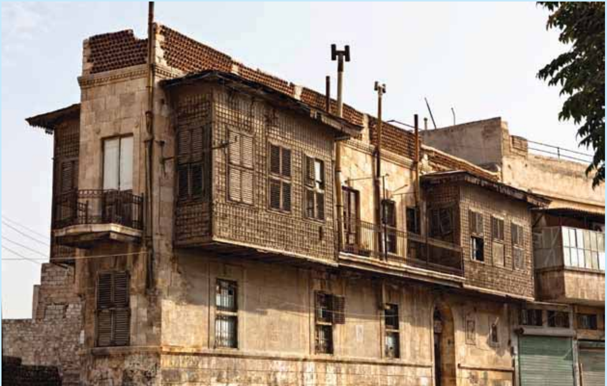
FIG. 23 > Traditional heritage house in the medina of Aleppo (Syria)

56 housing units threatening collapse have been consolidated, and two important historic public spaces were rehabilitated. These works resulted in generating 1,000 person-years of employment of low-skilled local laborers. A number of local NGOs and foundations took part in the development of the project, which led to a direct contribution in the project design and highlighted the expectations of the resident popula-