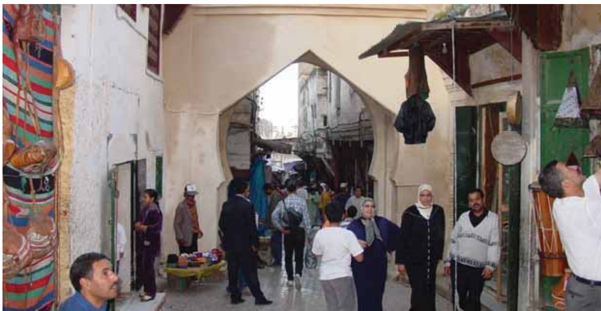
FIG. 27 One of the main pedestrian and commercial arteries of the medina of Fez (Morocco)

While all medinas, by definition, deserve rehabilitation, not all of them can claim a trajectory of sustainable local development via cultural tourism. For the purpose of identifying the required characteristics, the World Bank proposes the Medina Tourism Potential Index, as a useful operational check-list.