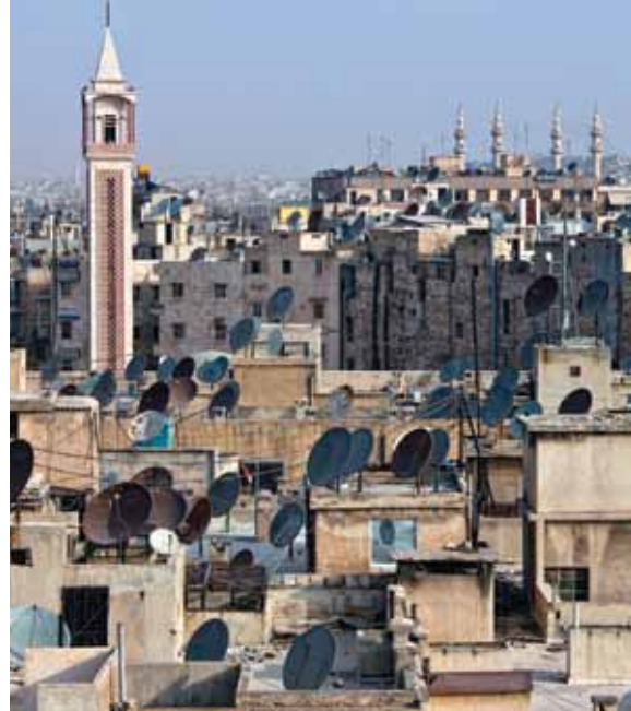
< FIG. 17 The Aleppo (Syria) medina skyline combines traditional and modern features, with a show of contrasts

Overall, the medinas suffer from a confused situation of property titles, due to out-of-date property registration systems. Ownership is often not sanctioned by formal titles, but regulated by traditional property titles. This uncertainty complicates property transactions with parties who require formal