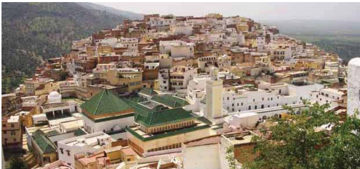
< FIG. 3 The thriving medina of Moulay Driss Zerhoun (Morocco), attracting pilgrims to its sanctuary

Finally, the paper reviews the financial and fiscal instruments that can be used to mobilize the necessary resources, including the roles of scaled up private sector investments and of international development financing in support of national and local governments. As sustainable cultural tourism is put forth as the main economic rationale for investment of financial resources in medina rehabilitation, the paper also presents an innovative multi-criteria index to determine the tourism potential of historic cities in the region, which has been recently used in the case of Morocco for a national strategy for the rehabilitation of its historic cities.