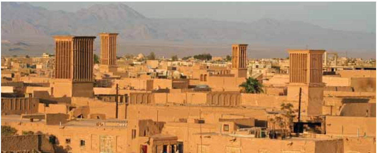
FIG. 14 > Badghirs, or traditional Persian wind-towers, used to cool down buildings in Yazd (Iran)

Depending on the size and complexity of the medinas, the governments should also set up specific dedicated units in urban development agencies and municipalities. These units would be in charge of designing preservation and enhancement plans, producing technical specifications, and monitoring the state of the medinas through appropriate means, notably Geographic Information Systems (GIS).