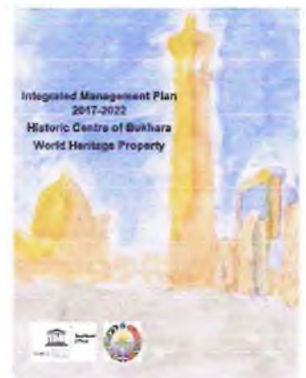
(photos from the presentation of the draft Integrated Management Plan of the Historic Centre of Bukhara to the Reactive Monitoring Group)

In 2022, it is planned to develop a new Integrated Management Plan for the Bukhara Historical Center and its buffer zone.