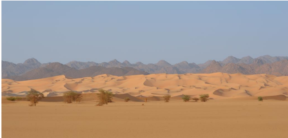
Air and Ténéré Natural Reserves, Niger

The use of influencers in the field of heritage is also to be foreseen for a better impact, especially among youth.