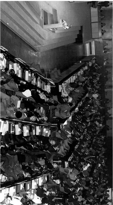
Adoption of the 1972 World Heritage Convention in Room 1, UNESCO, Paris, France