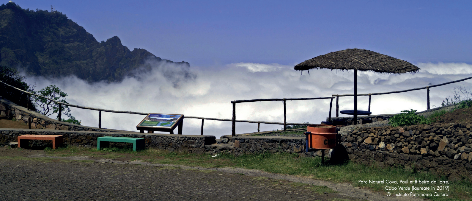
Parc Naturel Cova, Paúl et Ribeira da Torre, Cabo Verde (laureate in 2019)