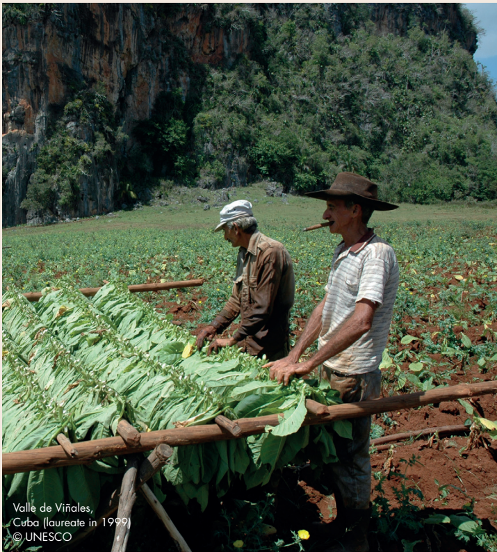
Valle de Viñales, Cuba (laureate in 1999)