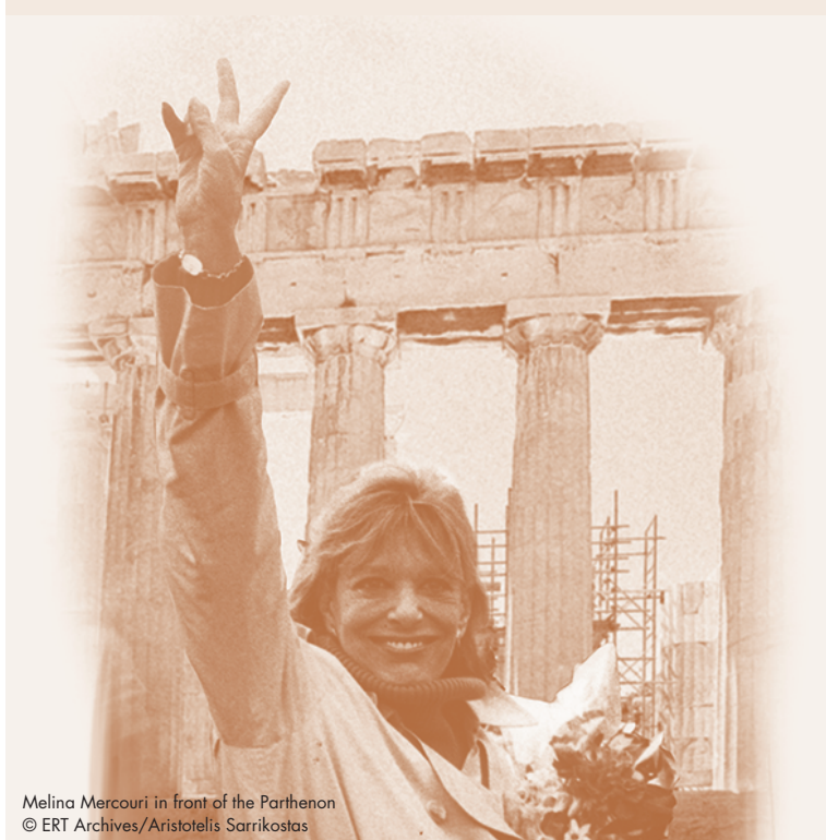
Melina Mercouri in front of the Parthenon