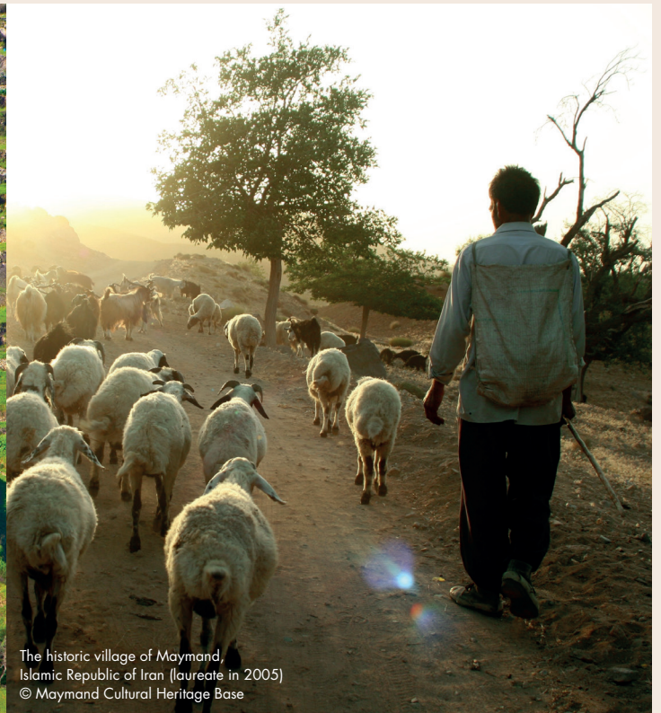
The historic village of Maymand, Islamic Republic of Iran (laureate in 2005)