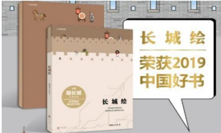
Illustrations of the Great Wall

The visitor management mechanism optimized. Improving capacity for the management of visitors' behaviors in response to the growing interest of Chinese and foreign visitors in the Great Wall and the pressure of growing visitations on its conservation and management is critical to securing the security of heritage properties of the Great Wall, its surrounding natural and cultural environments and its staff members and to improving service capacity and effects. In order to tackle such problems as crowded visitors, imbalanced distribution of visitors and unpleasant visiting experiences, the Badaling Section of the Great Wall announced the daily optimum carrying capacity of 65,000 visitors from 1 June 2019 and officially introduced the real-name online ticket booking system and the early warning response system to enable real-time response to management, service and traffic guarantee, which have effectively improved visiting experiences. The Badaling Section is the first scenic area of the Great Wall that adopts visit restrictions through online ticketing, providing valuable experience for improving management capacity of other scenic areas of the Great Wall across China.