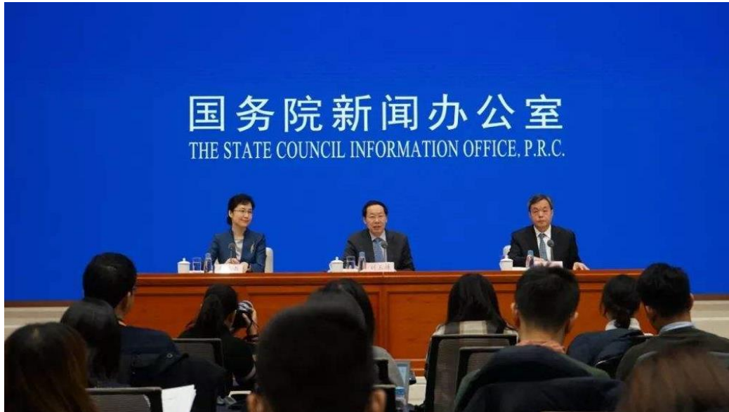
The press conference on the announcement of the Master Plan for the Conservation of the Great Wall