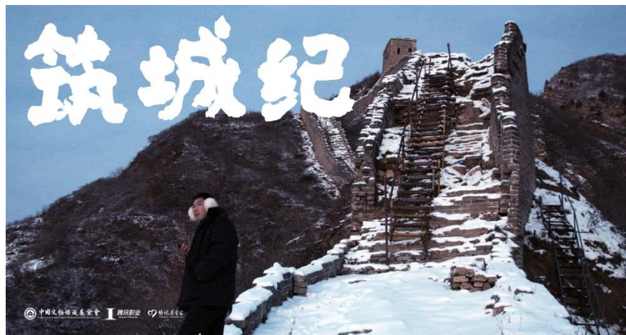
Film and TV productions on the Great Wall

Cultural and creative products provide an effective tool to promote and disseminate the culture of the Great Wall and its conservation ideas. In recent years, the National Cultural Heritage Administration has released a number of policies and measures to encourage the development of cultural and creative products. Among others, “Mutianyu Section Cup: Competition of Design of Cultural Products” has triggered out a wave to develop cultural and creative products on the Great Wall. Social sectors have been mobilized to explore the culture of the Great Wall and develop diverse creative products that highlight customs, traditions, sceneries, history, landscapes, agricultural products and cuisines from the Mutianyu Section of the Great Wall. These products have been marketed and sold well online.