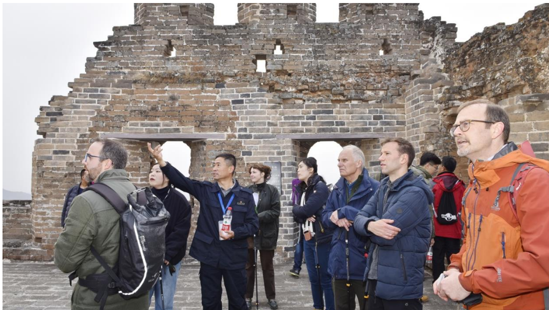
Participants of the Second Wall-to-Wall Dialogue visiting the Jinshanling Section of the Great Wall