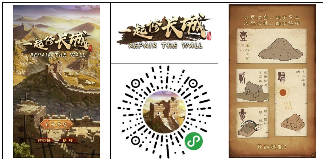
Online games assimilating elements of the Great Wall (source: China Foundation for Cultural Heritage Conservation)

Moreover, the National Cultural Heritage Administration has also encouraged social sectors to promote the culture of the Great Wall in various forms, such as assimilating elements of the Great Wall into online games, animations, column articles and creative products and making use of new media platforms and the Internet, so as to attract more young people to give attention to and participate in the conservation of the Great Wall.