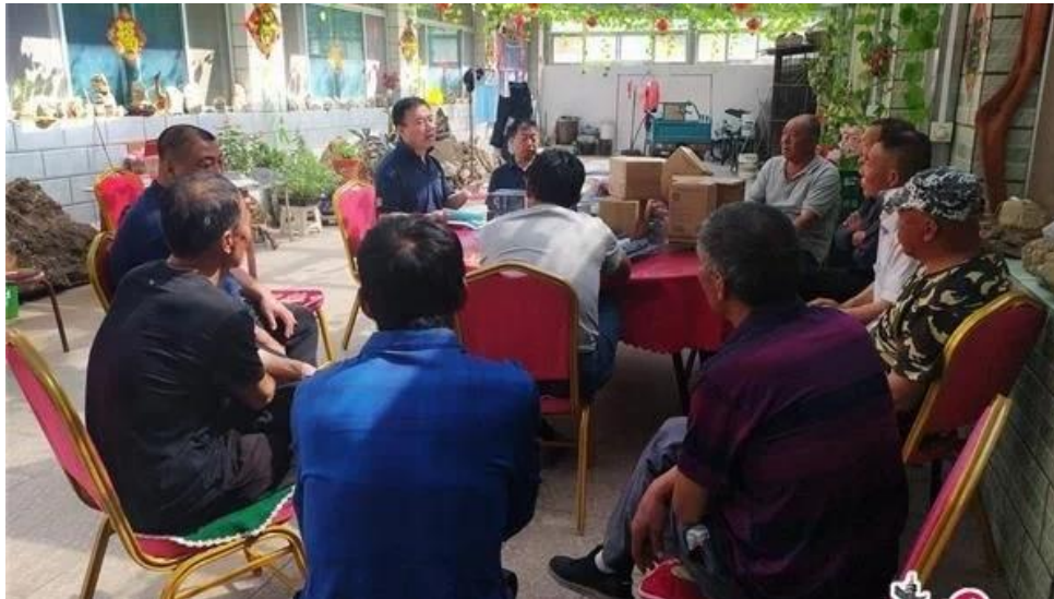
A training workshop for conservationists of the Jinshanling Section of the Great Wall from Luanping County, Hebei Province

and standard trainings for 577 conservationists and grassroots workers from six districts and countries of Beijing and Hebei.