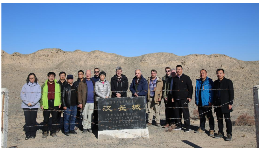
Chinese and British archaeologists and mapping experts visiting the Han Great Wall in Jiuquan

Following the Second Wall-to-Wall Dialogue, on 9-13 November 2019, The Chinese Academy of Cultural Heritage arranged a visit to the Jiayuguan Section for British archaeologists and mapping experts to conduct thematic study of archaeological landscapes of the Great Wall. During the study tour, British experts visited Great Wall remains of the Han and Ming Great Wall in Jiayuguan and Jiuquan, including walls, trenches, fortresses and beacon towers, as well as their surrounding environments. British experts also discussed cooperation intention with the Jiayuguan Silk Roads (the Great Wall) Research Institute, planning themes, technical routes and organizational structures for Wall-to-Wall cooperative studies.