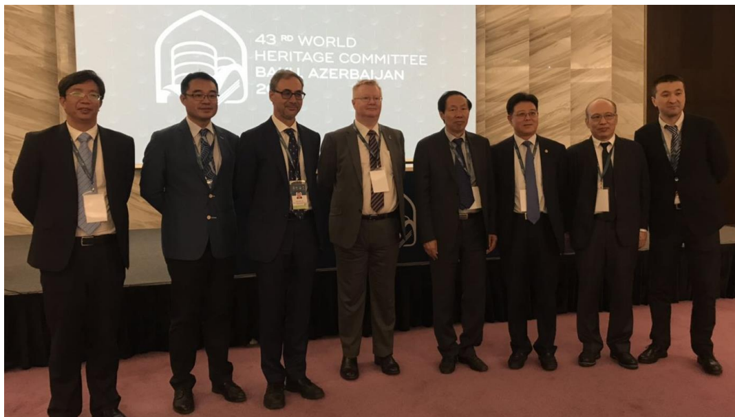
Representatives from the National Cultural Heritage Administration of China, the Chinese Academy of Cultural Heritage, UNESCO and the British Delegation take a group photo during the side event at the 43 rd session of the World Heritage Committee.