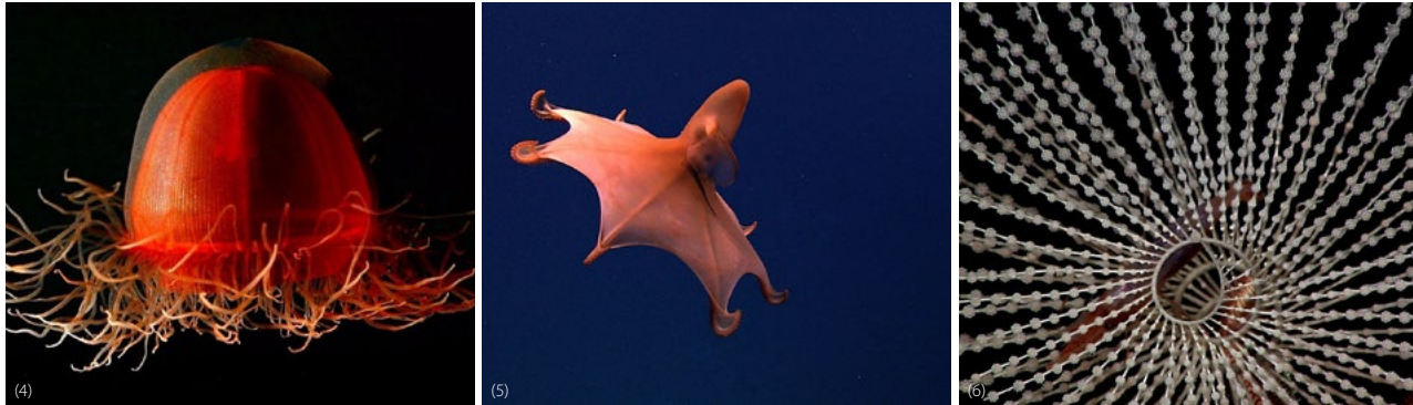
4/ Crossota sp., a deep red medusa found just off the bottom of the deep sea. Alaska, Beaufort Sea, North of Point Barrow. 5/ Dumbo octopus seen while exploring the west wall of Mona Canyon. 6/ Looking straight down the axis of an Iridogorgia coral. Note the large shrimp on the left and a brittle star to the right.