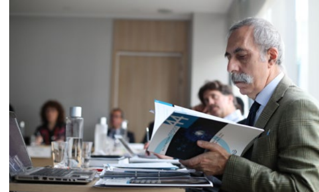
Participants of the 2018 expert workshop, Monte Carlo

The Operational Guidelines encourage States Parties to harmonize their Tentative Lists at regional and thematic levels, i.e. to collectively assess their respective Tentative Lists to review gaps and identify common themes. 12