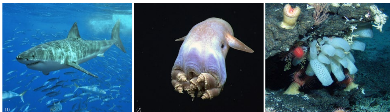
1/ Great white shark at Isla Guadalupe, Mexico, August 2006. Animal estimated at 11-12 feet (3.3 to 3.6 m) in length, age unknown. 2/ A dumbo octopus displays a body posture never before observed in cirrate octopods. 3/ Diverse coral gardens and complex sea-cliff deep-sea communities characterized by large anemones, large sponges and octocorals at the Atlantis Bank, South West Indian Ocean.