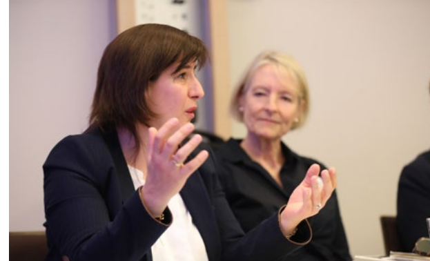
Participants of the 2018 expert workshop, Monte Carlo