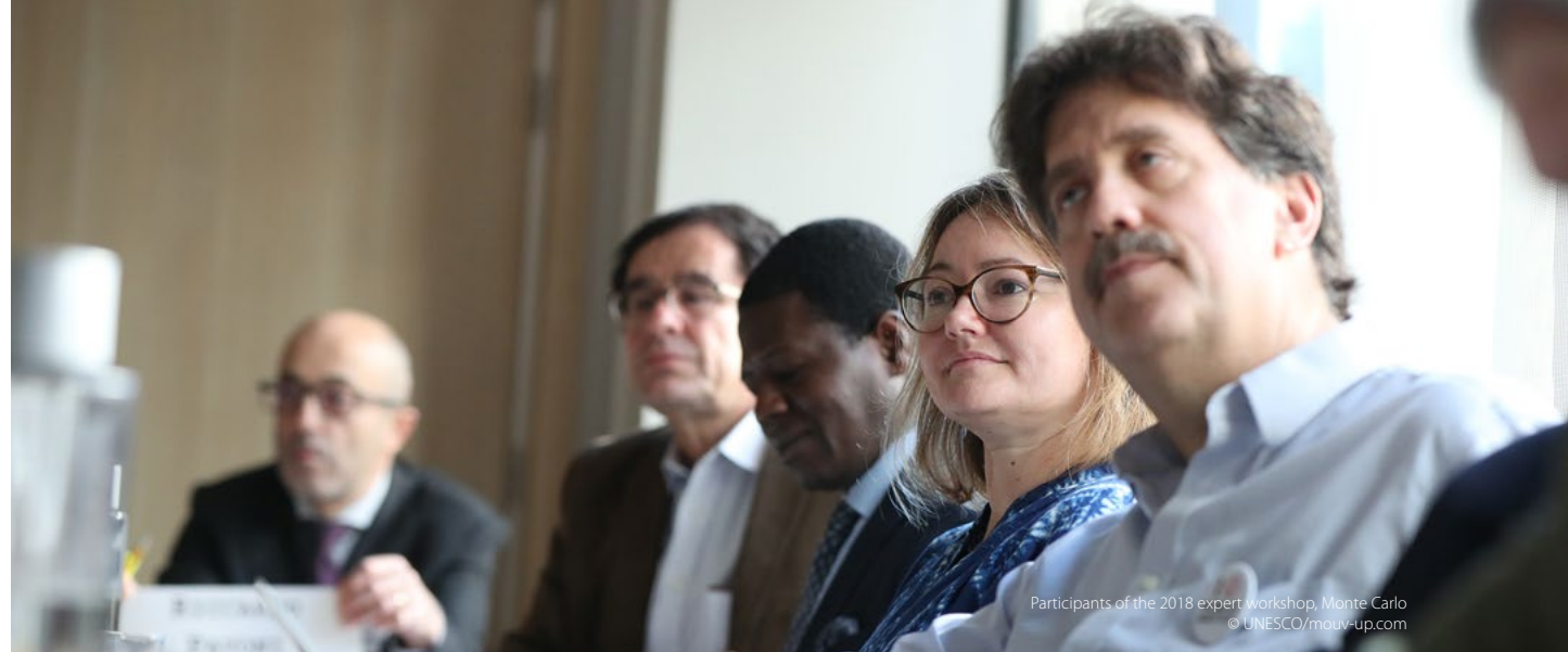
Participants of the 2018 expert workshop, Monte Carlo

Barrier Reef as the first marine site in 1981, marine World Heritage has grown into a global collection of unique ocean places stretching from the tropics to the poles (see Figure 1).