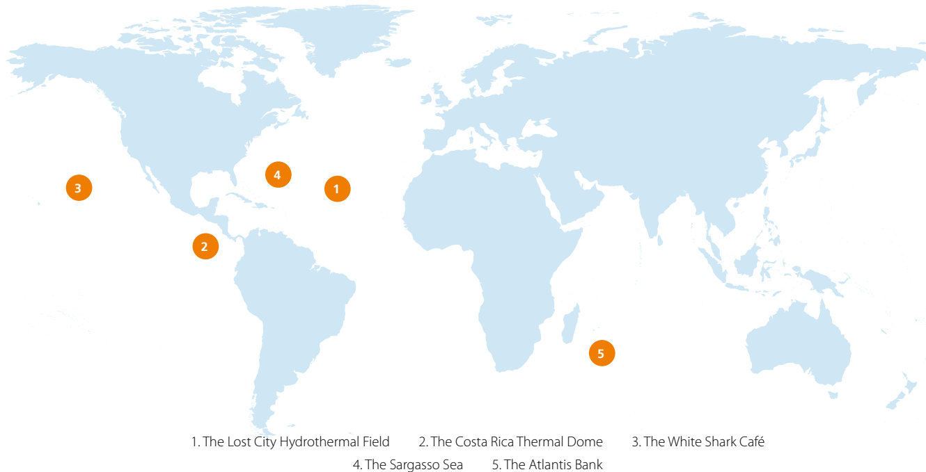
Figure 3: Illustrations of potential Outstanding Universal Value in areas beyond national jurisdiction