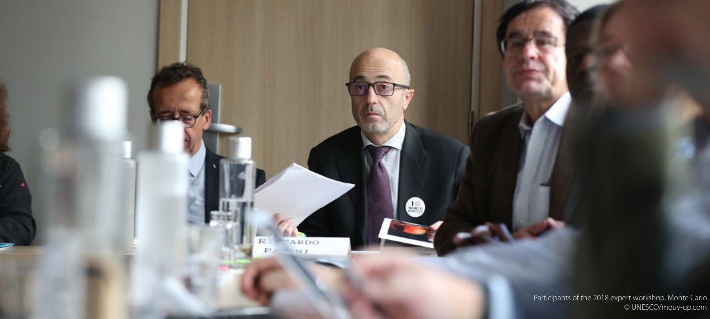
Participants of the 2018 expert workshop, Monte Carlo

the Convention on Biological Diversity (CBD). While competent bodies with a management mandate to address particular threats have been identified, 20 the experts are of the view that there is currently no management system in place that could adequately protect the site. A Costa Rican law requires the Government to ensure the protection and sustainable management of marine resources in the parts of The Dome within national jurisdiction and to promote the importance of managing the marine resources of The Dome internationally. 21