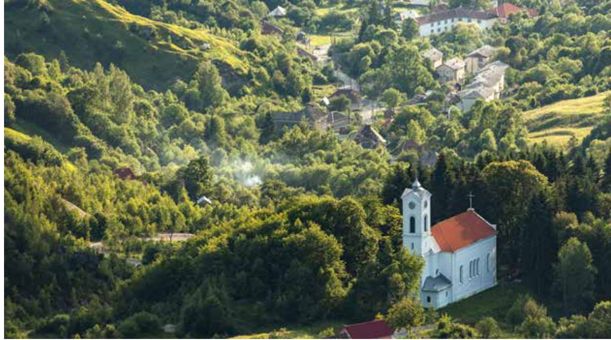
Roman-Catholic church and cemetery, in the historic centre of Roşia Montană