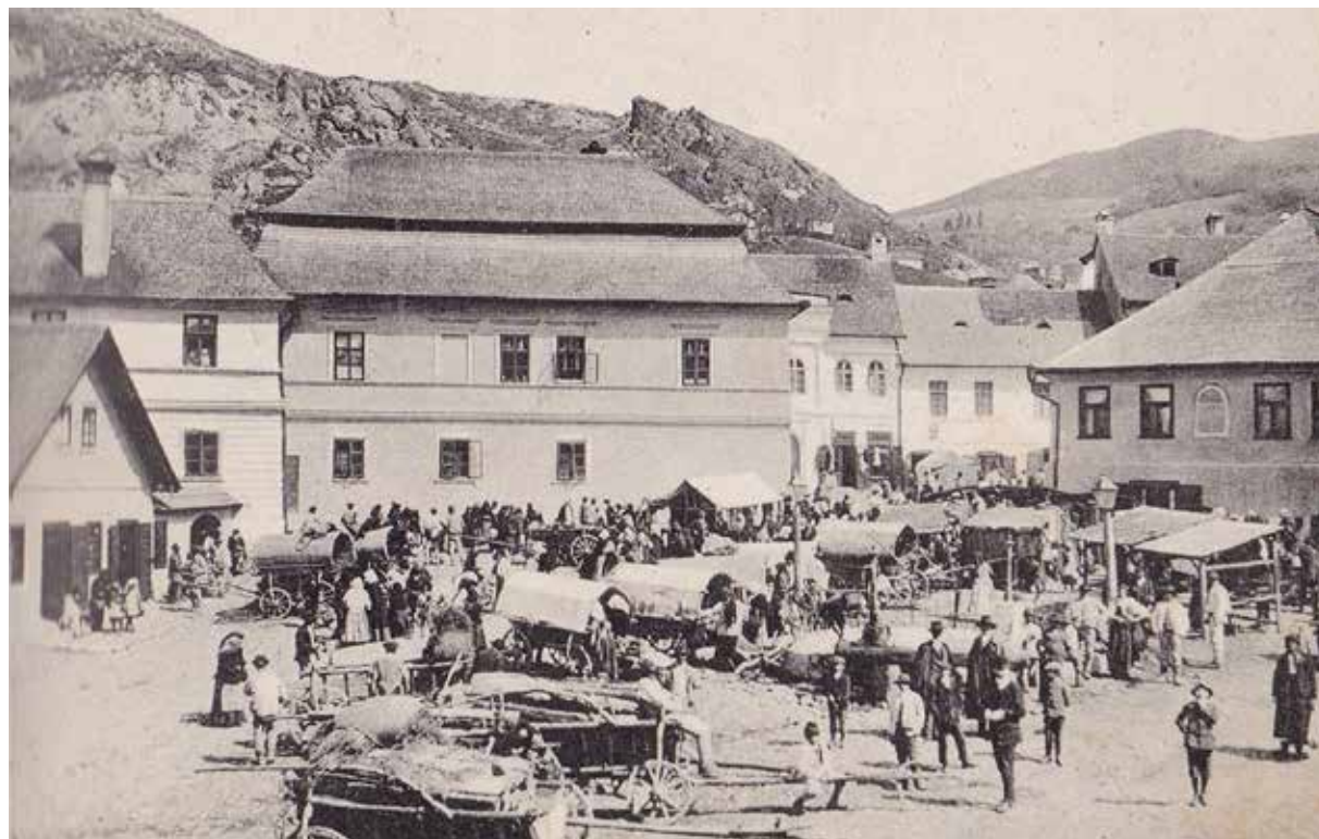
The Square on a market day. In the background Ajtai Palace, demolished in the 1980s, photograph from the 1900s (C. Lajos)