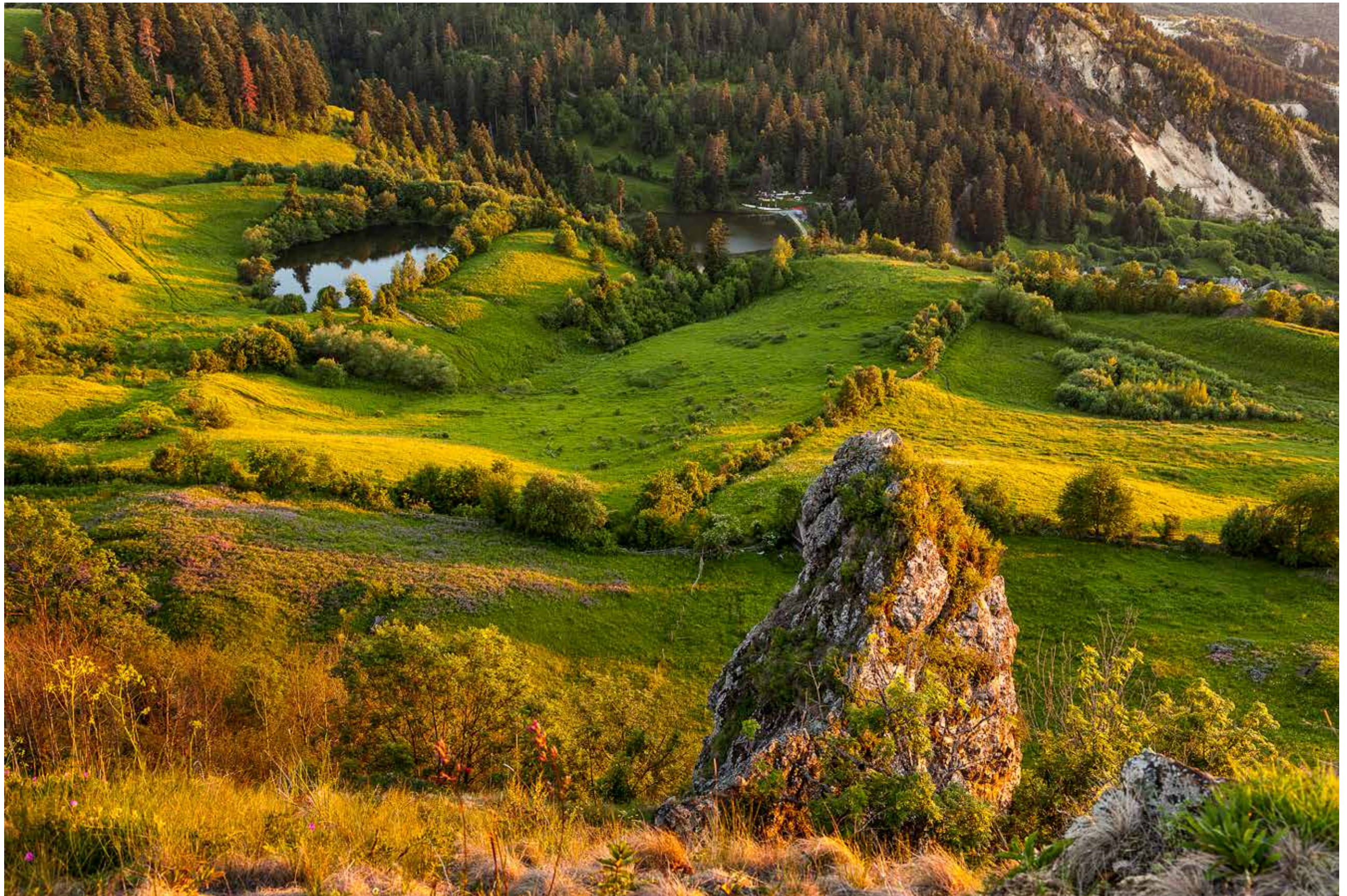
Mining and agro-pastoral landscape, Tăul Anghel and Tăul Brazi