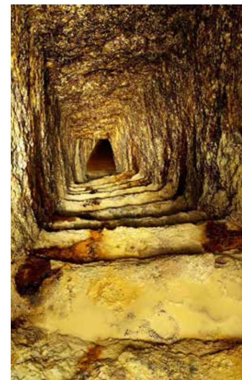
Roman mining gallery

In terms of knowledge, unparalleled epigraphic and documentary evidence combined with a decade of intensive systematic archaeological investigation has already provided a major contribution to the understanding of Roman mining techniques and organisation. Significant potential remains for the Roman period as well as for further stages in the mining landscape evolution.