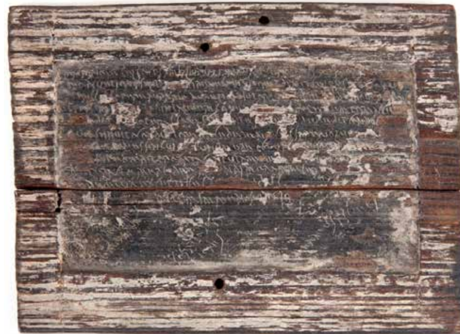
Wax-coated tablet XI (NHMR Archives)

Around 50 Roman wax-coated wooden tablets were discovered during the 1780s and 1850s in mining galleries at Roşia Montană, with some 24 surviving in museums around the world. These are first-rate sources of legal, socio-economic, demographic and linguistic information not only regarding Alburnus Maior but the entire Dacian province and, implicitly, the Roman Empire. The tablets provide intimate details of life in the mining community and are also correlated with an unparalleled number of stone epigraphic monuments, votive and funerary, discovered on site and preserved in museums at Roşia Montană, Cluj-Napoca, Turda,