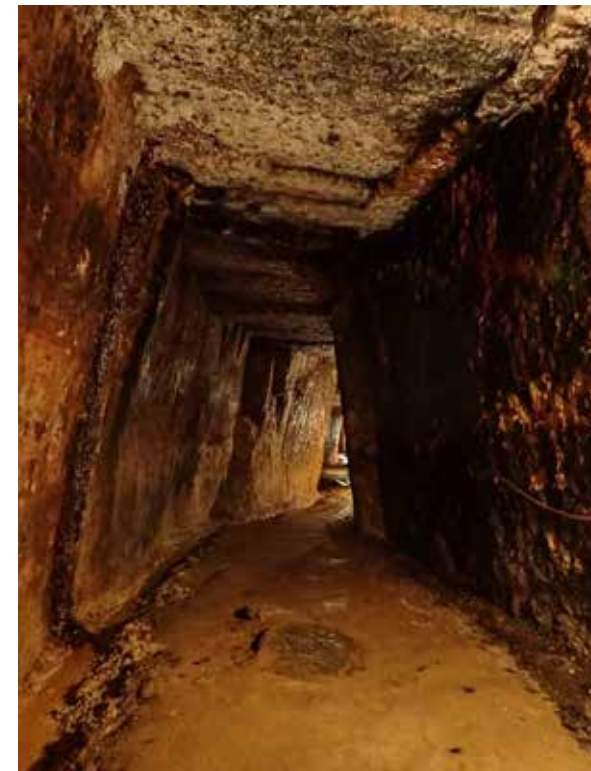
Typical Roman mining gallery in Mt. Orlea