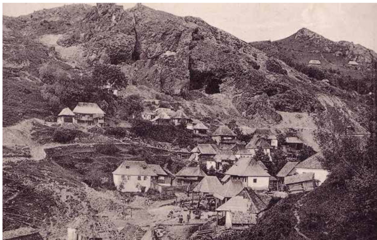
Văidoaia area, a typical small-scale mining neighborhood; each house or group of houses had a stamping mill, photograph from the 1900s