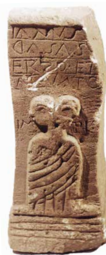
Votive altar dedicated to Janus, Hop Găuri Area

The perceived value of Roşia Montană's gold resources, like that of other gold-producing regions, changes with time, trade, technology and ownership of territory. The destination and uses of gold also change with the above. For the Romans, gold was vital for currency to pay its soldiers across its Frontiers - and for funding the import traffic that plied the 'roads' of silk and spices that led to Rome.