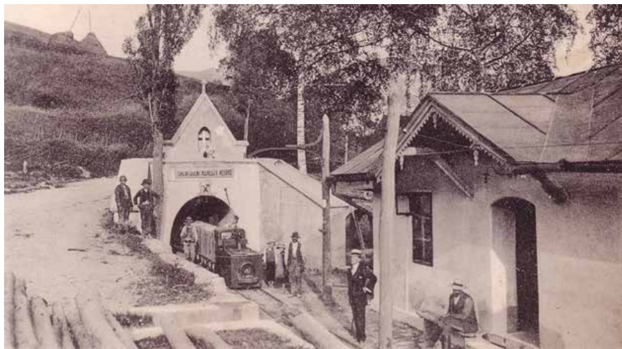
The entrance to the Holly Cross master gallery, photograph from the 1900's (C. Lajos)

mining and ore-processing methods captured at the moment of technological changes on the verge of the modern industrial revolution. Mining operations undertaken at this time were mostly by 'freeholder' families that favoured the continuation of such ore-dressing methods until nationalisation in 1948.