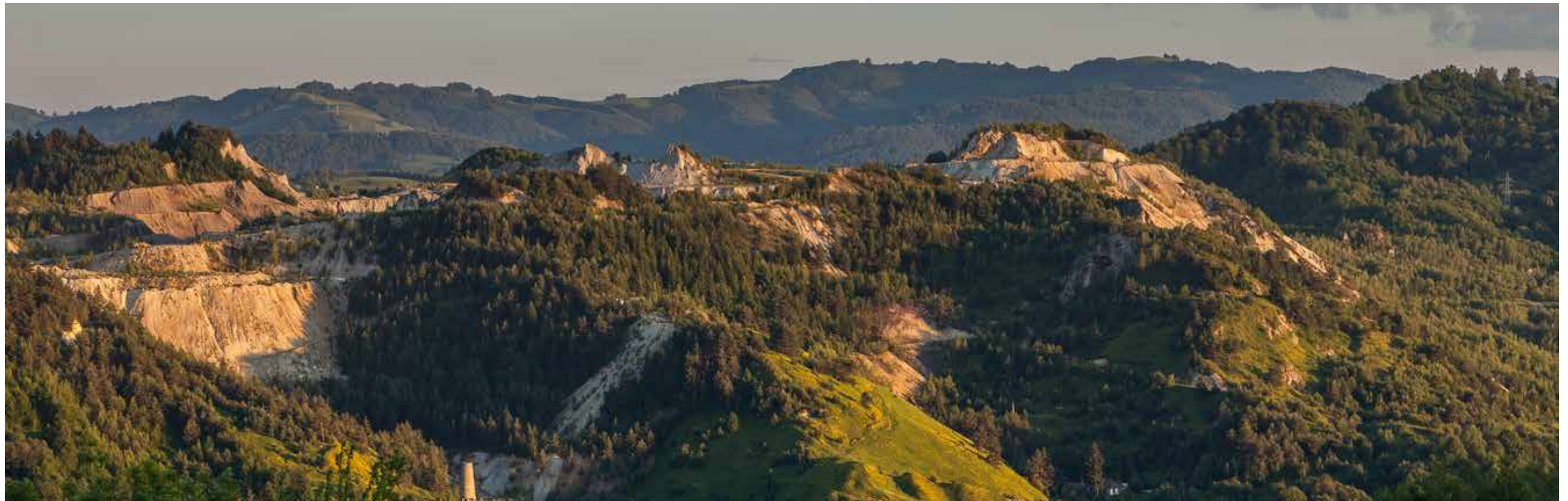
General view - Cetate Massif with the traces of the open pit mine from the Communist period