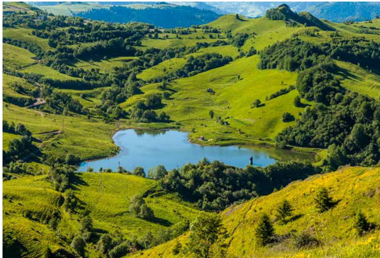
Tăul Mare

The boundary of the property has been delineated by a process of first by mapping the range of identified attributes that convey potential Outstanding Universal Value, ensuring that all of these are encompassed in order to meet the condition of integrity, and then by carefully selecting a clearly defined line that can be readily identified on the ground. Due consideration was also given to protection and management criteria.