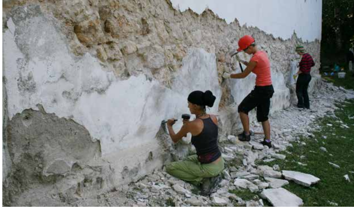
Training workcamp ( Adoptă o casă Summer Schools)

The property is included in a wider area that is designated in view of its protection by urban planning regulations, an area that also comprises several individually designated elements, from the Roman mining works, to the historic houses and two geological formations.