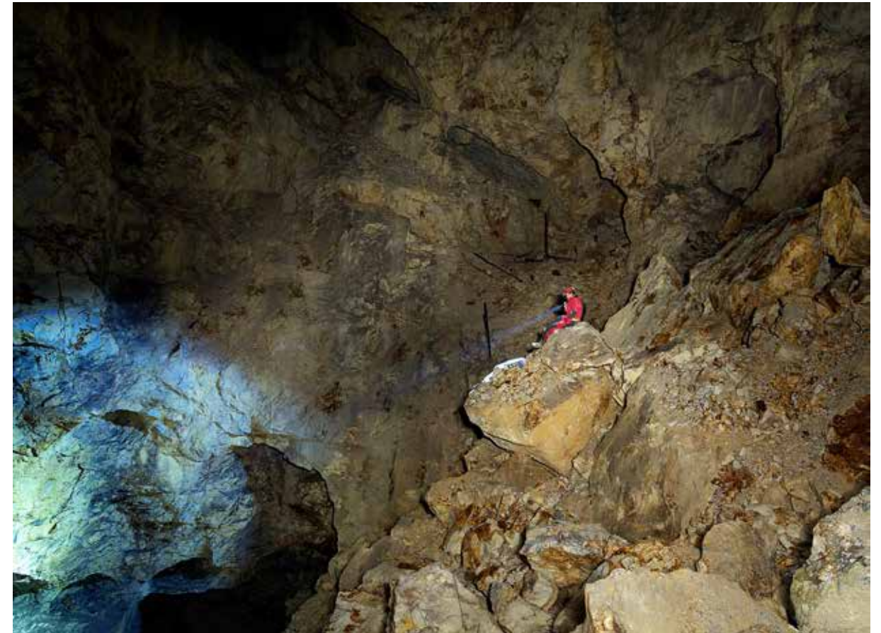
Traces of modern mining, Mt. Cârnic

An active citizenship journey over the last decade, where civic society and heritage practitioners have come together in recognition of the unique Roşia Montană heritage, show that the management of the property can be founded on cross-sectorial support and people-centred approaches. These programmes also triggered systematic monitoring campaigns which are now being endorsed by heritage institutions. This is already improving the capacity for specialized institutions and local authorities to work with other institutions and civil society to build on the successes of Roşia Montană and learn from the experience of working there for other heritage places.