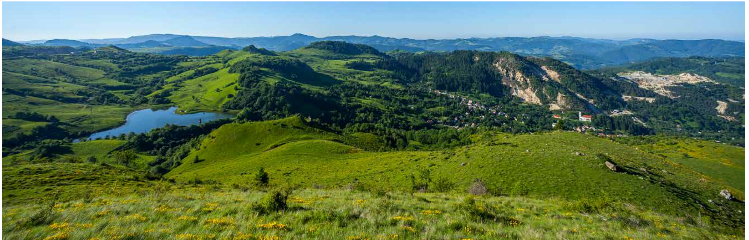
General view - Tăul Mare, Cârnic Massif, Cetate Massif and the former mining exploitation