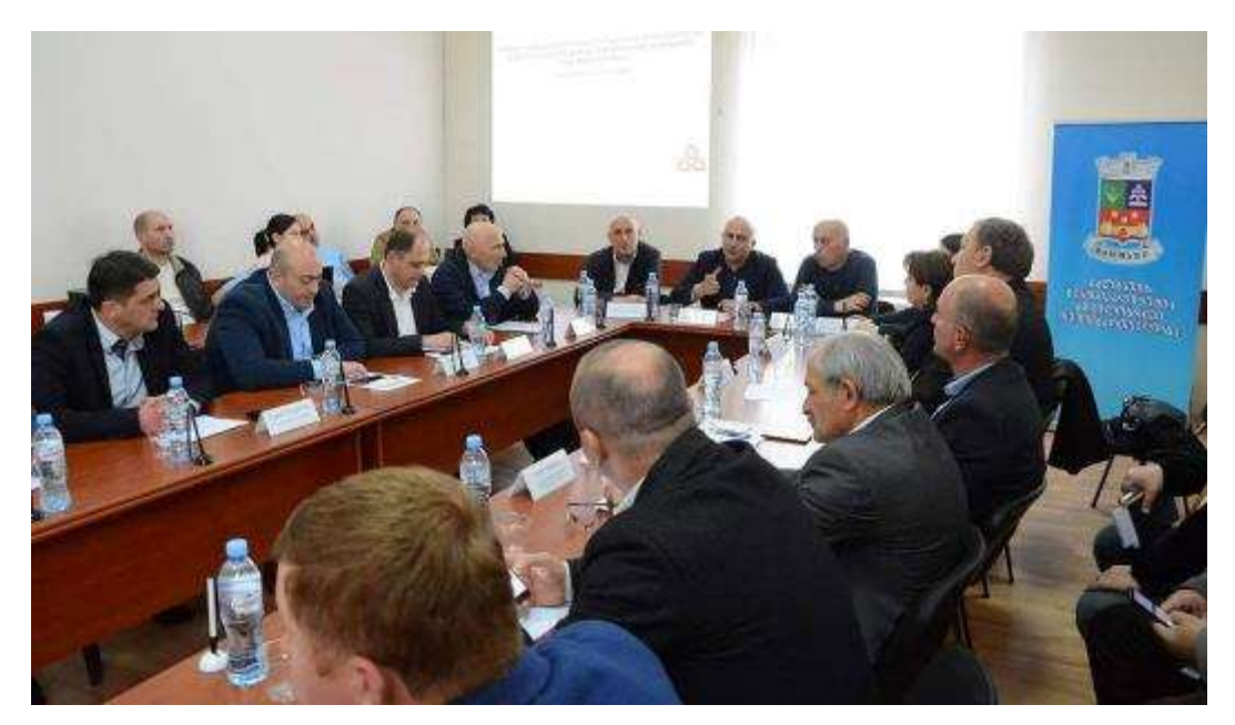
NACHPG meeting with the local authorities

Based on the lessons learned as a result of the Cultural Heritage Advisory Service by UNESCO to Georgia 2015-2017 within the World Bank RDPIII, mainly, the experience gained towards the Capacity Building activities for improving the professional abilities of all related local Authorities, mainly in the direction of the implementation of the World Heritage Convention, the periodic meetings have been launched since 2018 in the region. The main topics of the meetings are targeted to the needs of sustainable urban development to ensure the OUV of the Gelati WHS; This platform is also used to provide and share the information about the ongoing and planned activities to harmonise the overall commitment towards the proper conservation of the WH property;