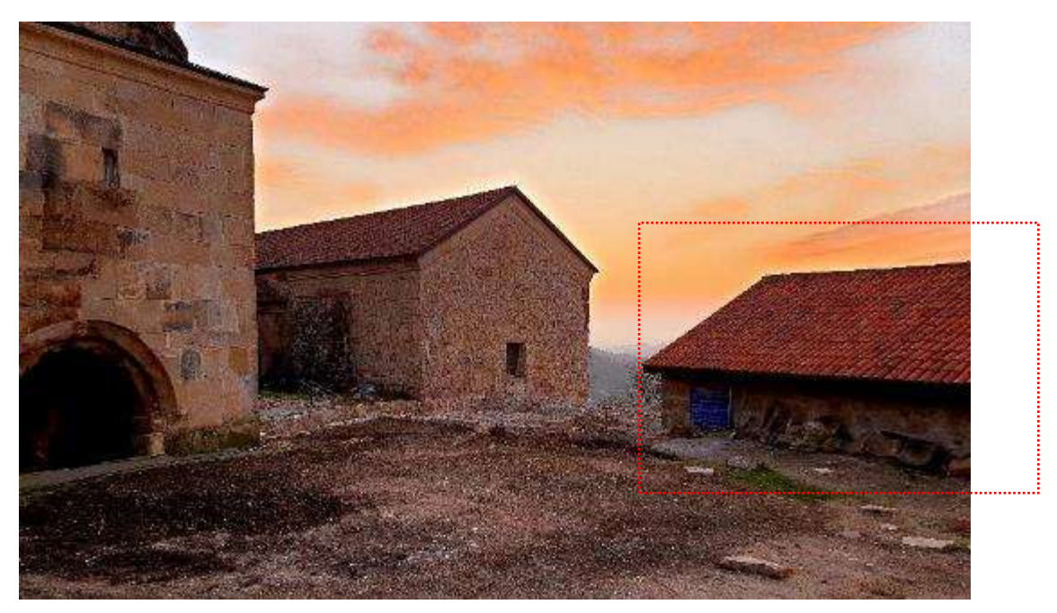
Rehabilitated Oil-mill on the right

Furthermore, in 2019, the Tkibuli municipality, in close coordination with the NACHPG and in conformity to the Infrastructure and conservation project developed in 2015, has launched the rehabilitation of the old pathway connecting the village to the complex from the southwestern side.