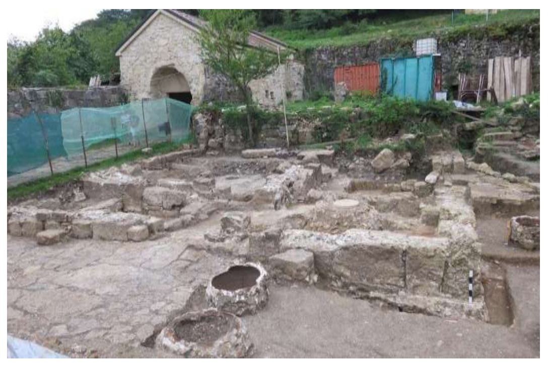
Recently excavated archaeological object, next to the St. George church

Since 2018, the drainage system of the main church of the complex is being arranged, integrating the remains of the historical drainage, completed by the end of the 2019. During the ground-works large archaeological remains have been found next to the St George Church, which has been scientifically studied (see annex 2).