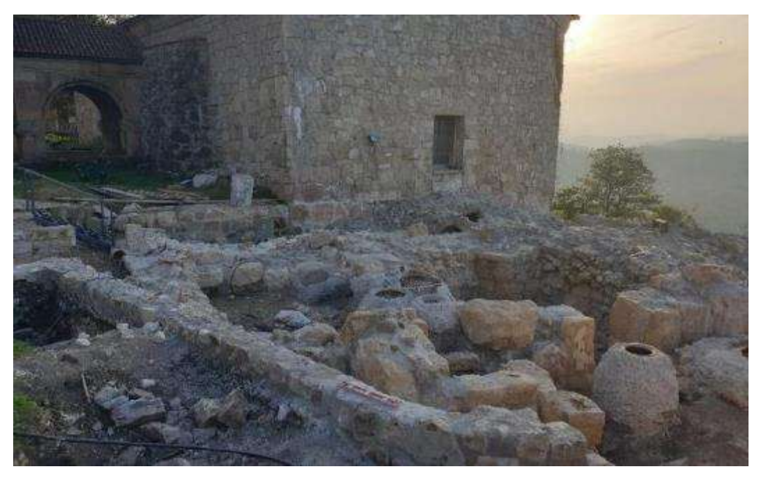
Excavated cellar areas next to the Academy