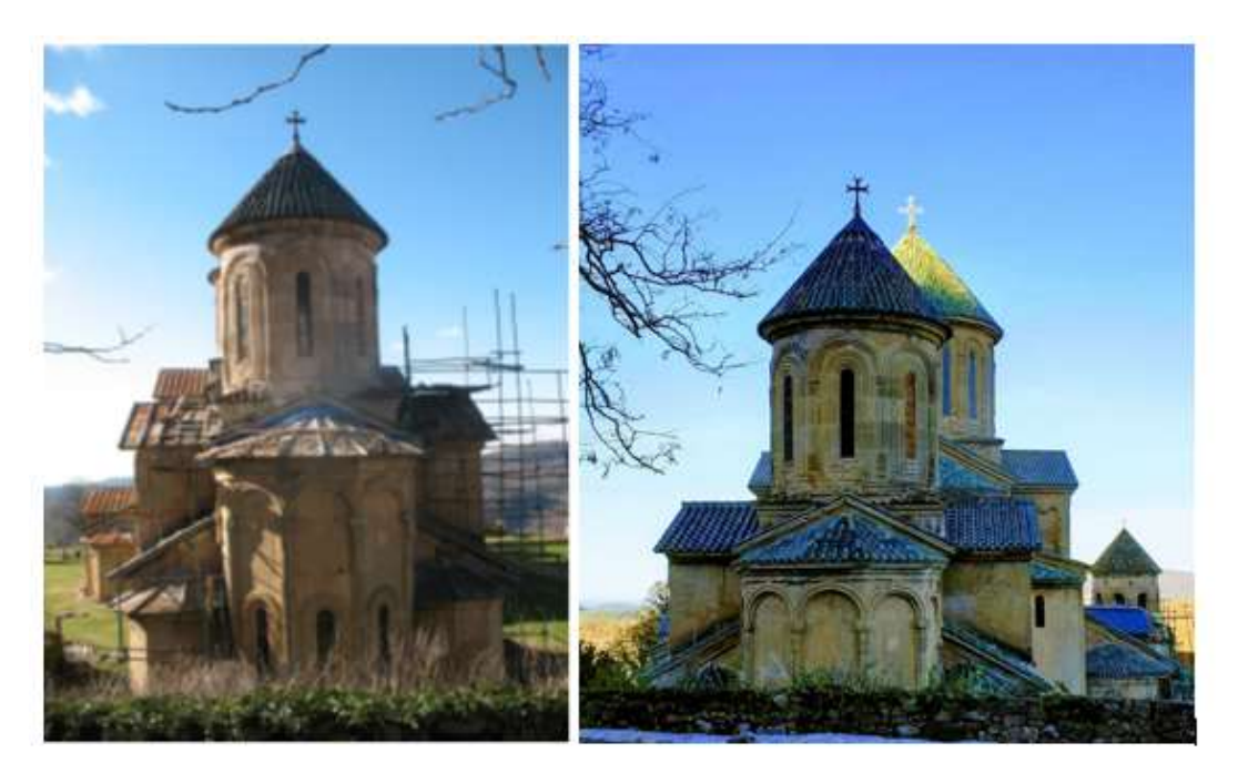
St. George Church, left photo: 2015, right photo: 2019

Since 2018, the drainage system of the main church of the complex is being arranged, integrating the remains of the historical drainage, completed by the end of the 2019. During the ground-works large archaeological remains have been found next to the St George Church, which has been scientifically studied (see annex 2).