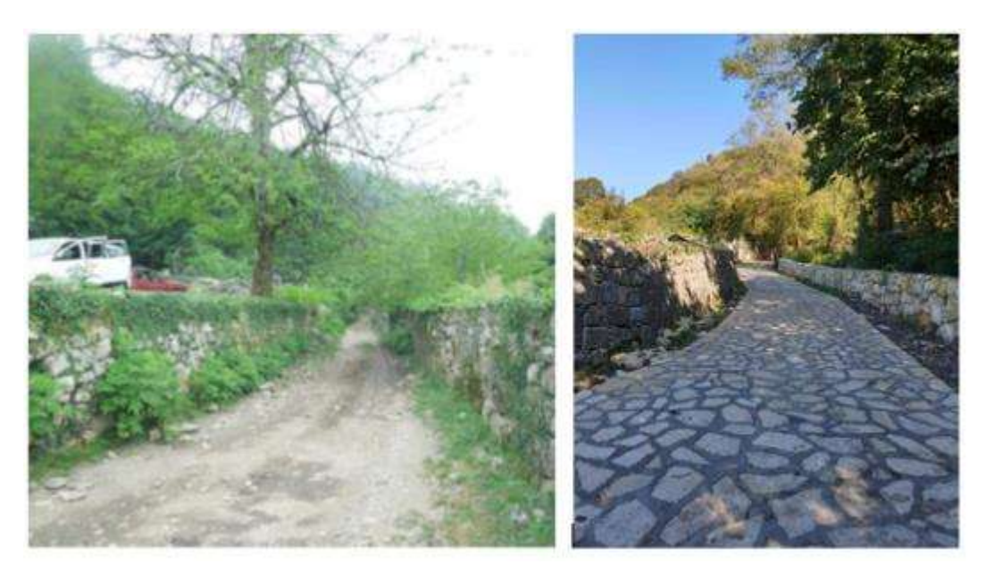
Old pathway, left photo: 2015, right: photo 2019

Furthermore, in 2019, the Tkibuli municipality, in close coordination with the NACHPG and in conformity to the Infrastructure and conservation project developed in 2015, has launched the rehabilitation of the old pathway connecting the village to the complex from the southwestern side.