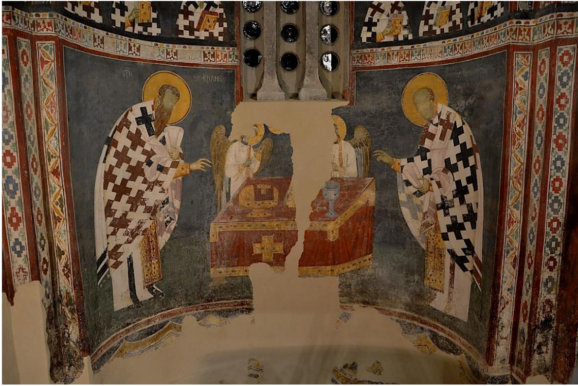
5-6. Oltar apse, before and after conservation work