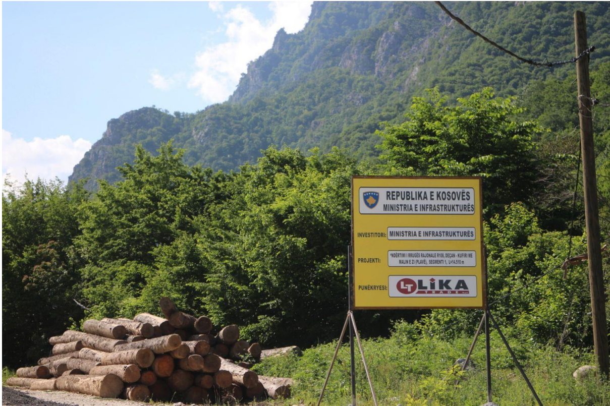
1. Table of the Provisional Institutions of Self-Government in Priština responsible for the infrastructure that marks the works in the buffer zone of Dečani Monastery