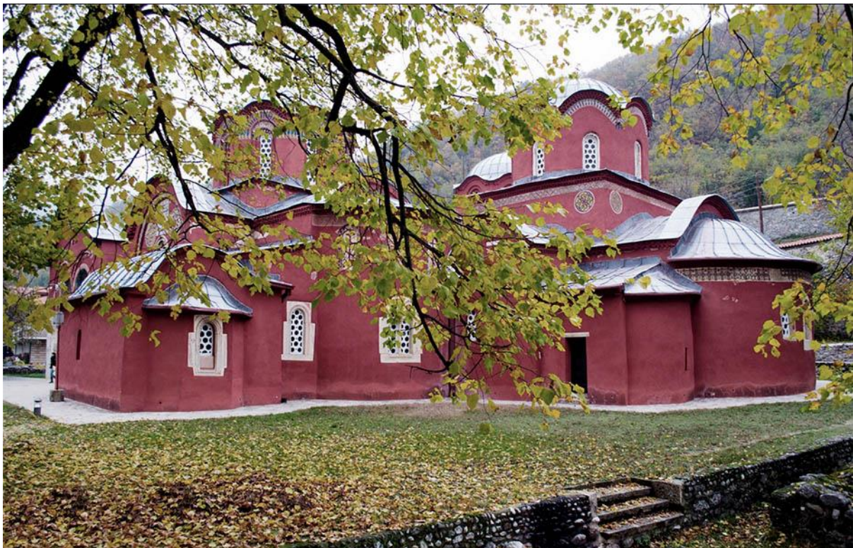
3. Southeastern look of the churches of the Patriarchate of Peć Monastery

For the reason of its constant physical endangerment, the property is still secured by the local police forces on daily basis.