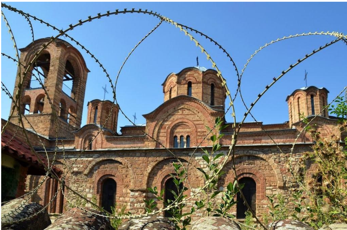
4. Southern look of the Church of the Holy Virgin of Ljeviša in Prizren,

For the reason of its constant physical endangerment, the property is still secured by the local police forces on daily basis.