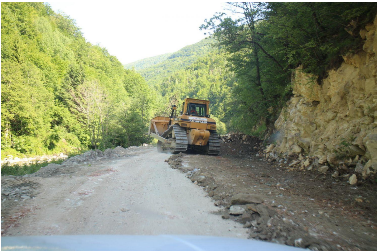
2. Earthworks on road construction through a buffer zone in the immediate vicinity of the Dečani Monastery