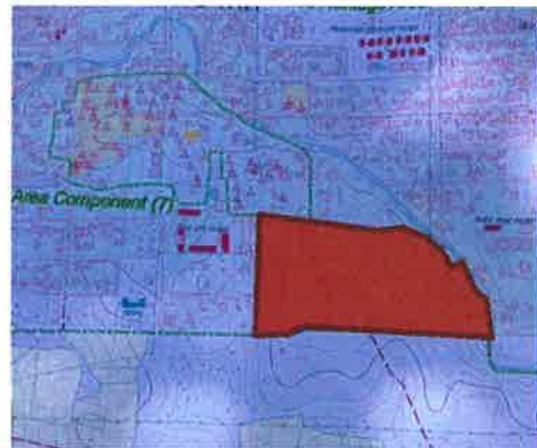
Figures 3 and 4: If Component 7 is include within the property and the property is inscribed, consideration should be given to including an area to the southeast to make it contiguous with and part of Component 1.8