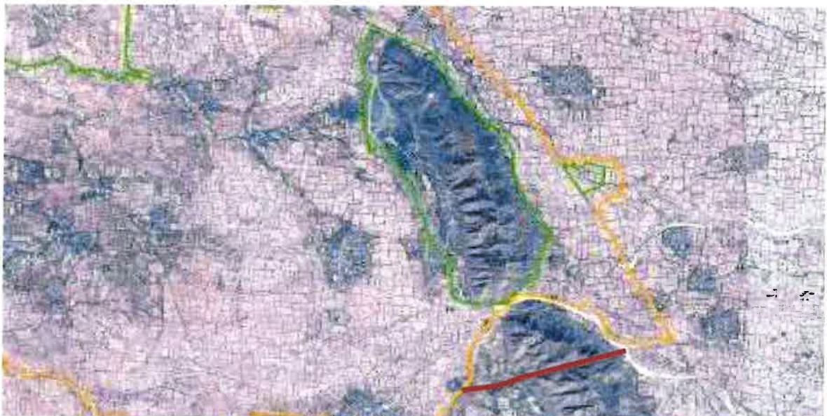
Figure 7: Indicative suggestion for re-alignment of the buffer zone, south of Tuyin Hill; the alignment should follow the ridge line.