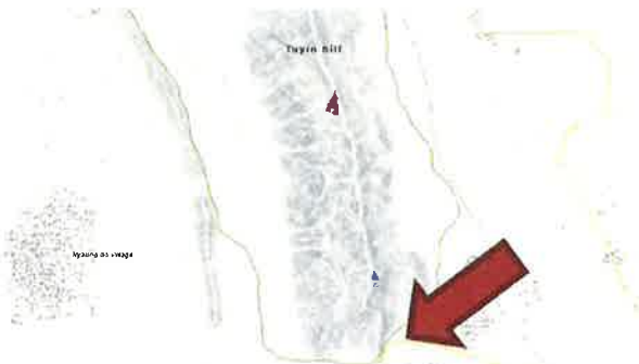
Figure 6: Component 4: Tuyin Hill. The arrow shows the valley to the south where the nominated property boundary and edge of the buffer zone are in almost the same alignment.

The ICOMOS Panel suggests that the Buffer Zone for this component should be revised, in order to follow the ridge line at the southern end of the component, rather than at the base of the small hill.