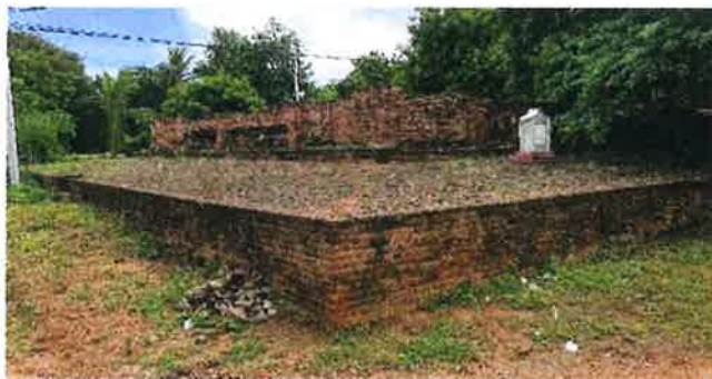
Figure 2: Foundations of former monks' residence, to northeast of Component 6.