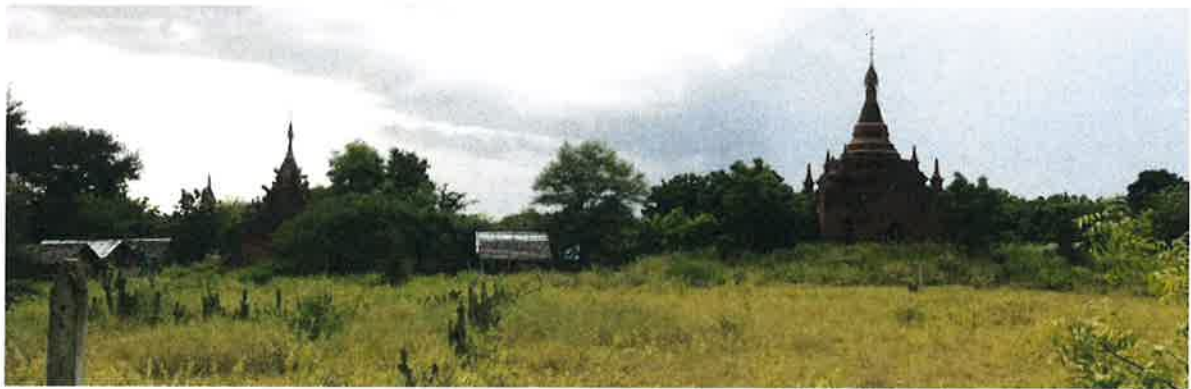
Figure 5: Component 7 – open area to southeast which offers the possibility of linking this component with Component 1.8