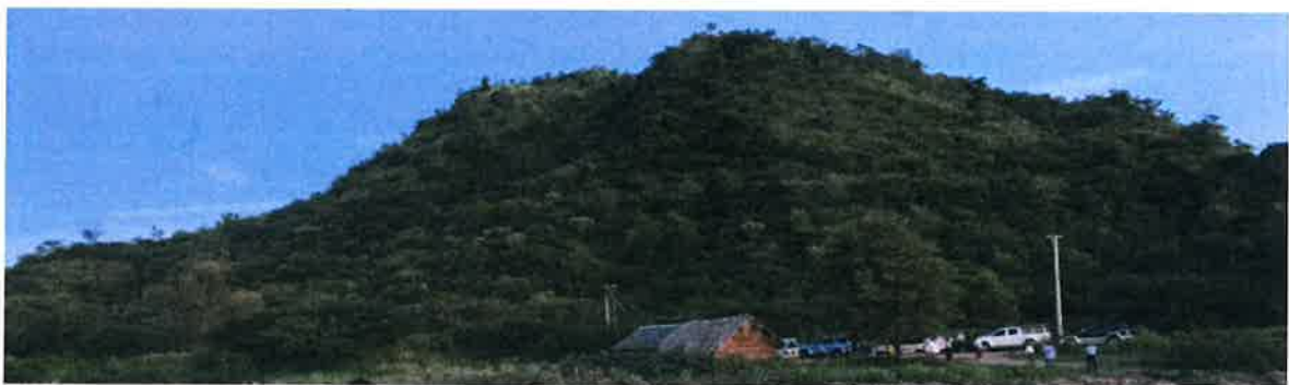
Figure 8: Hill immediately to the south of Component 4. The proposed property and buffer zone boundaries both pass between this hill and Tuyin Hill, on an almost identical alignment. It would be more appropriate for the buffer zone to run along the top of the visible ridge.