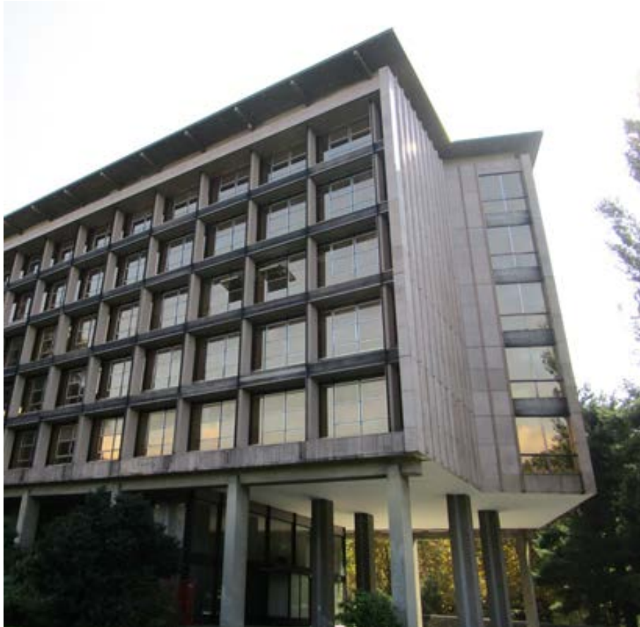
Olivetti Office Building