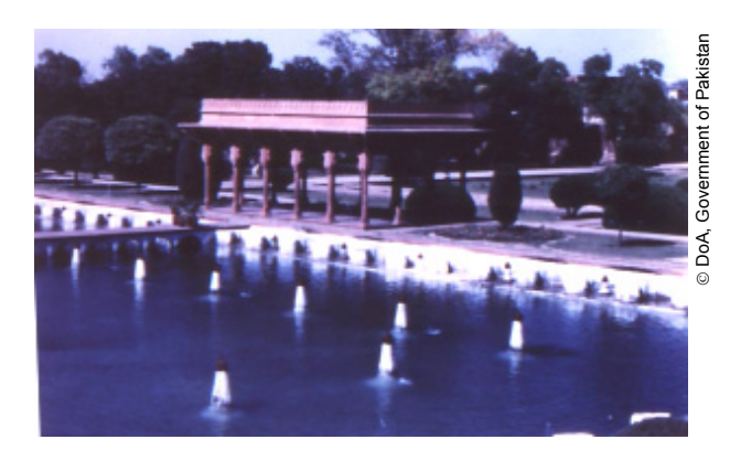
Eastern Pavillion at Middle Terrace after restoration