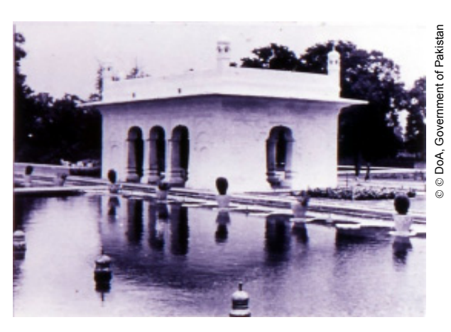
Eastern Pavillion at Middle Terrace before restoration

An Environmental Monitoring System, chemical laboratory and documentation centre are proposed as keys to developing site-monitoring indicators.