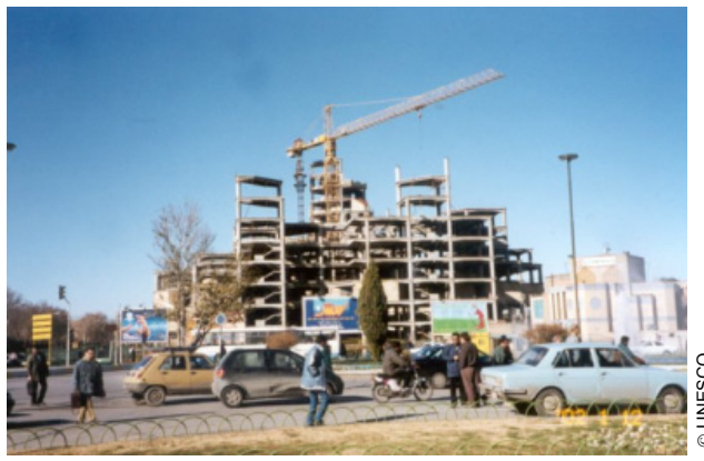
Constructions in the buffer zone