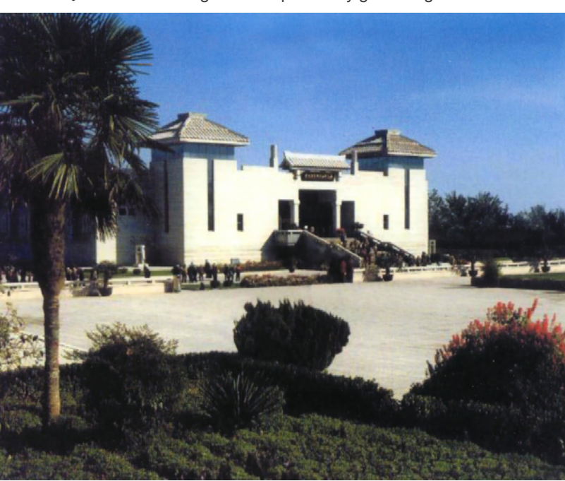
Exhibition Hall for newly displayed cultural relics