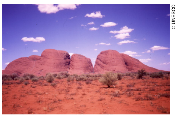
View of Kata Tjuta