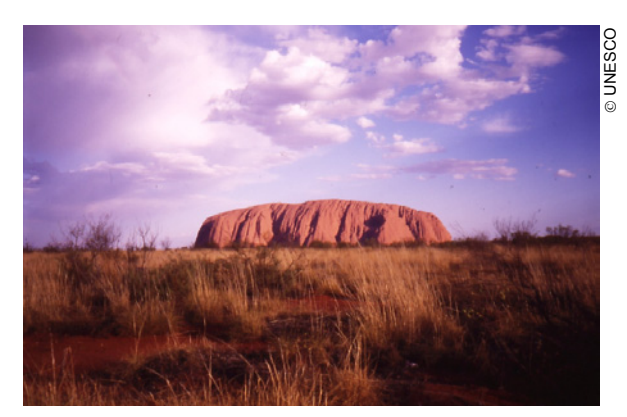
View of Uluru

During renomination in 1994, the boundaries were modified and an inappropriate air strip was removed. Since 1994, "significant road relocations, including the Kata Tjuta ring road, have been made to prevent access to sacred sites."