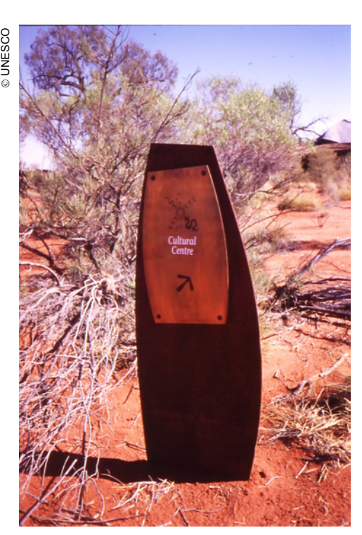
Signpost of the Uluru National Park Cultural Centre