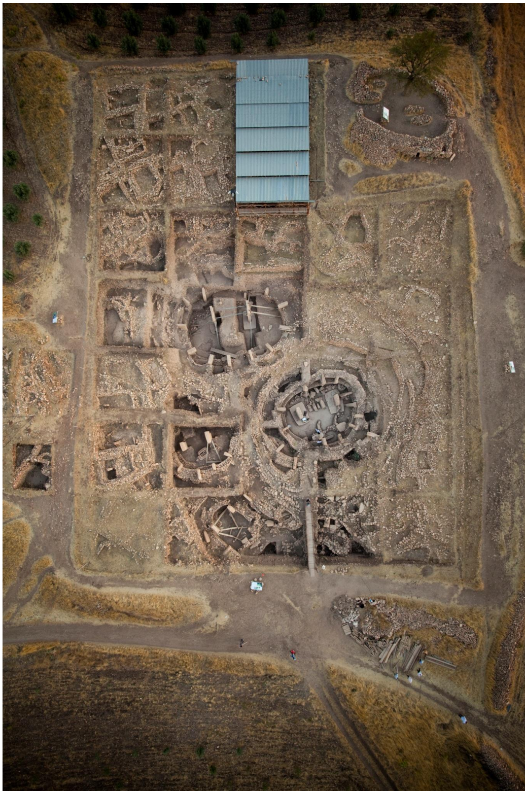
Figure 1.4 Aerial view of the Main Excavation Area (Southeast-Hollow), September 2011