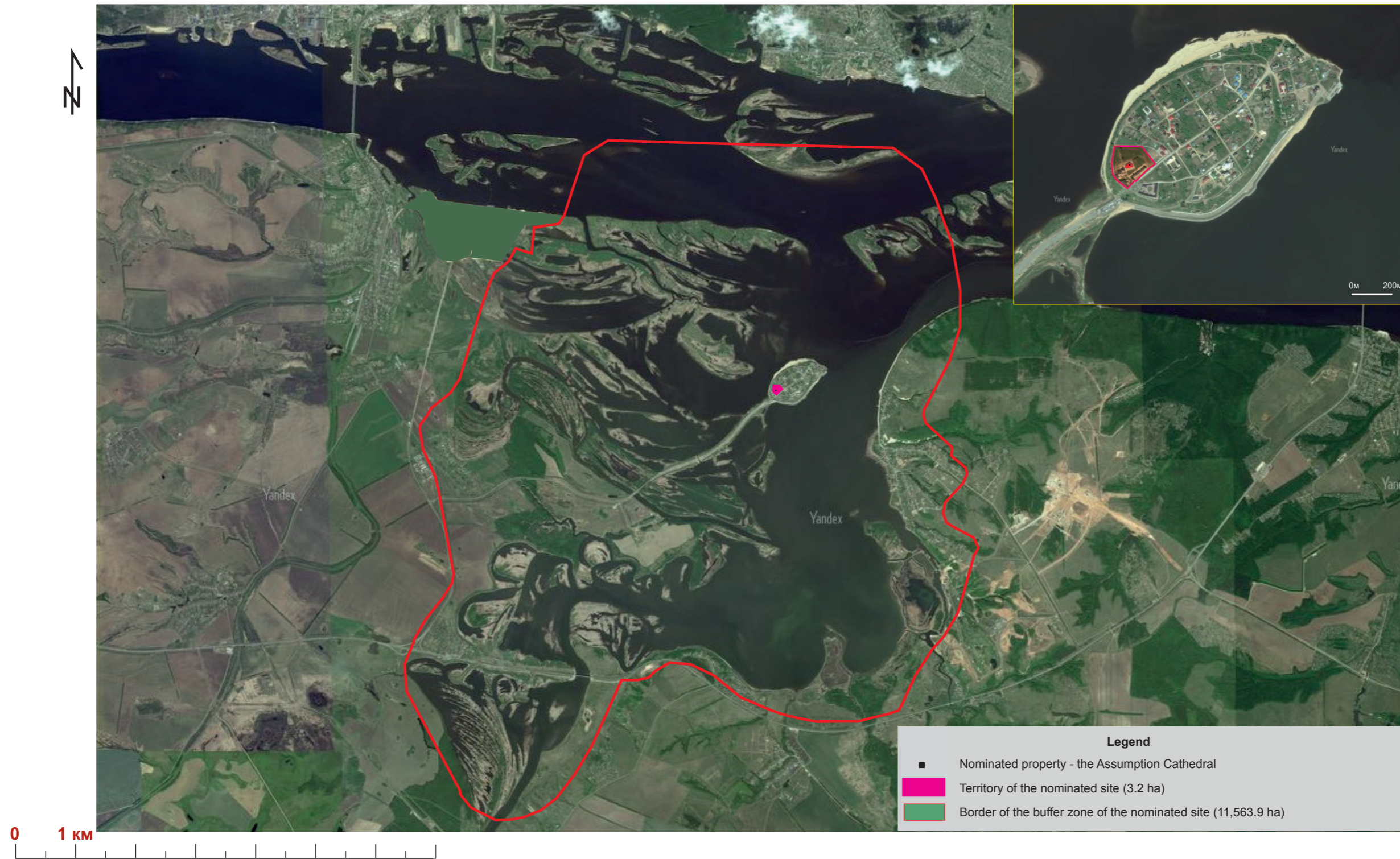
1.1. Map of the nominated property and the buffer zone. 2015