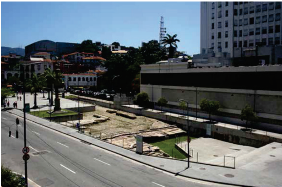
View of Valongo Wharf