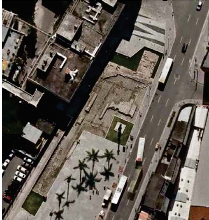
Aerial view of the property