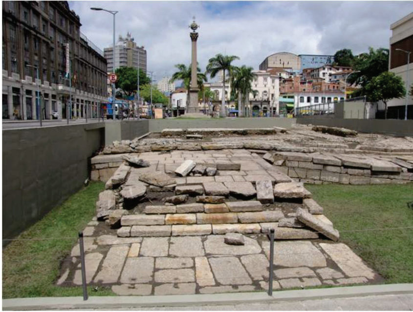
View of Valongo Wharf