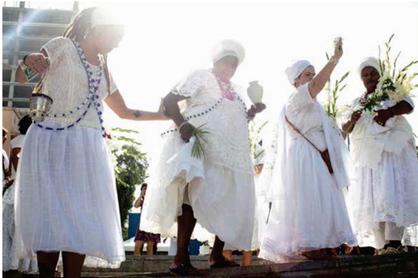
Symbolic washing of the Wharf