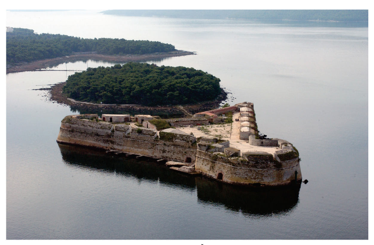
Aerial view of fort St Nikola, Šibenik (Croatia)