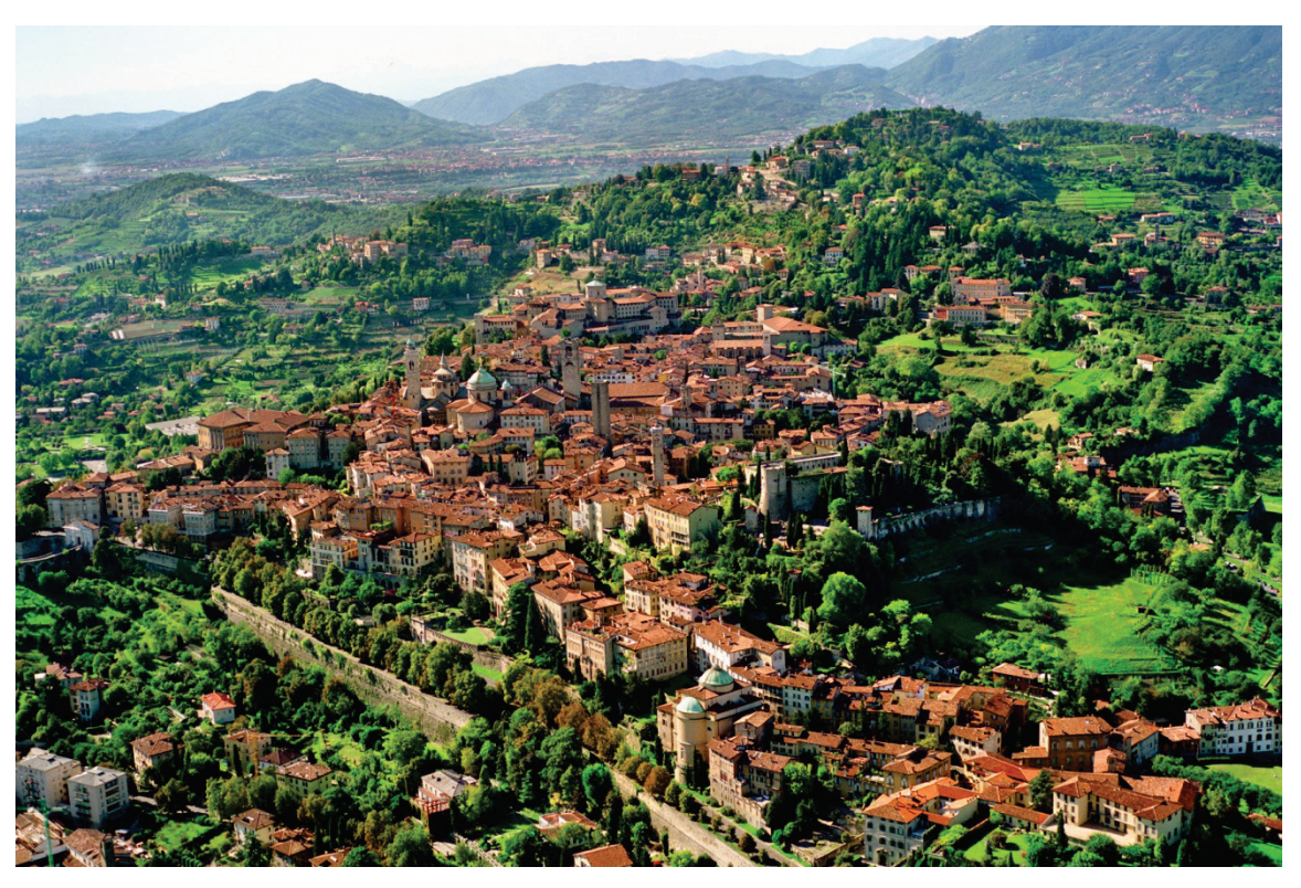
Aerial view of the fortified city of Bergamo (Italy)