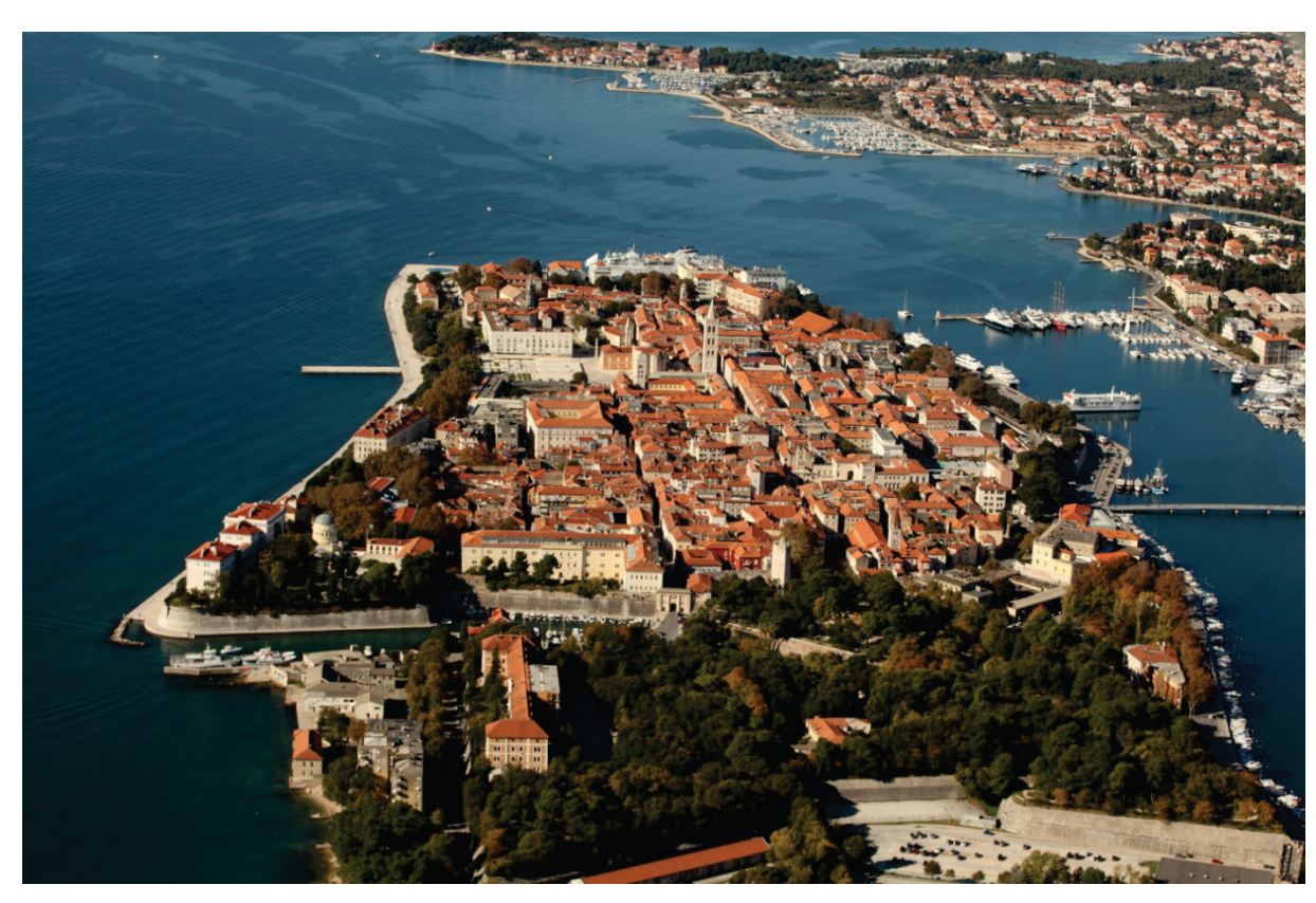
Aerial view of the peninsula of Zadar (Croatia)