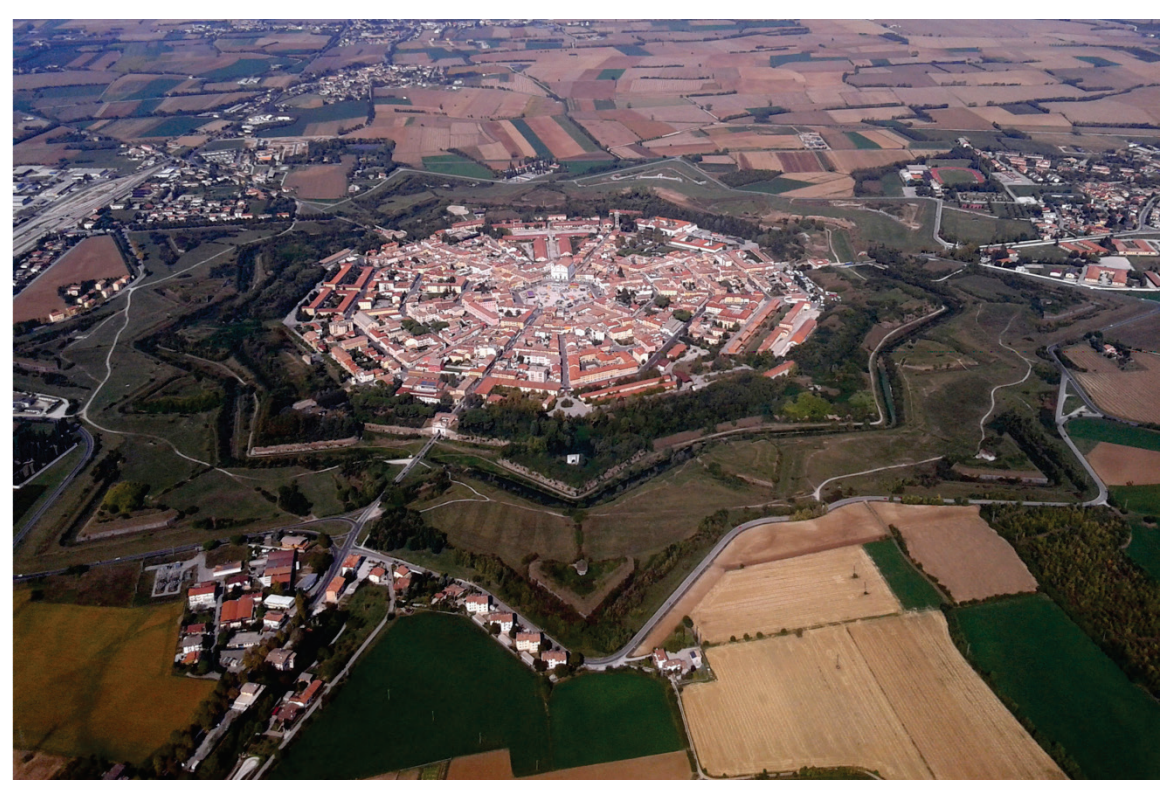
Aerial view of the city-fortress of Palmanova (Italy)