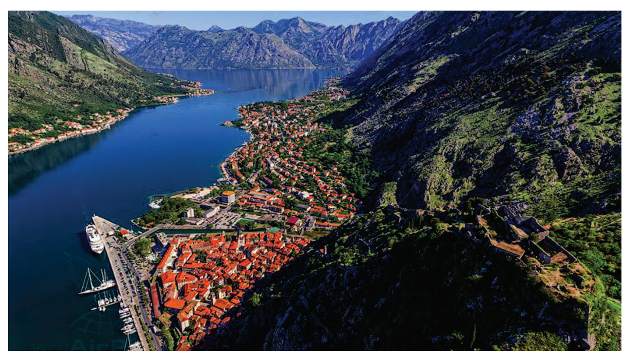
Aerial view of Kotor (Montenegro)