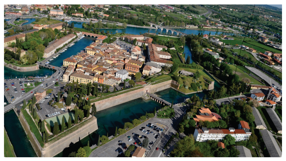
Aerial view of Peschiera del Garda (Italy)