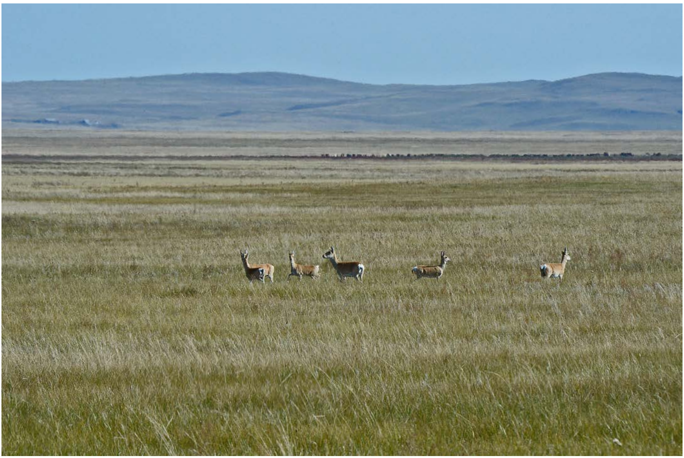
Dzeren Mongolian gazelles, Daursky State Nature Biosphere Reserve