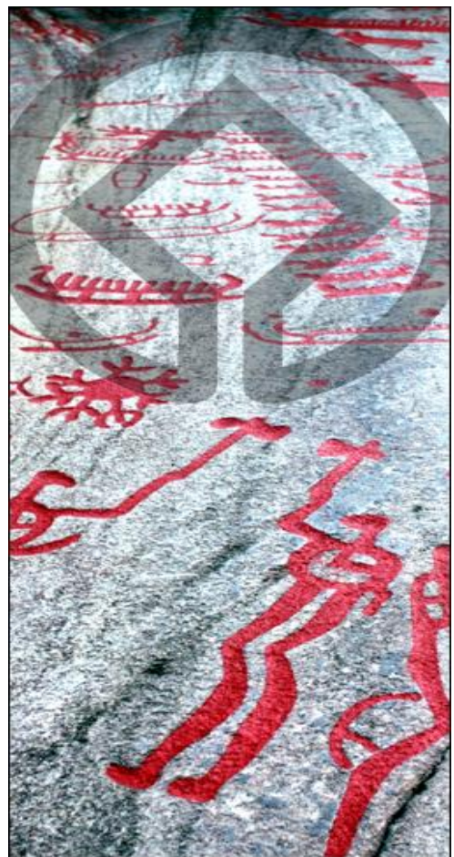
Tanum World Heritage Site showing the locations of Vitlycke Museum and larger rock carvings.