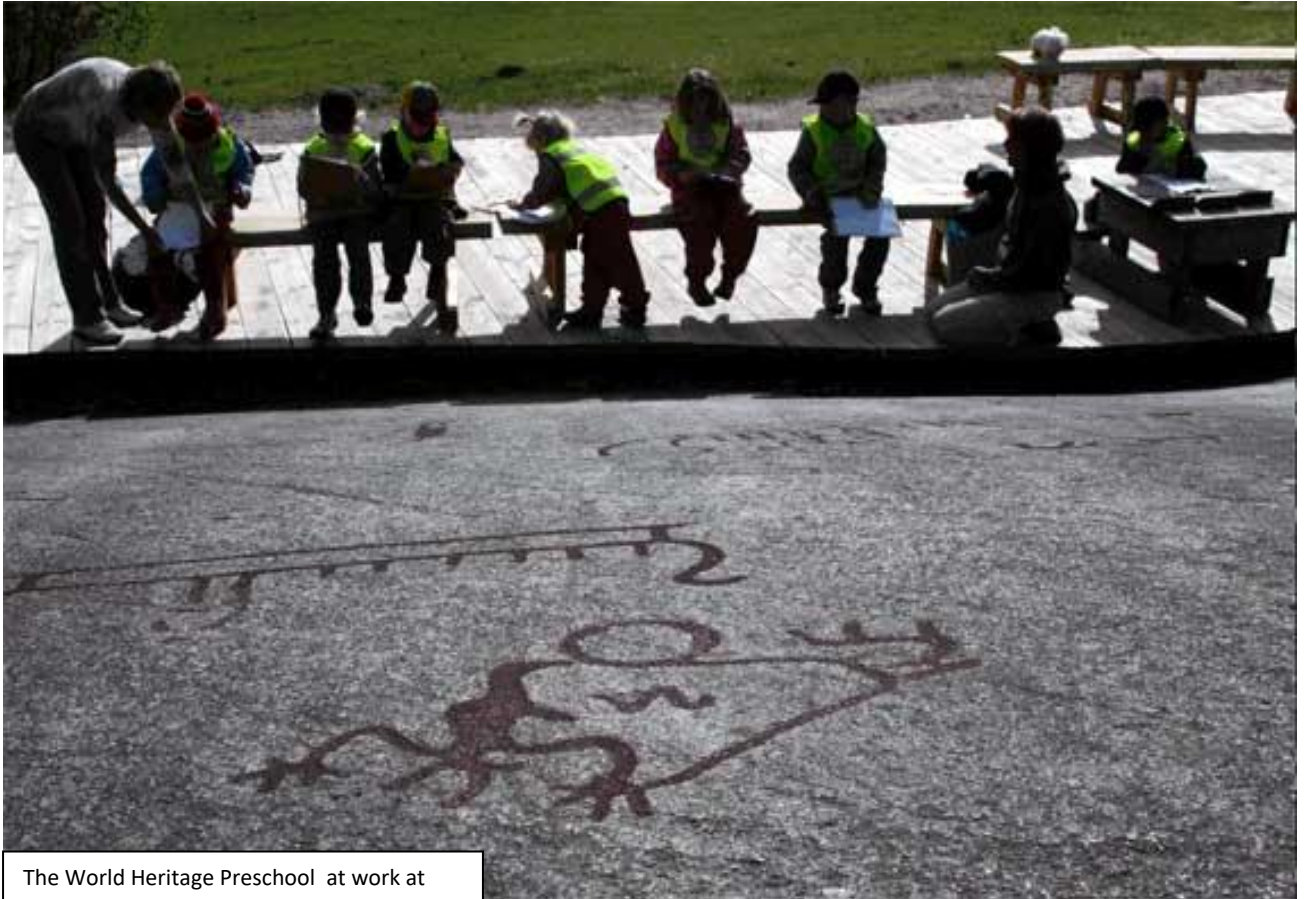
The World Heritage Preschool at work at the Vitlycke panel.