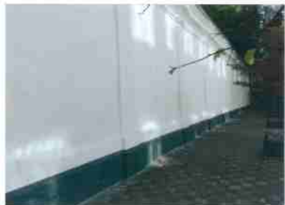
State after works.