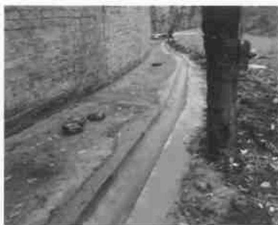
After the works

4. Current repair works at the facades of eleven cultural heritage monuments of the Preserve.