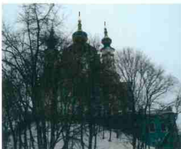
View of St. Andrew’s Church before repair and restoration works