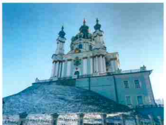
View of St. Andrew’s Church on the January, 2017.