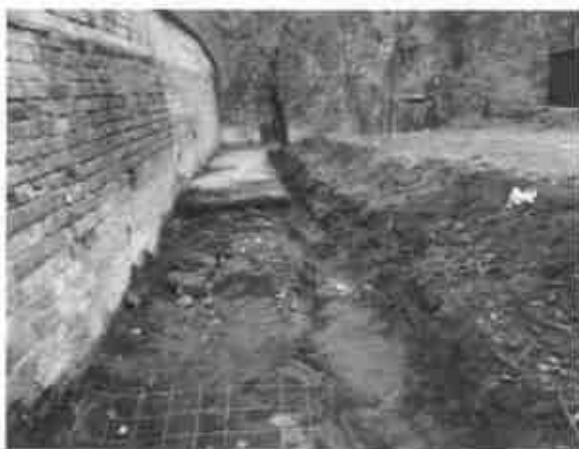
Before the works

surface drainage system along the west facade wall, injection of through cracks and fixing of the front brick laying, improvement of the surrounding territory.