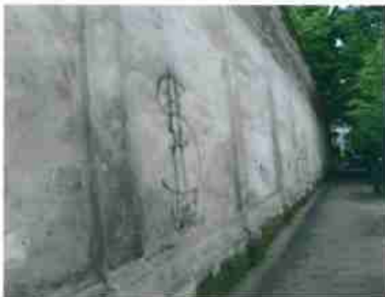
State before works

The works are continued according to the approved project “Repair and restoration works on the walls of the National Conservation Area “St. Sophia in Kyiv” on the Volodymyrska street, 24 in the Shevchenko district of Kyiv”. The works were completed on the part of the wall near the Striletska street and the Georgy by street (from Zaborovski gates to the Striletska street).