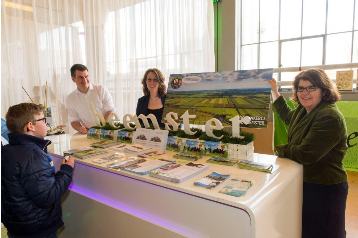
The Mayor of Beemster promoting 'her' World Heritage site and children from Kinderdijk interviewing Minister of Culture Jet Bussemaker