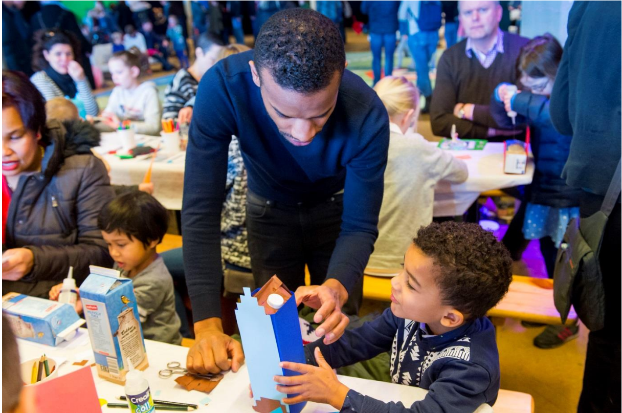
Building Amsterdam gable houses or eating cockles from the Wadden Sea