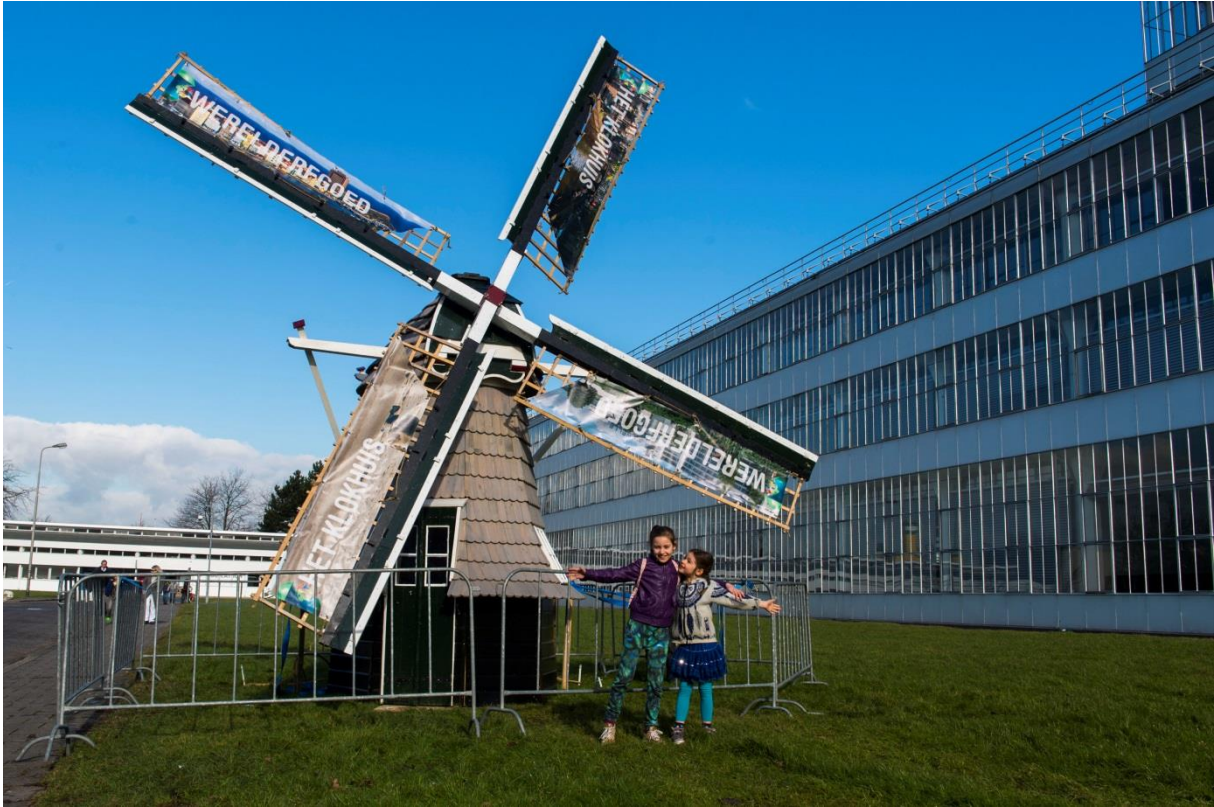
Mayor Ahmed Aboutaleb of Rotterdam opens the Klokhuis annual on-site event in the Van Nellefabriek; 6500 children and their parents participate