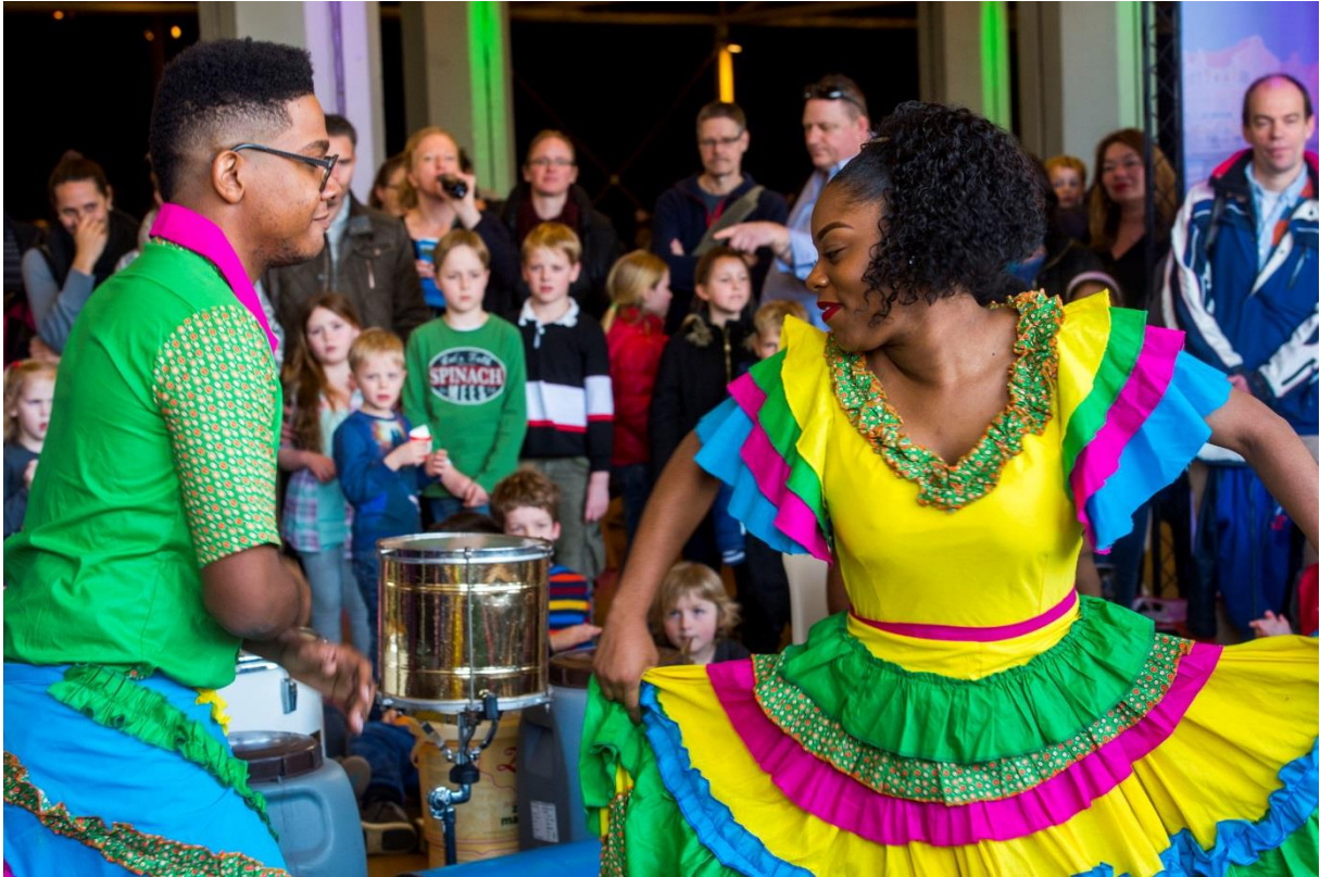
The rhythm of Willemstad Curaçao is multi-cultural!