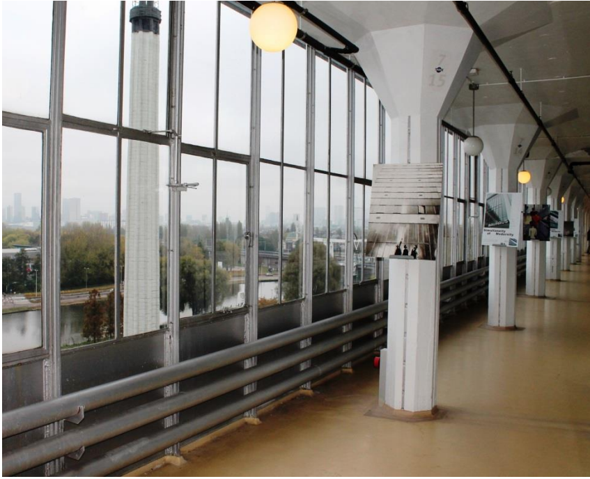
The exhibition floor