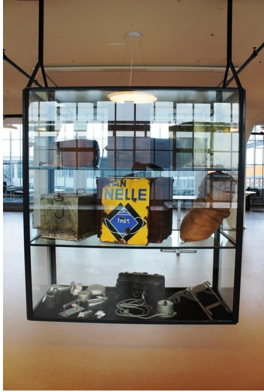
Display cases and information panels