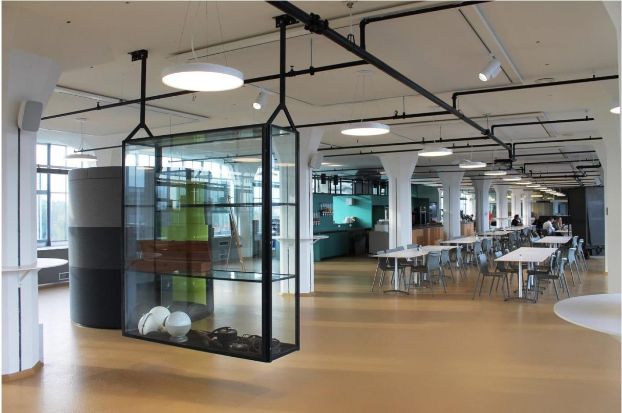
De Branderij, restaurant and visitor centre combined