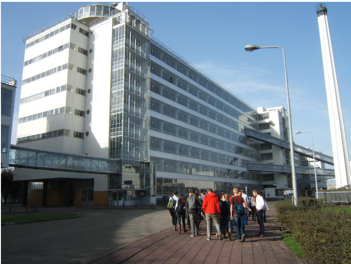
Design of the information billboards and guided tour on the complex

BRUIN BORD VAN NELLEFABRIEK SO - versie 01 - 10 MAART 2015 - SCHAAL 1:15 (A4) VARIANT-01