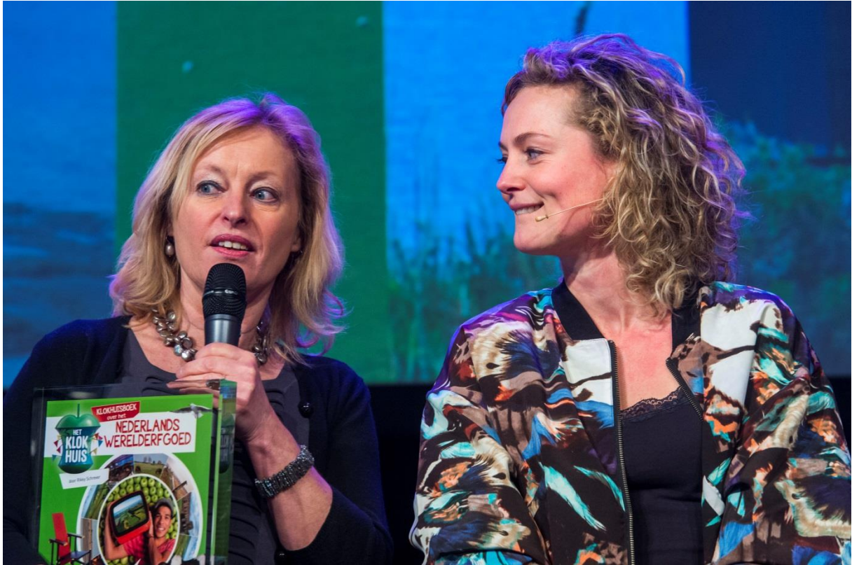
Klokhuis presenter Nynke offers the education kit to Minister of Culture Jet Bussemaker, while young soldiers play a game at the Defence Line of Amsterdam