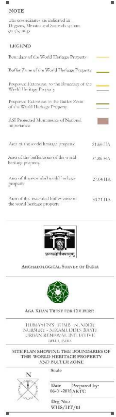
Map showing the revised boundaries of the property and the buffer zone