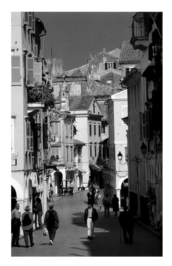
Street of Corfu