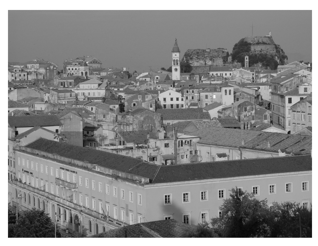
General view of the town