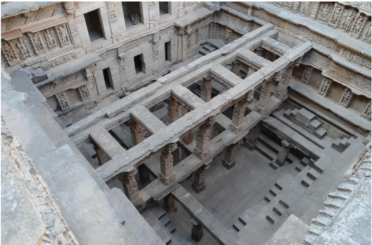
Bracing structure in the tank