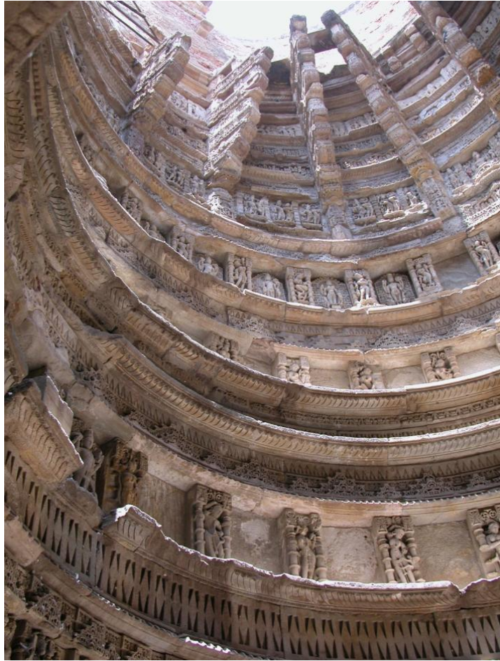
The well shaft