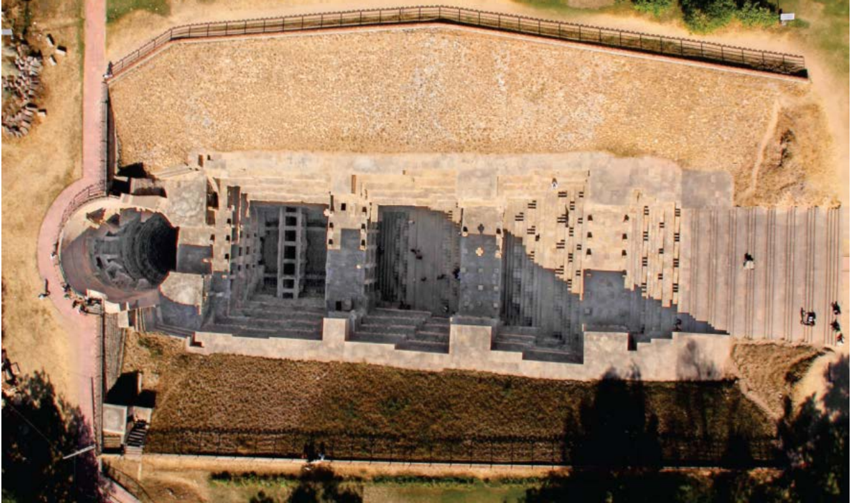
Aerial view of Rani-ki-Vav