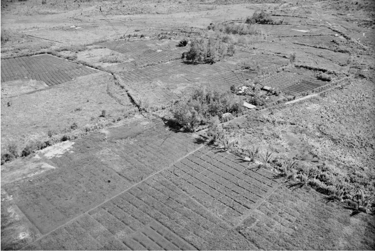
Characteristic agricultural landscape of the Upper Wahgi valley