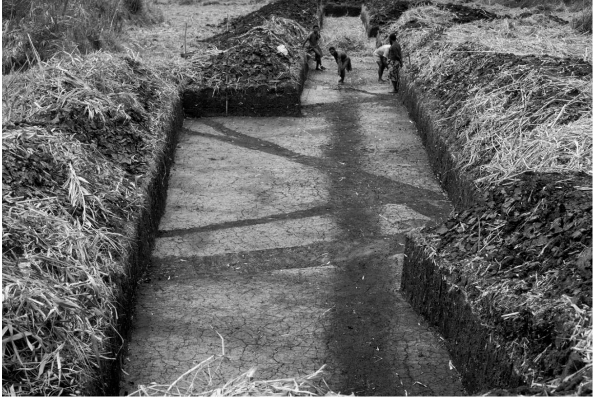
Trench containing multiple cross cutting ditches belonging to phase 3 and 5