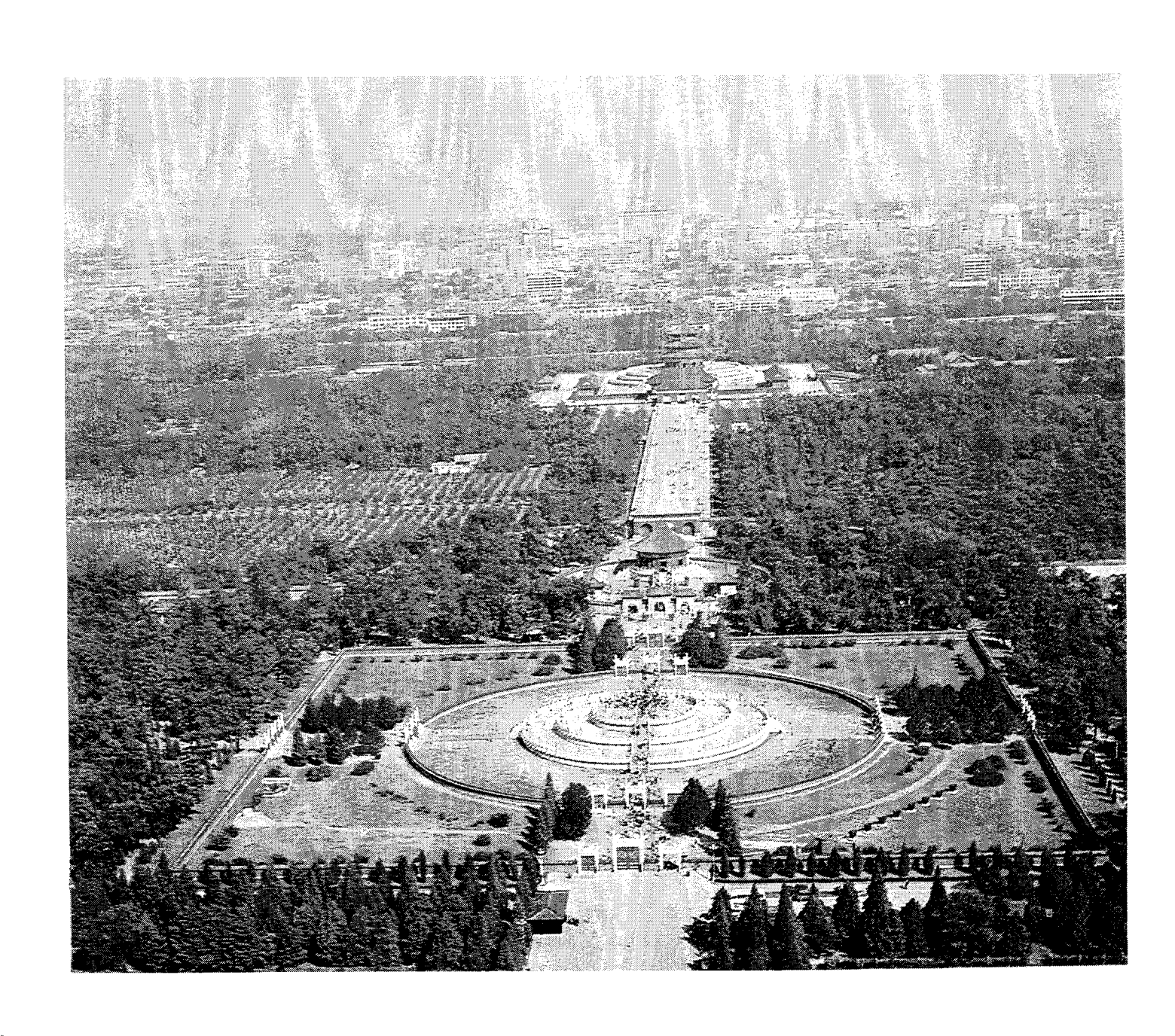
Le Temple du Ciel, autel sacrificiel impérial à Beijing / The Temple of Heaven, an imperial sacrificial altar in Beijing : Vue aérienne / Aerial view