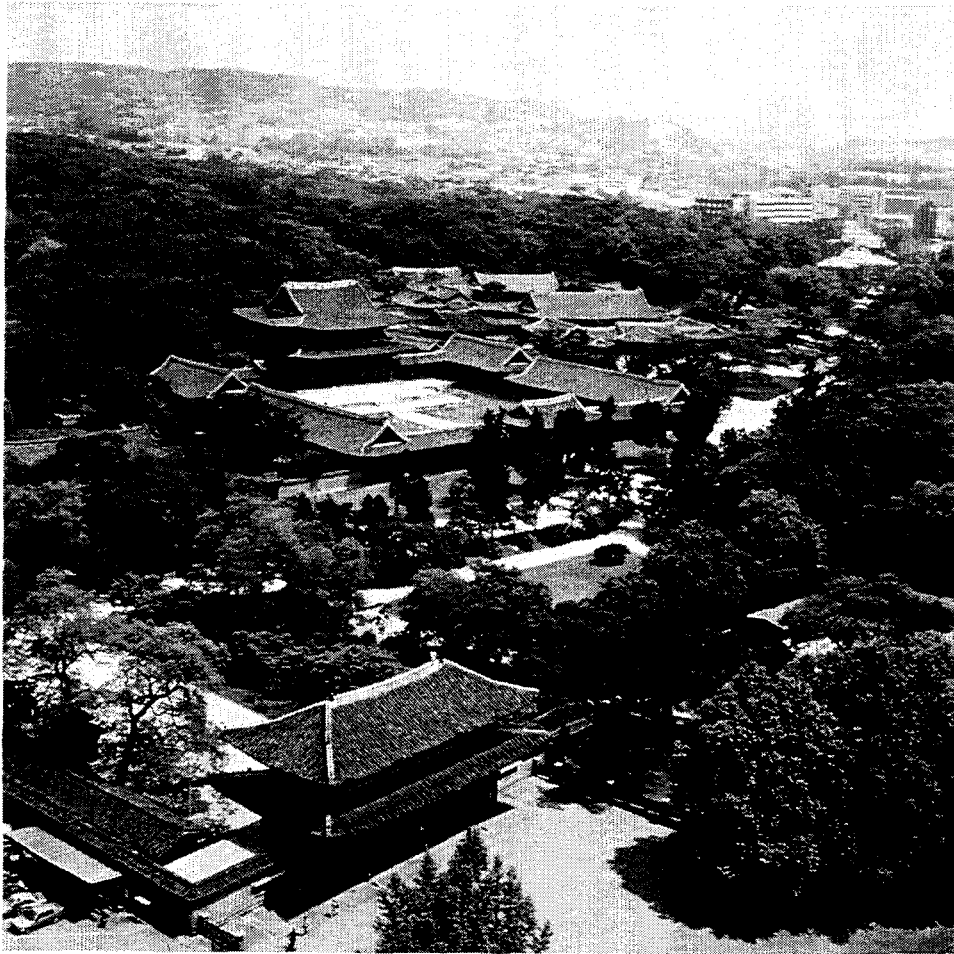
Ch'angdokkung : Vue d'ensemble / Overall view