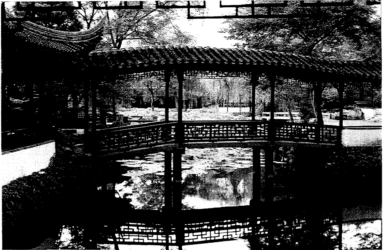
Suzhou : Le pont du petit arc-en-ciel volant dans le jardin de l'Humble Administrateur / The small Flying Rainbow Bridge in the Humble Administrator's Garden