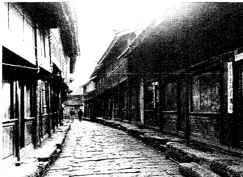
Lijiang : Rue typique de la ville / Typical streetscape in Lijiang