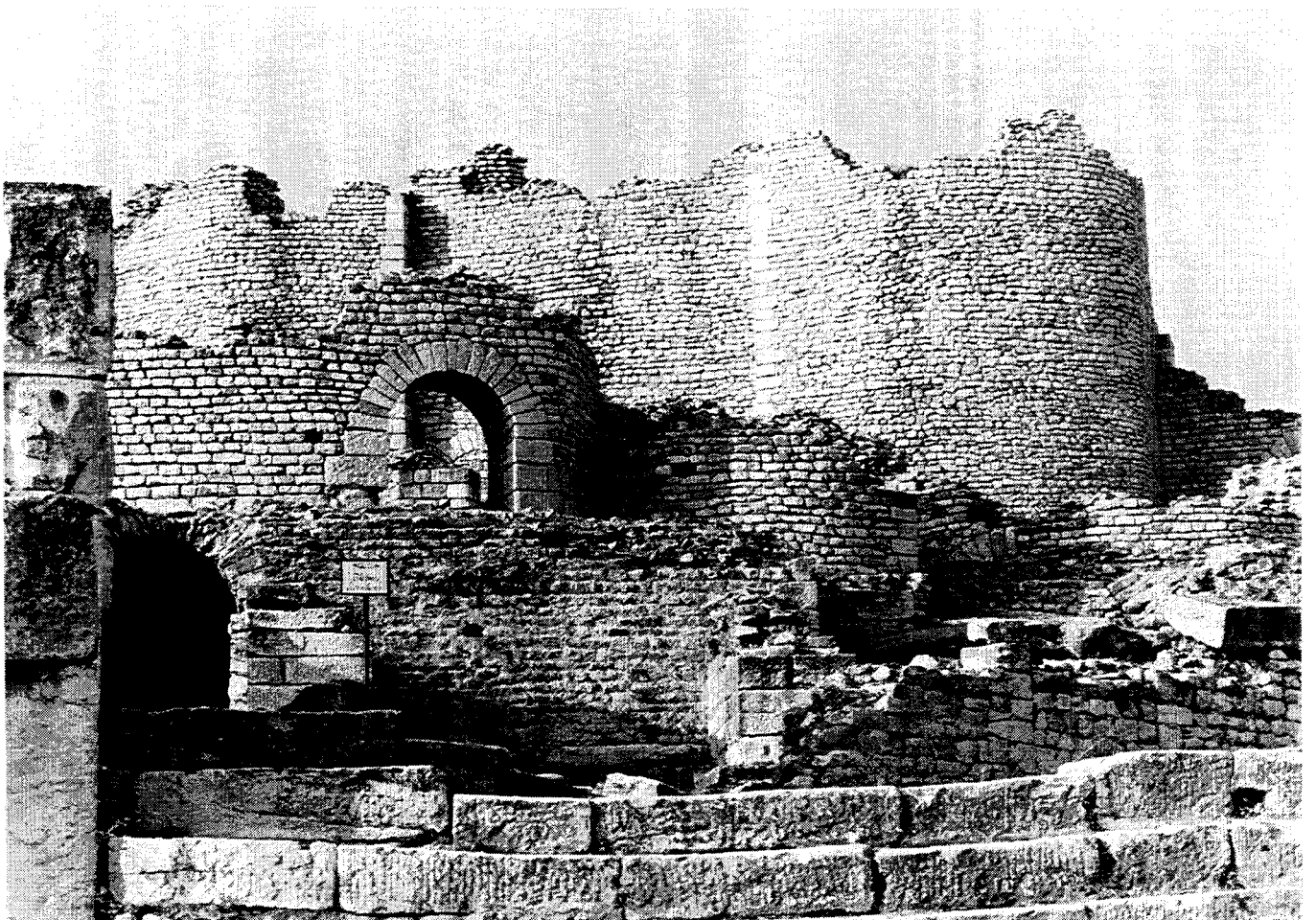
Dougga : Les Thermes Liciniens / The Licinian Baths