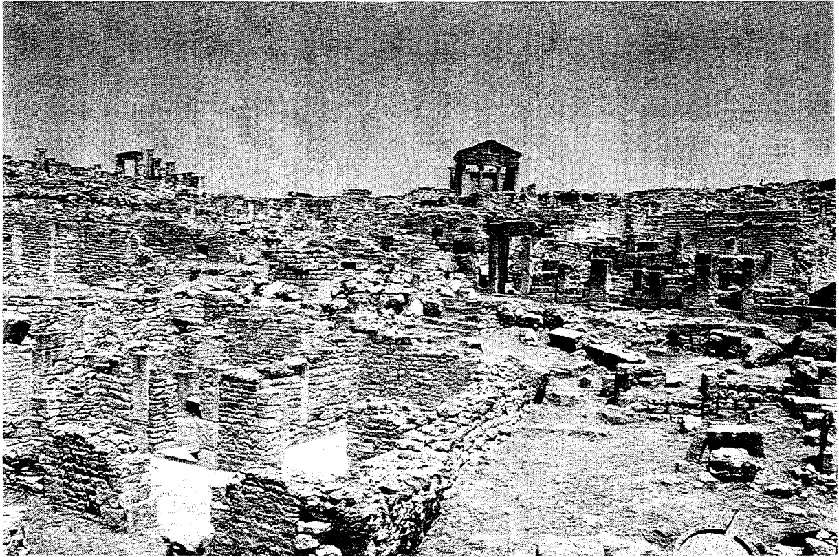
Dougga : Vue d'ensemble du site / General view of the site