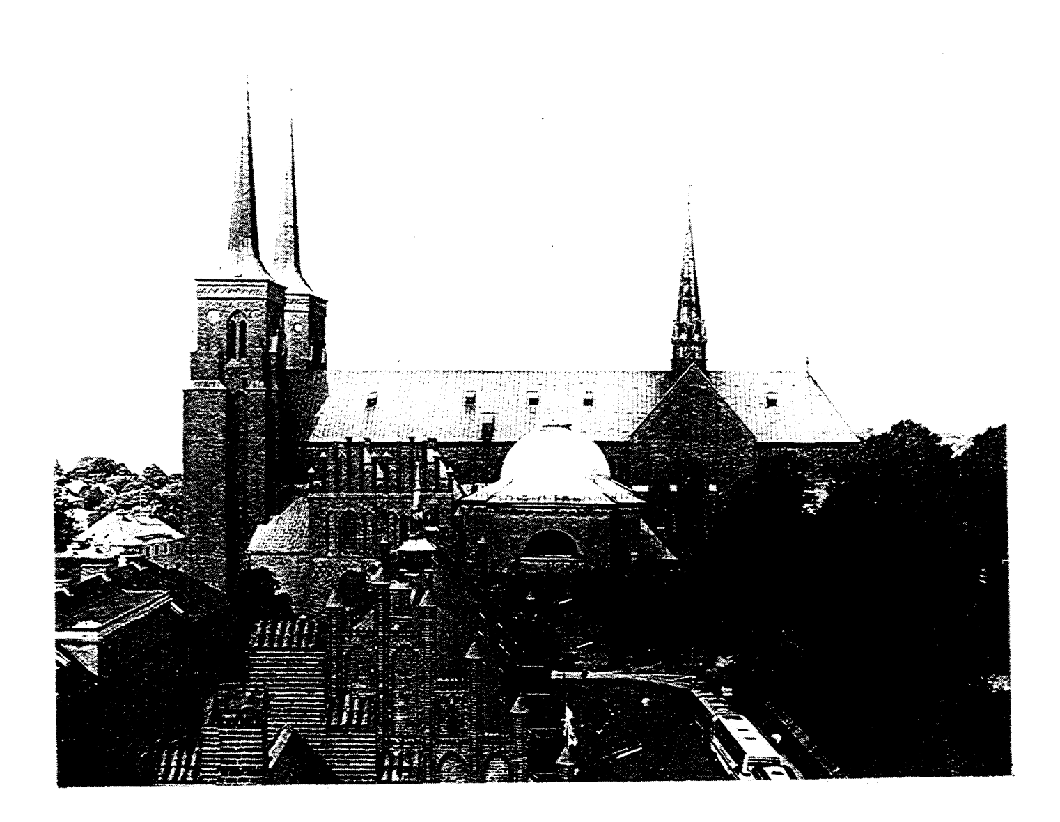
Roskilde : façade sud de la cathédrale, chapelle de Christian I et chapelle de Frédéric V / southern facade of the cathedral, Christian I chapel, and Frederik V chapel