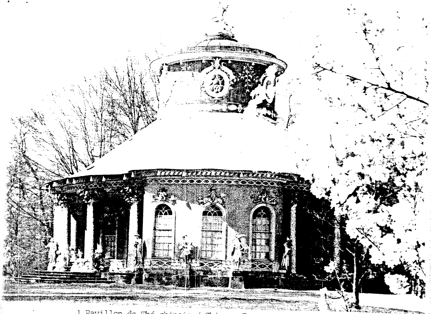
1. Pavillon de Thé chinois / Chinese Tea-House 2. Pavillon de Thé chinois, grand salon / Chinese Tea-House, Main Hall