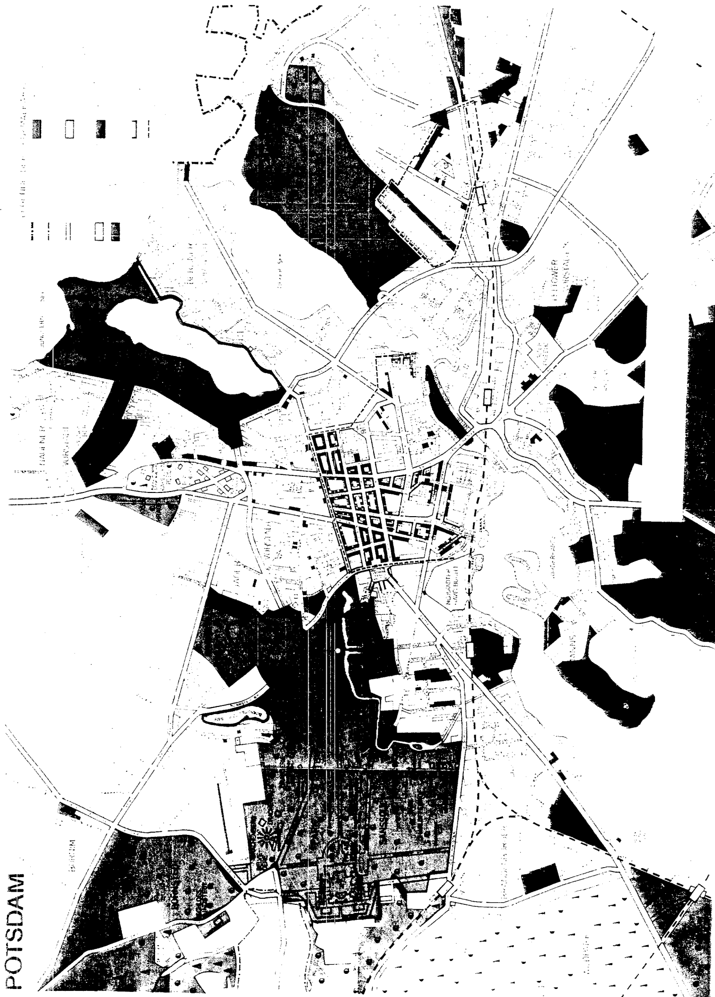
Châteaux et parcs de Potsdam-Sanssouci / Castels and Parks of Potsdam-Sanssouci, 1985