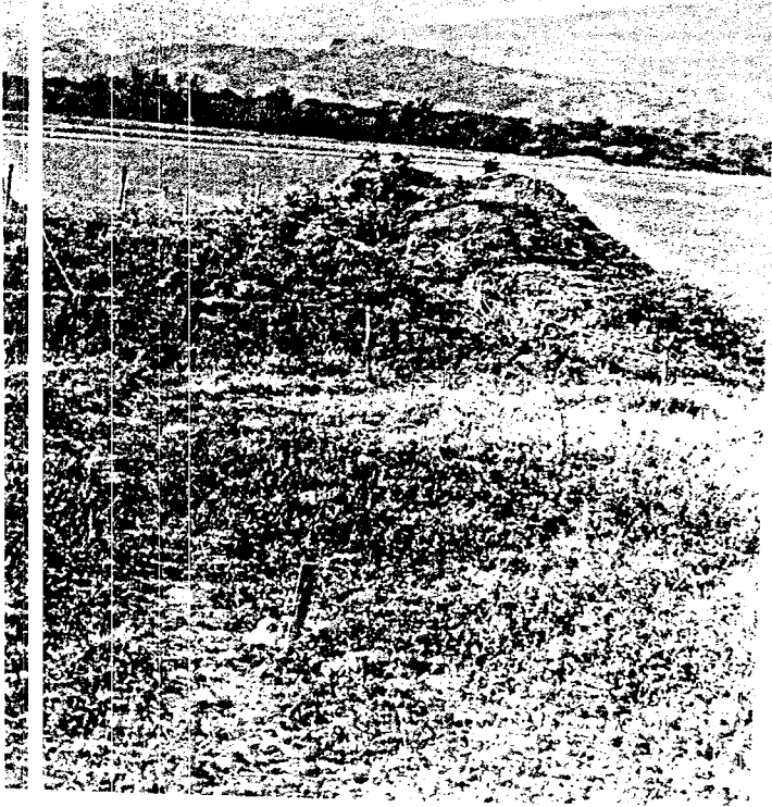
Site de La Isabela / Site of La Isabela