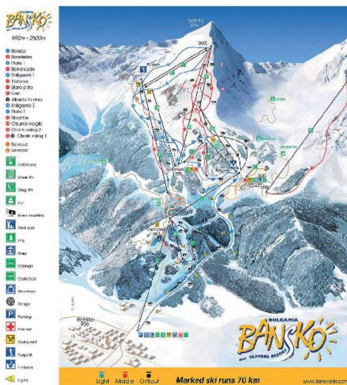
Photo 1: The higher part of the Bansko ski resort which was constructed within the existing World Heritage property. This part of Pirin National Park is proposed for exclusion from the World Heritage property and inclusion in a new buffer zone.

Map 3: Sketch map of the Bansko ski resort still showing the closed Ctzurna mogila ski lift and ski run to the right. This closed ski lift and ski run is outside both the tourism zone and zone of buildings and facilities, which are proposed for exclusion from the World Heritage property and inclusion in a new buffer zone, and will thus remain within the property. Plans to re-open this ski lift and ski run are against the management plan and should not be permitted.