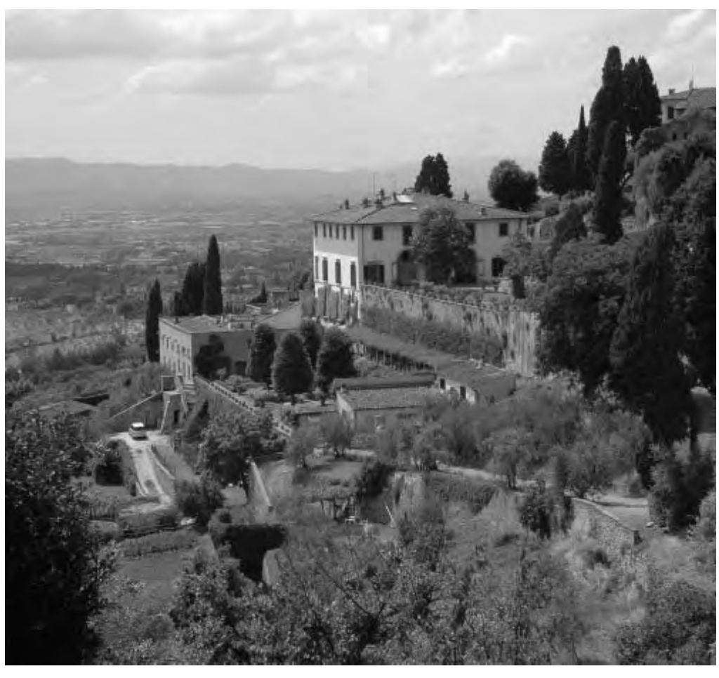
Villa Medici in Fiesole, general view