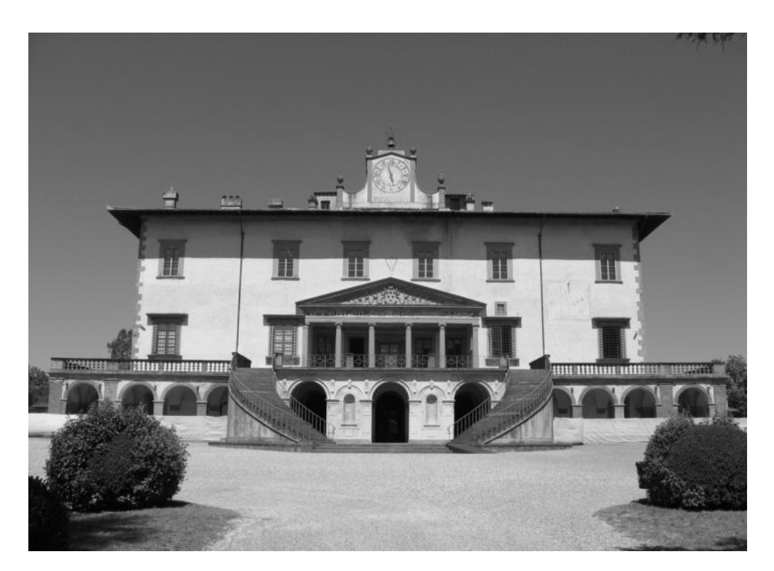
Villa di Poggio a Caiano, main façade