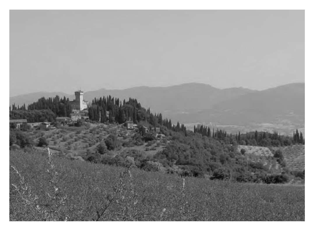
Villa del Trebbio, general view