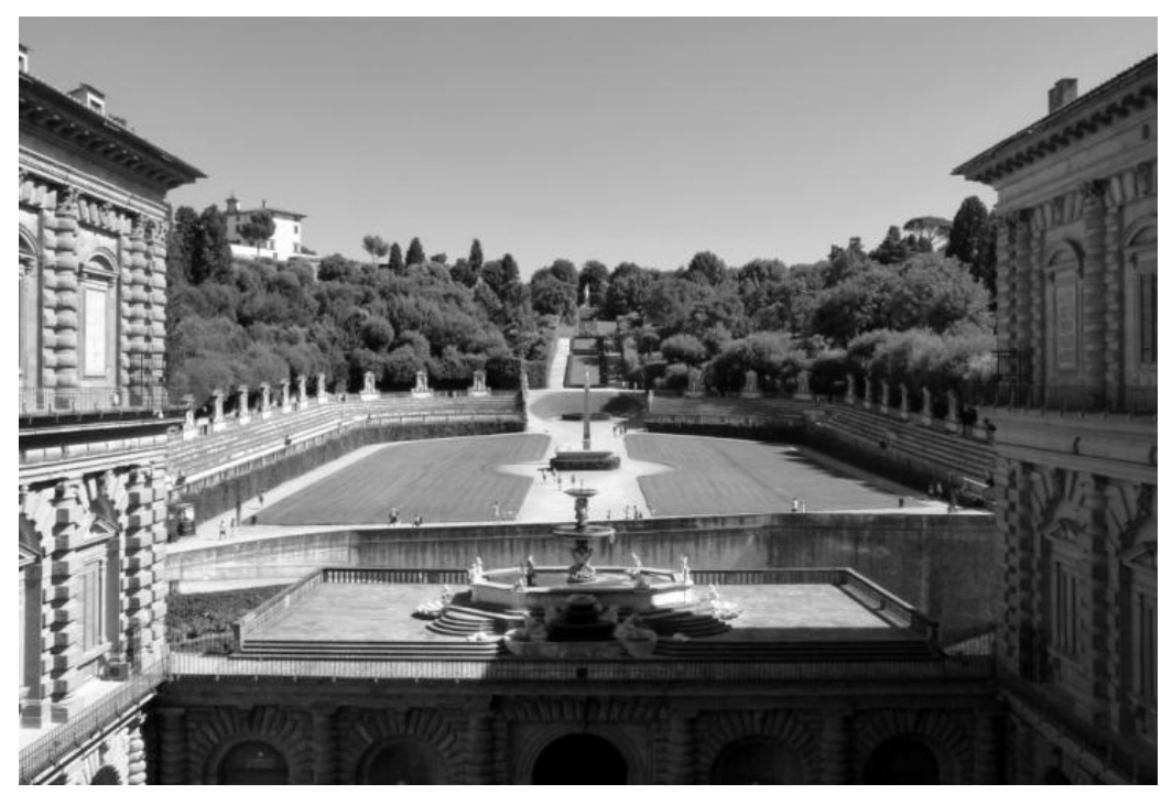
Boboli Gardens, general view