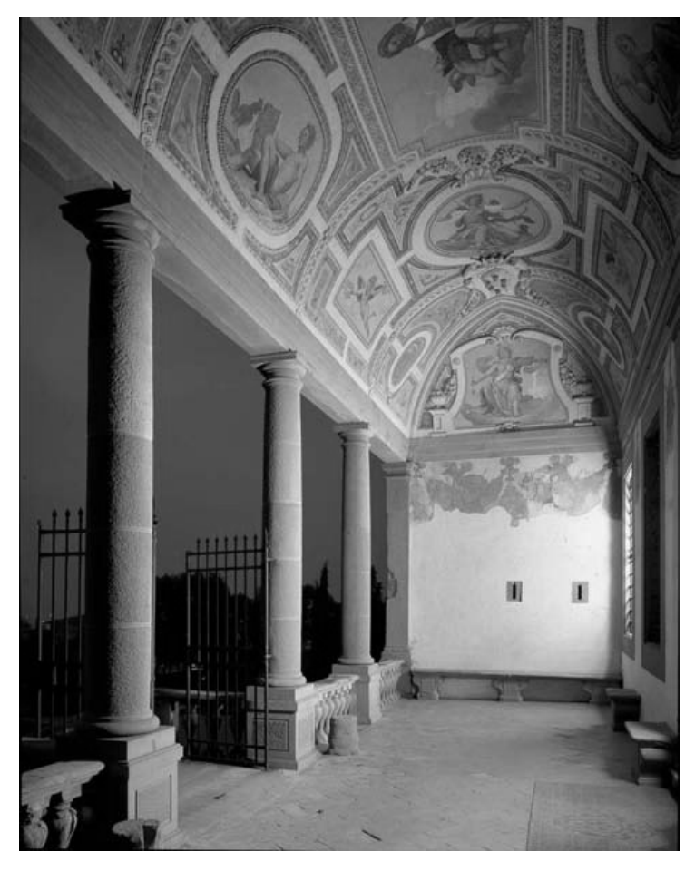
Villa di Artimino, loggia