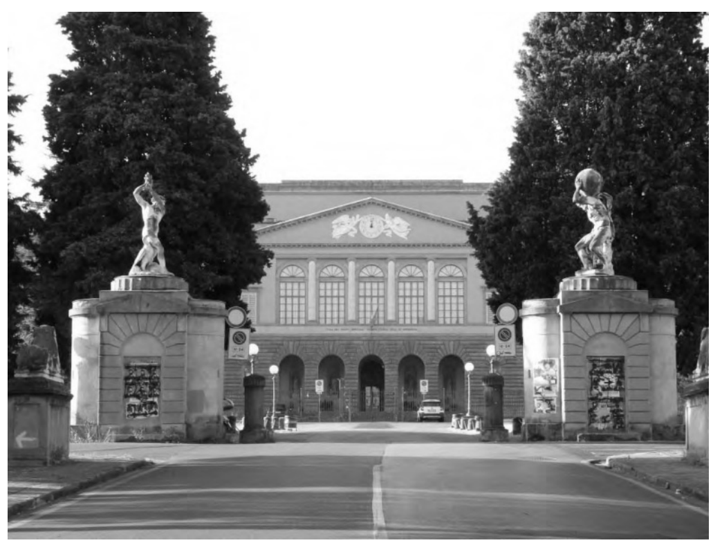
Villa del Poggio Imperiale, main façade