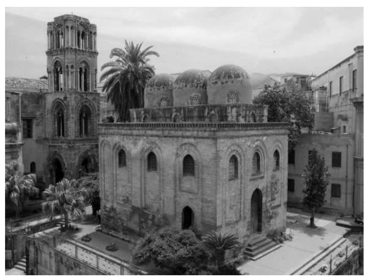
Palermo: Church of San Cataldo