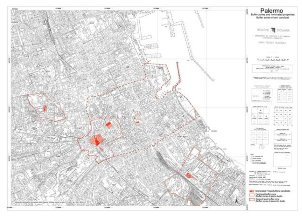
Revised map showing the boundaries of the nominated property of Palermo