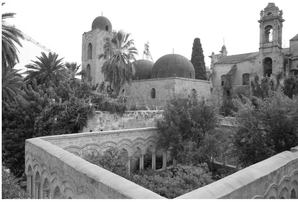
Palermo: Church of San Giovanni degli Eremiti