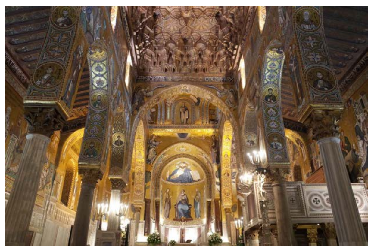
Palermo: Royal Palace, the Palatine Chapel