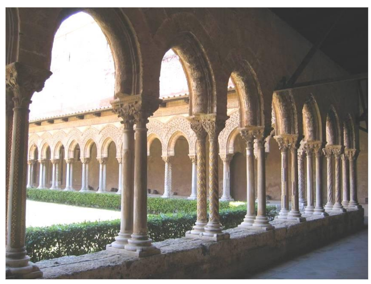
Monreale Cathedral, cloister