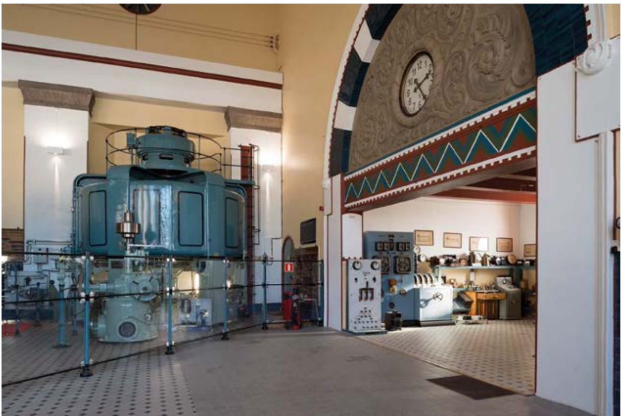
Tinfos II Power Plant