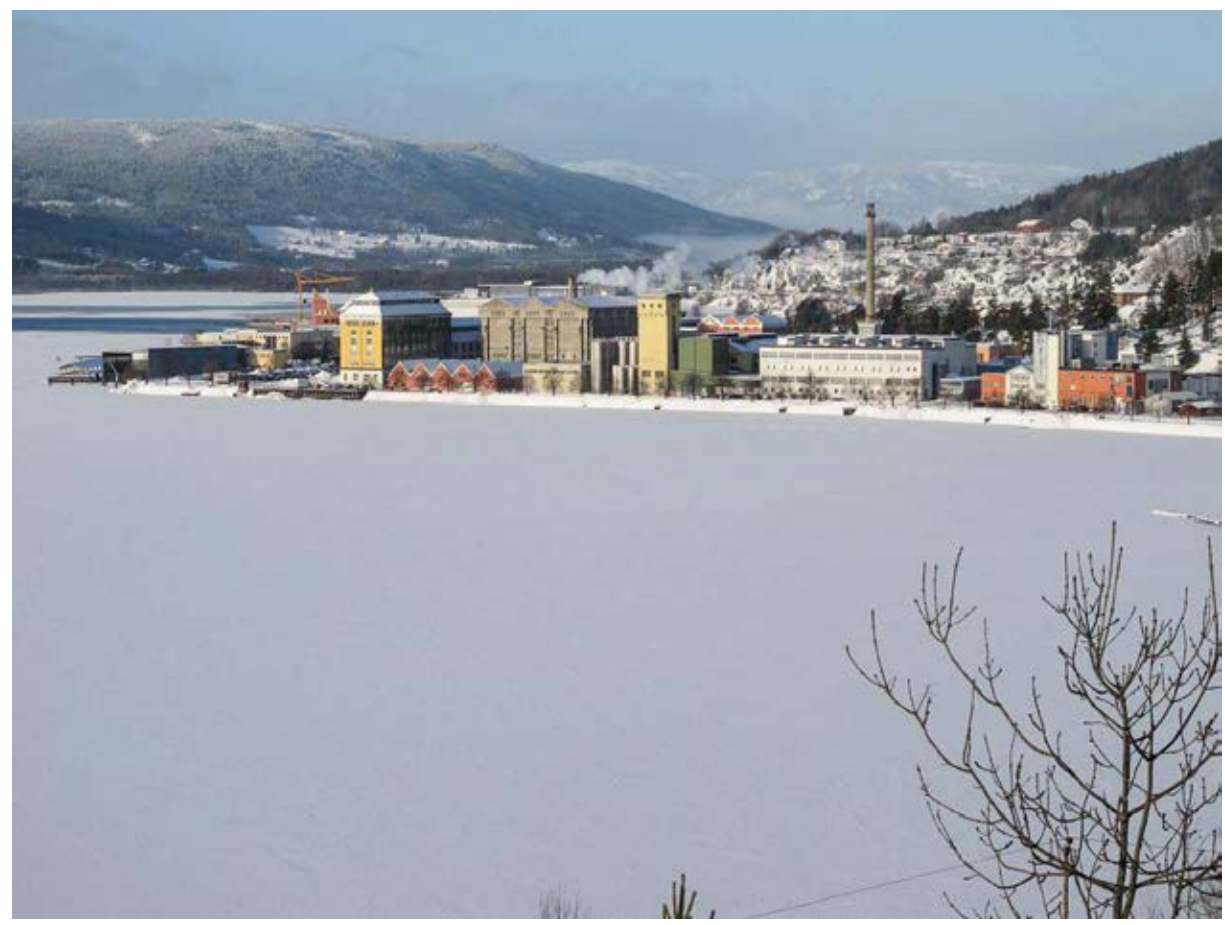
Notodden, Hydro Industrial Park