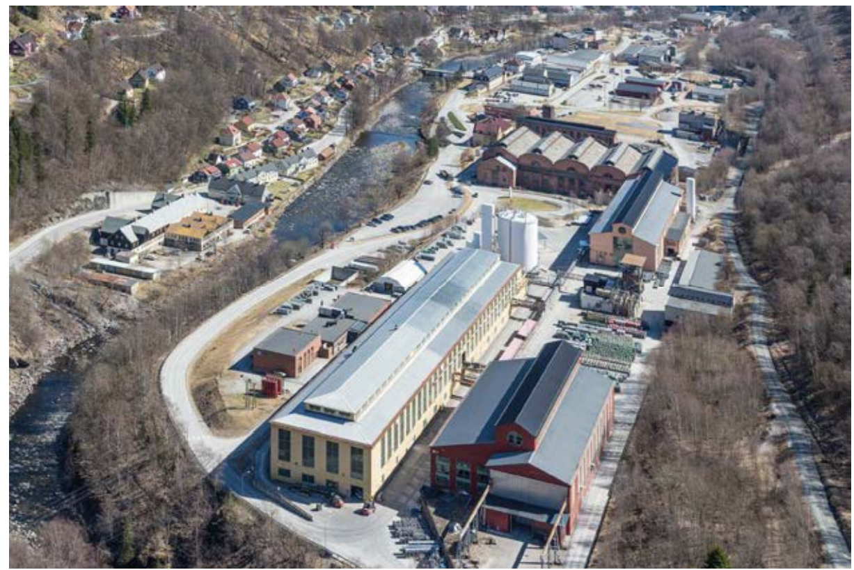
Rjukan, Hydro Industrial Park