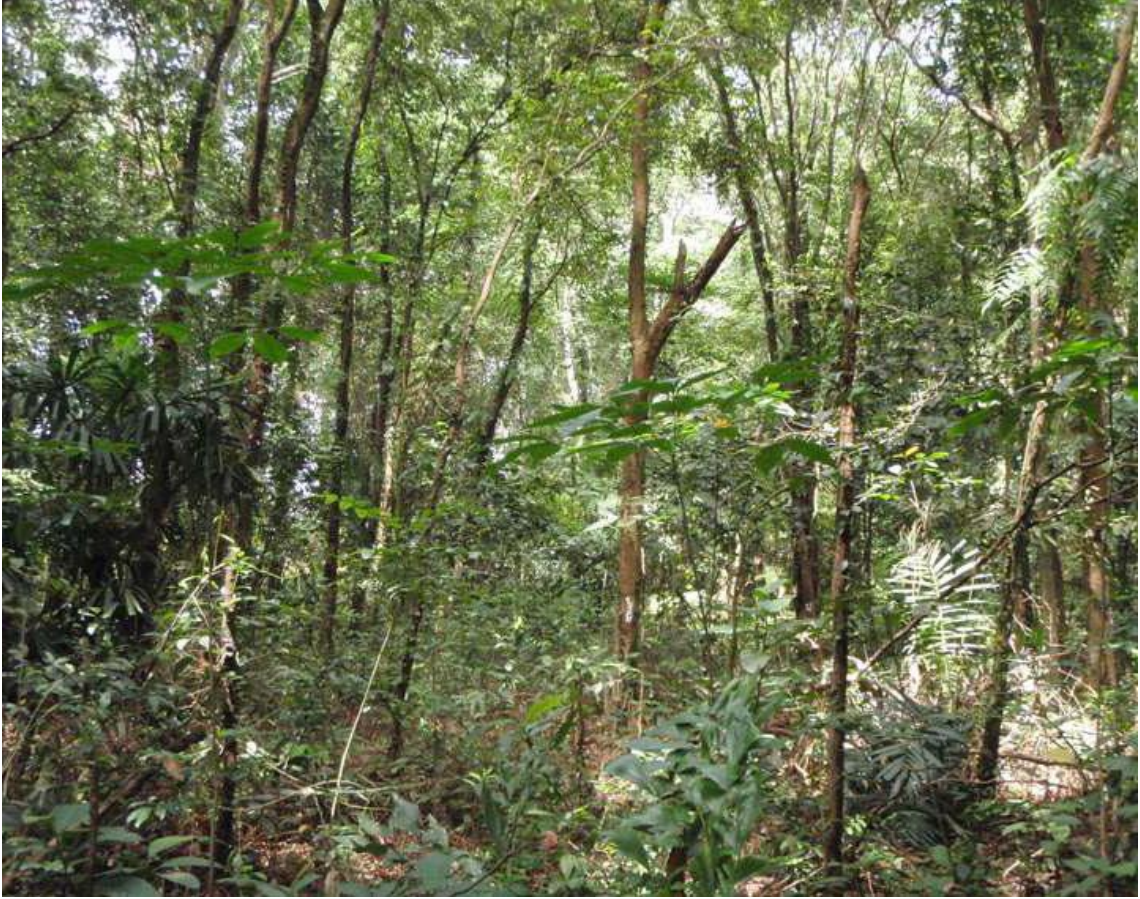
Tyersall Learning Forest