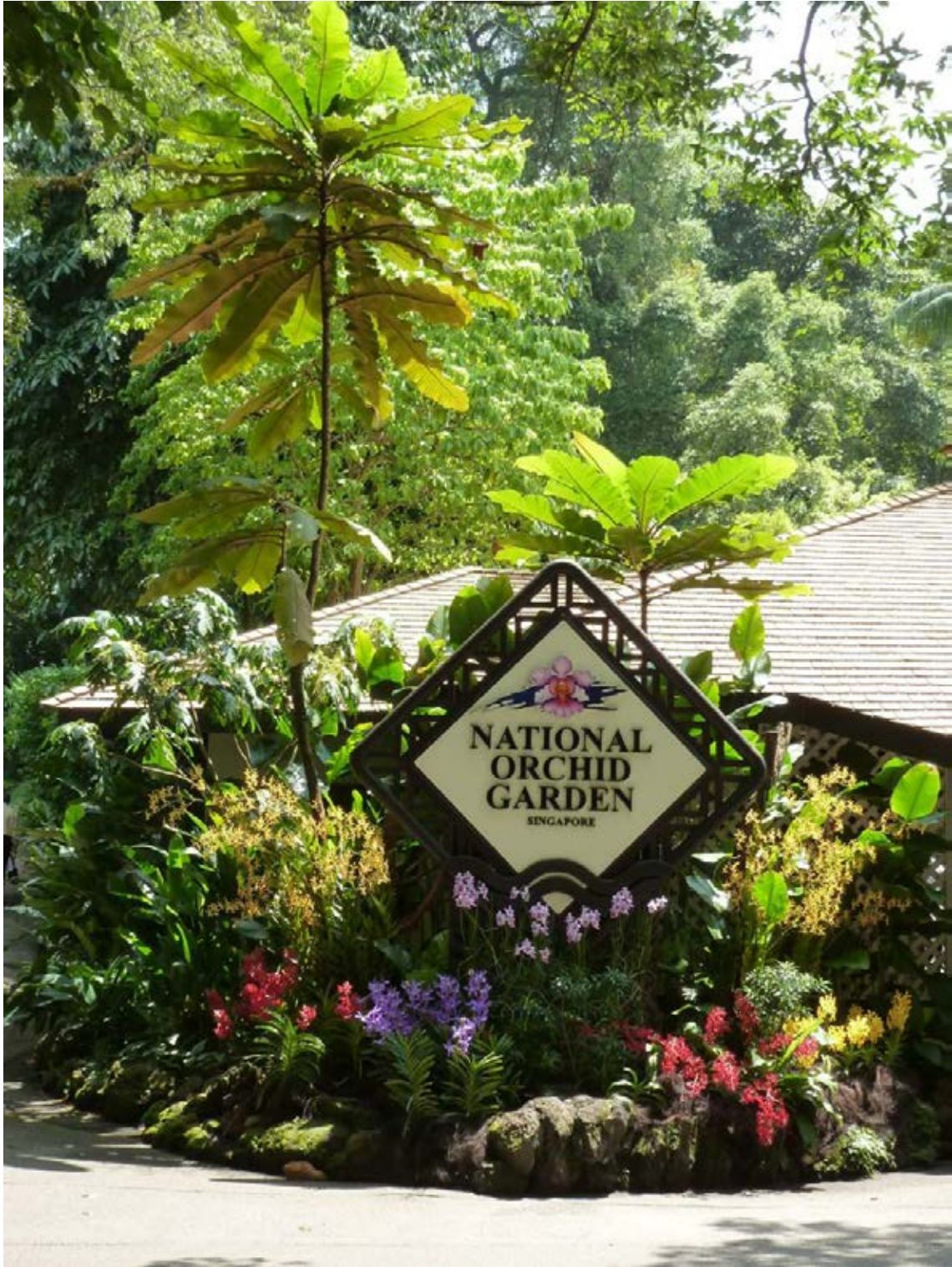
The National Orchid Garden