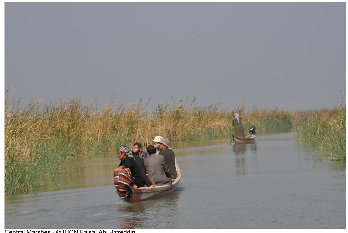
Central Marshes